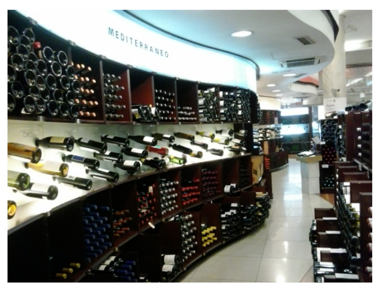
Beautiful wine store designs