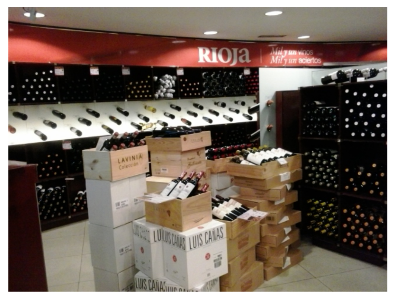
Wines organised by wine region (Denominación de Origen-D.O.) \label{eq:D.O.}