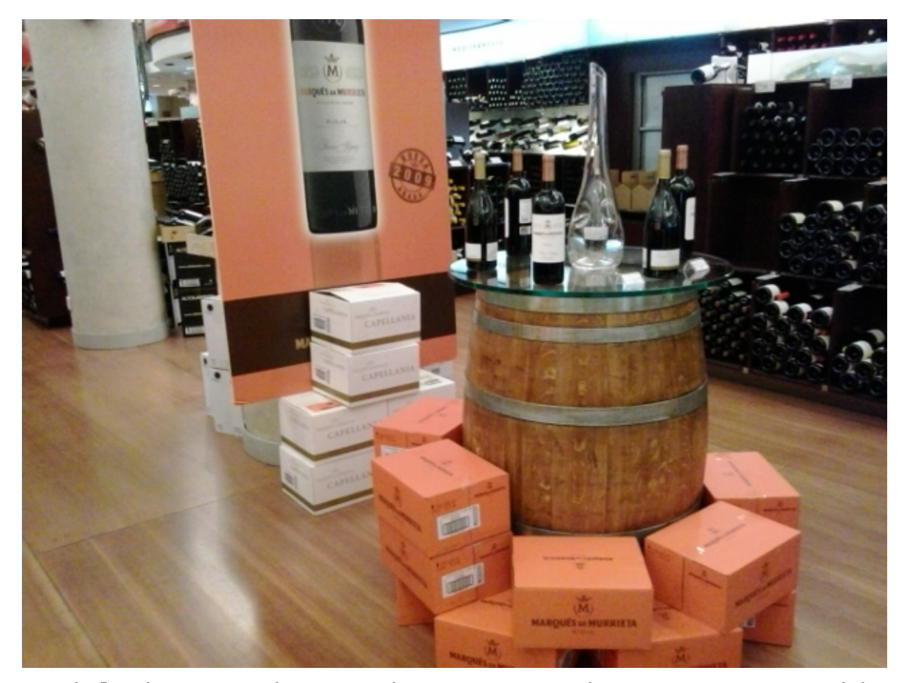
Special themes and promotions encouraging you try something new