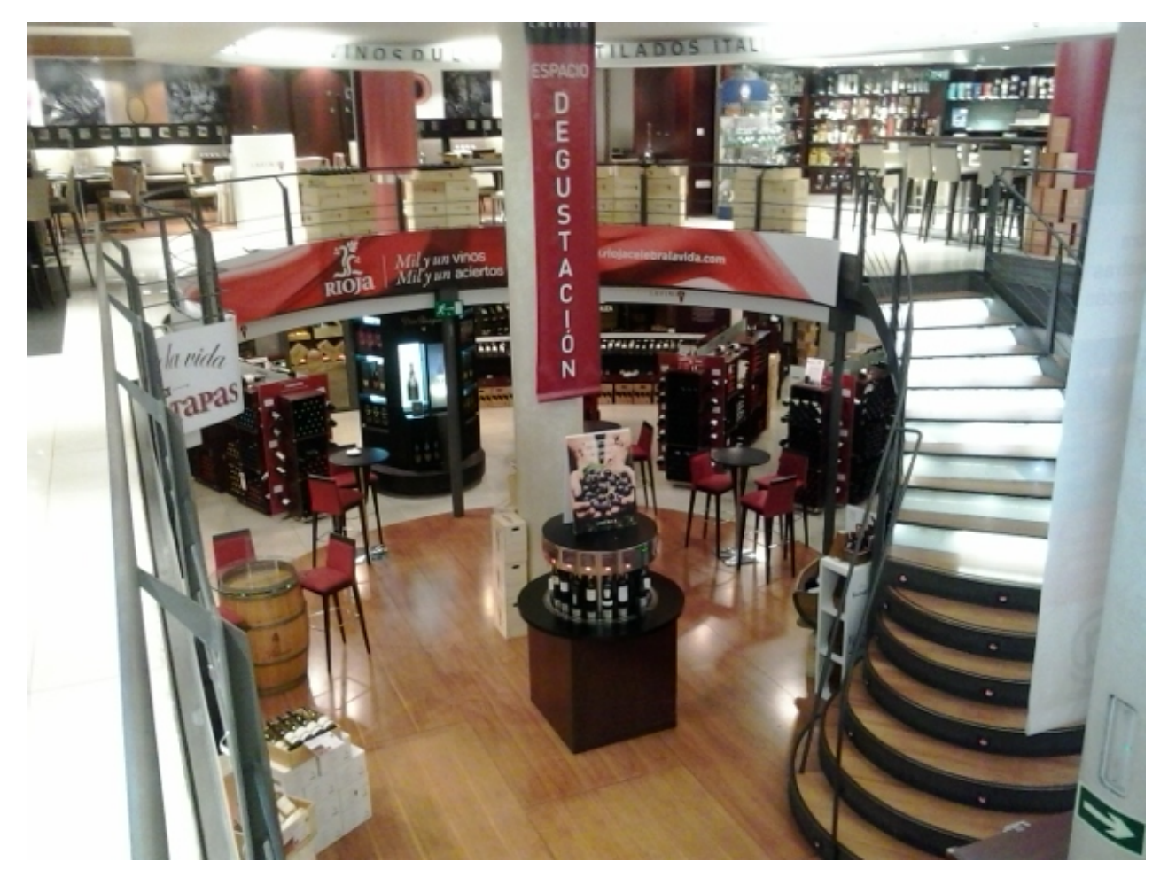
Restaurant on top floor, with decanting machines for wine tasting below