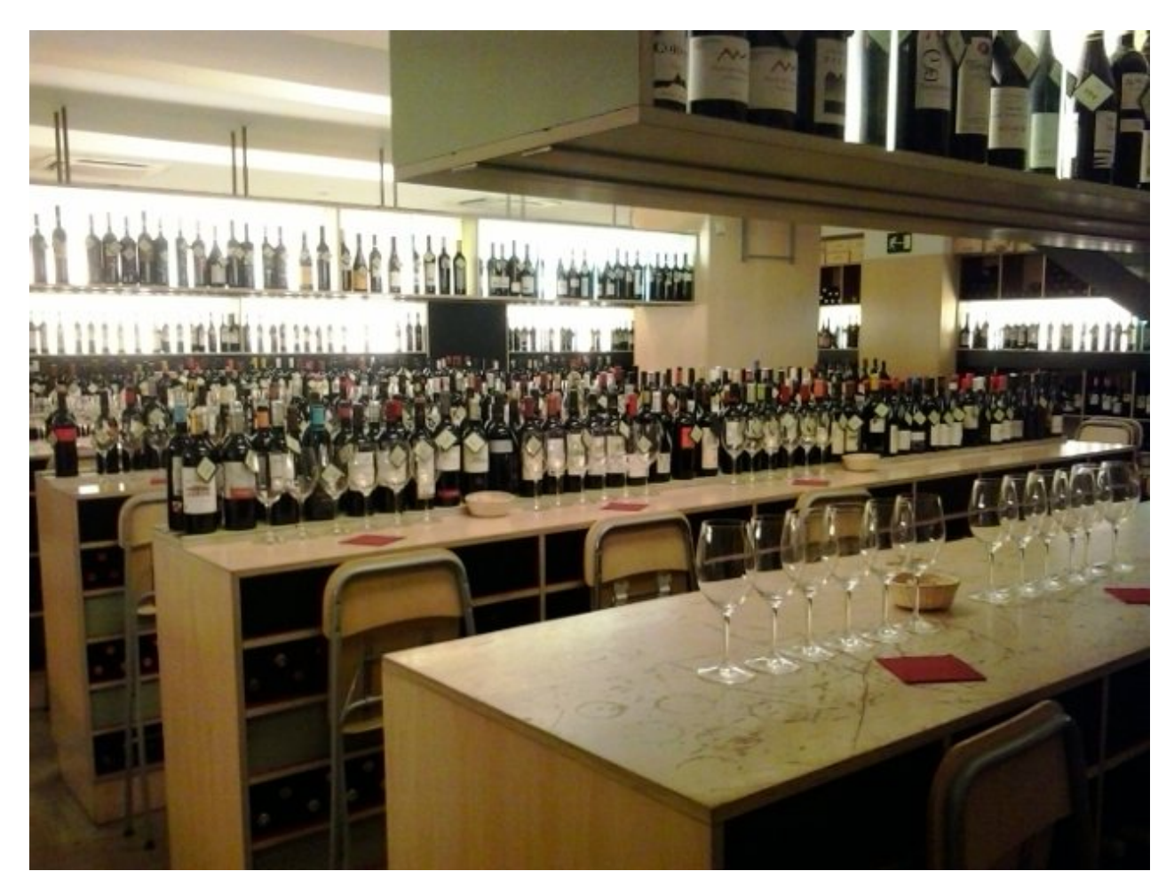
Each wine bottle has its own little lovingly added paper price tag

If you already know a little about wine, the staff of Enoteca Barolo can help you out with suggestions for new wines to try, and you can learn more from their regular wine tasting courses. This month alone they have over 8 tasting courses, ranging from almost extinct grape wine and cheese pairing, to a progressive Italian wine tasting course.