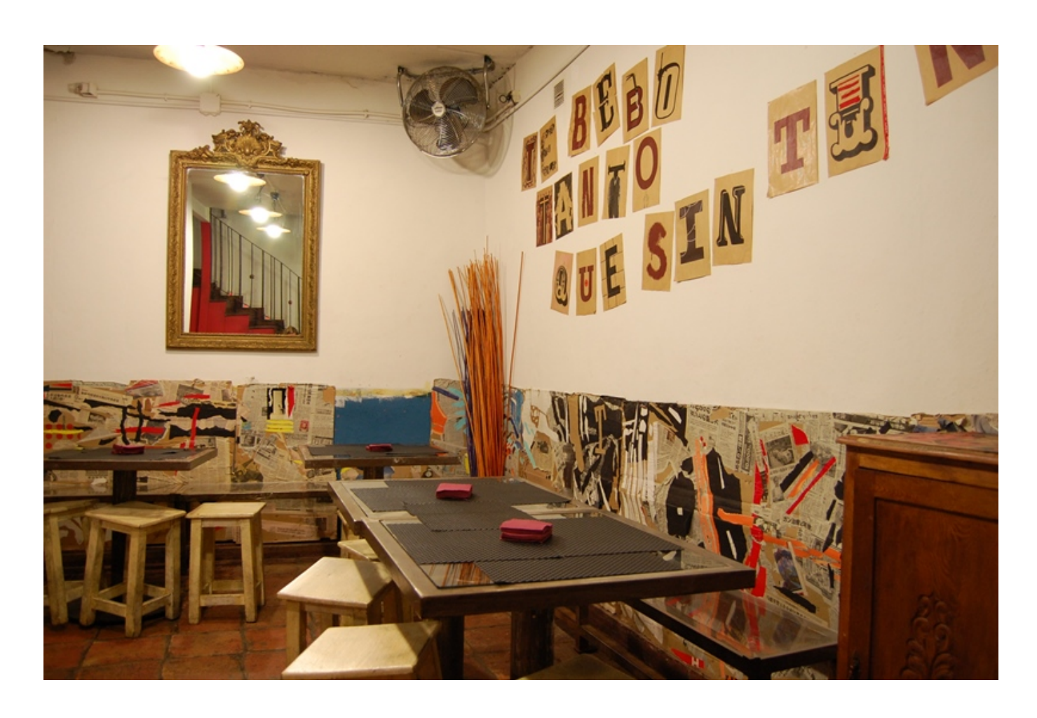
Calle Cava Baja, 7 www.laconchataberna.com