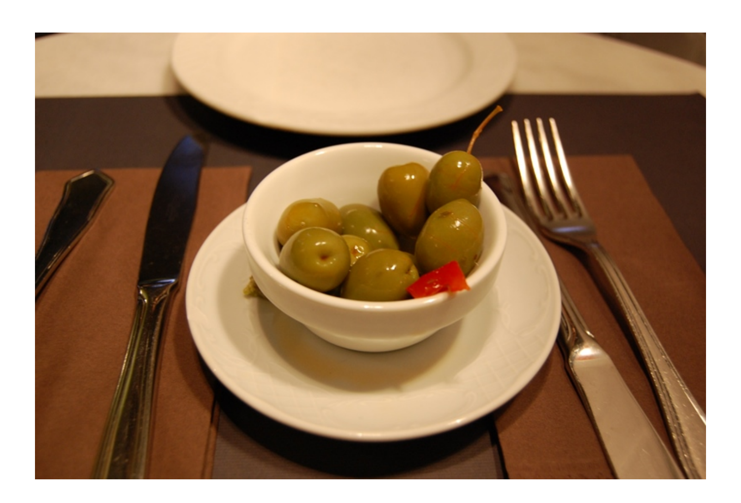
Plaza Puerta de Los Moros, 4 www.juanalalocamadrid.com