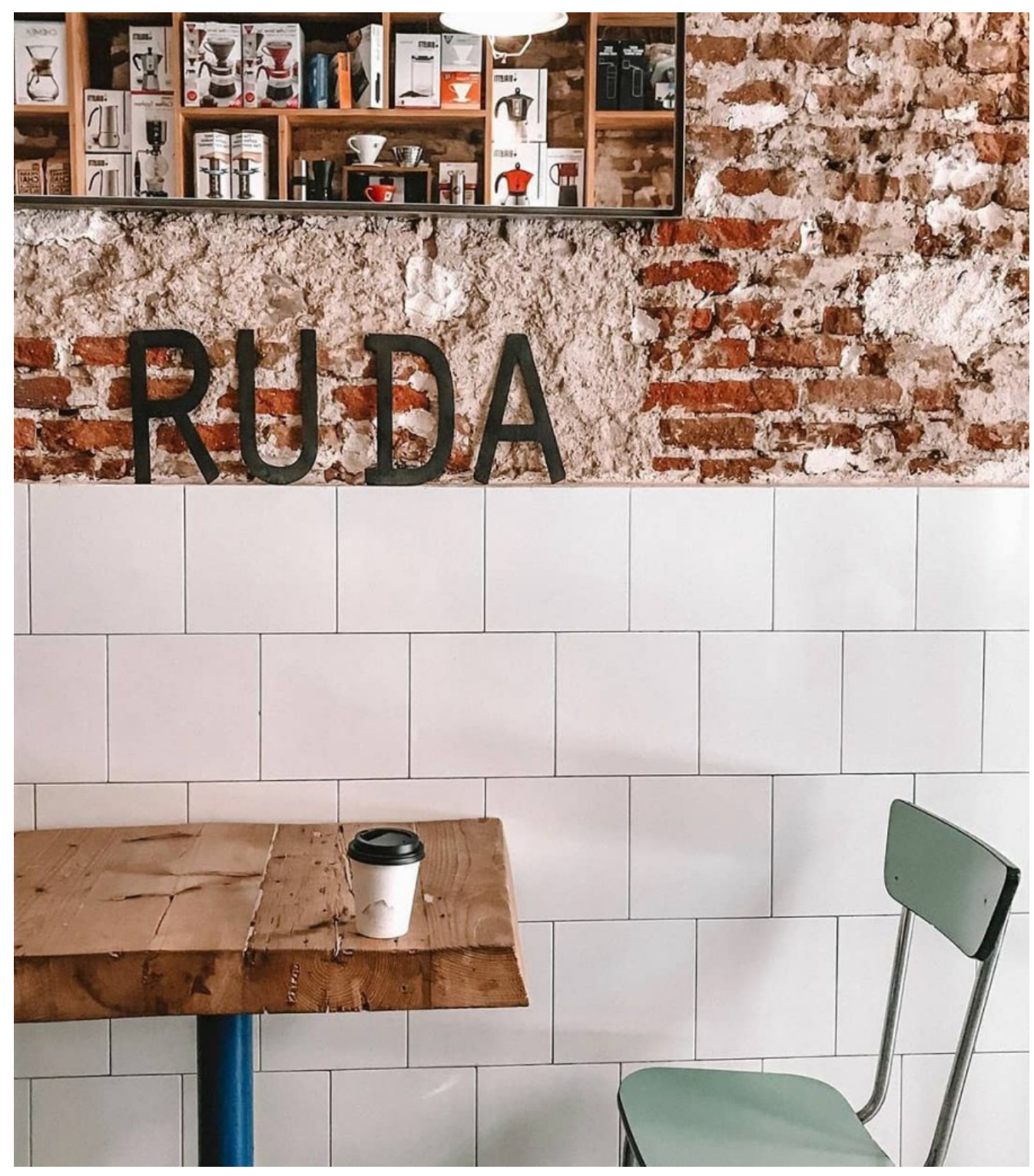
Best for: Cuteness. Small but perfectly formed.