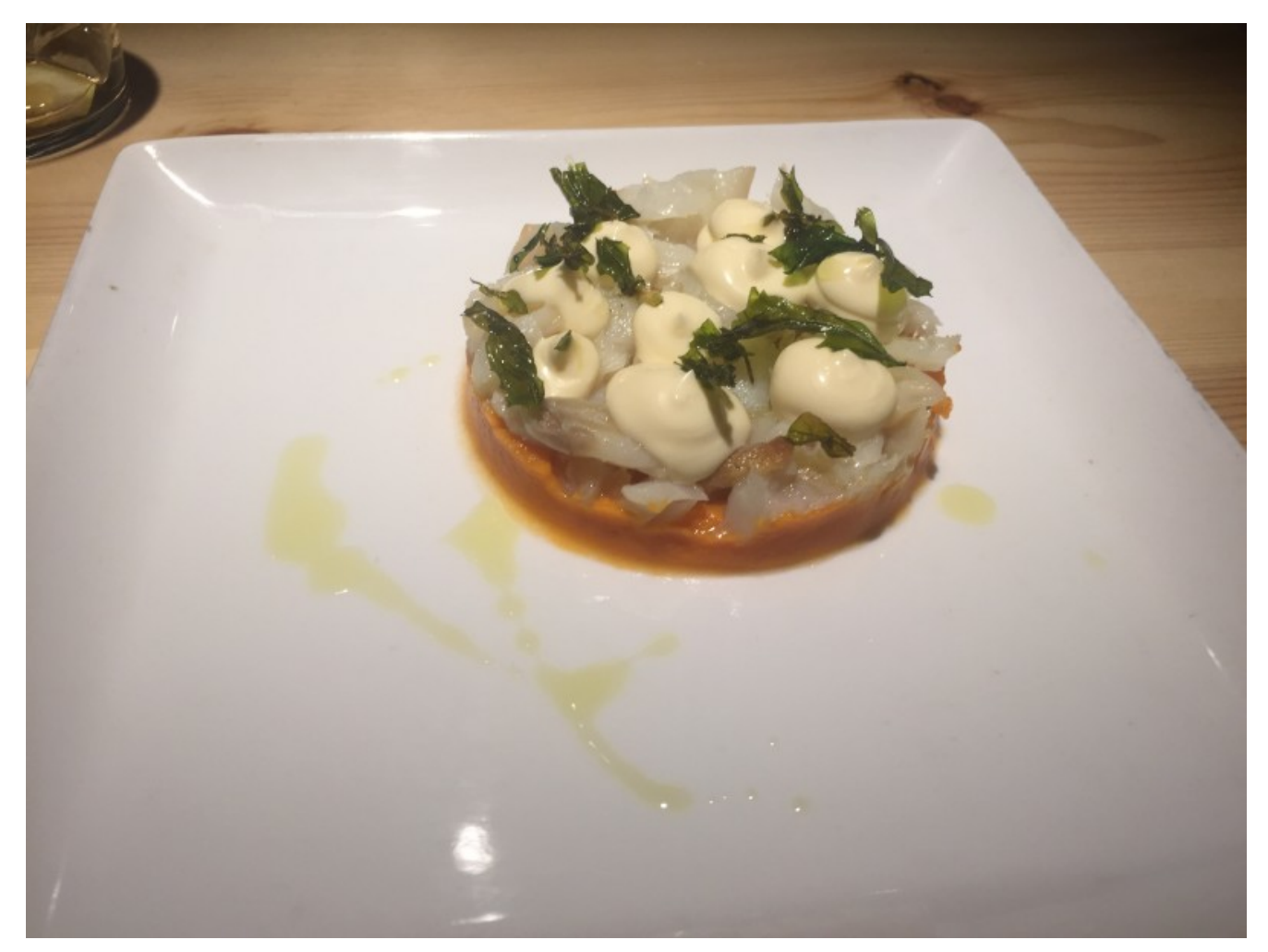
Delicia de bacalao

...and one of my favorite meats, solomillo de buey on top of a pimientos de padrón mustard.