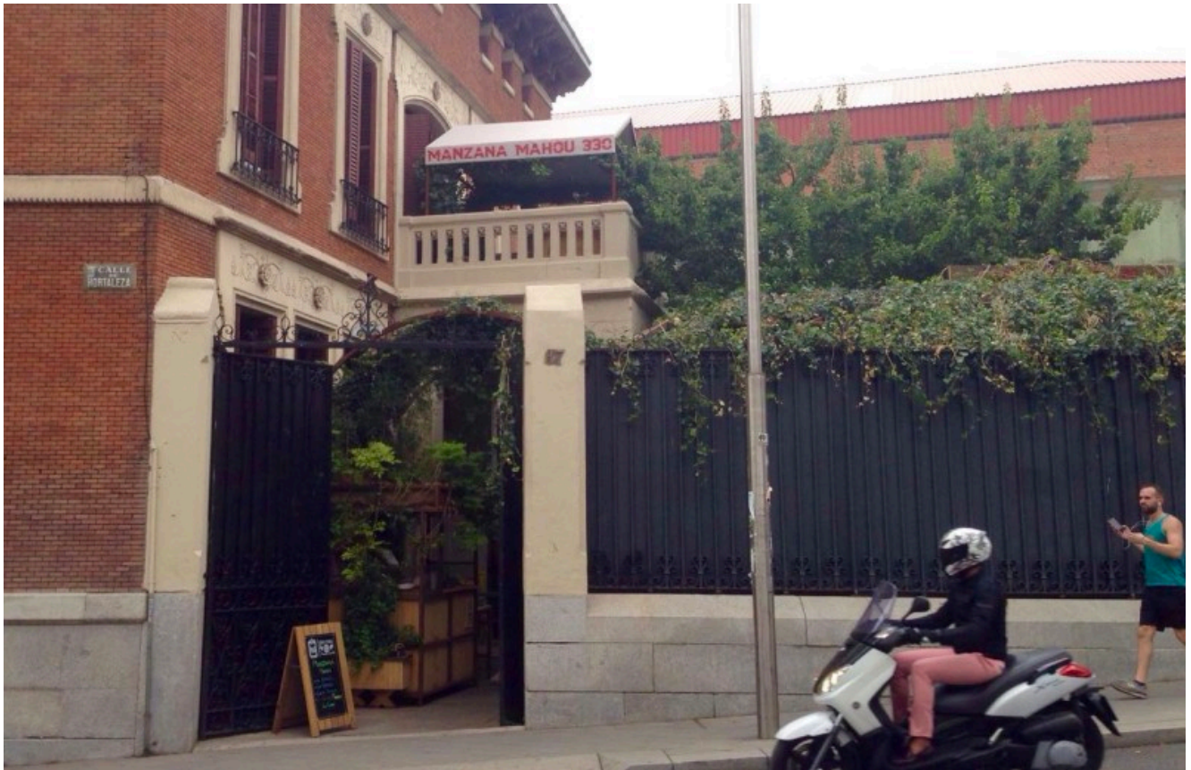
Entrance on Calle Hortaleza

Open Monday to Sunday, from 11am to 1am, Manzana Mahou is a great opportunity to try some of Madrid's greatest restaurants at a more affordable price while enjoying art and a few beers.