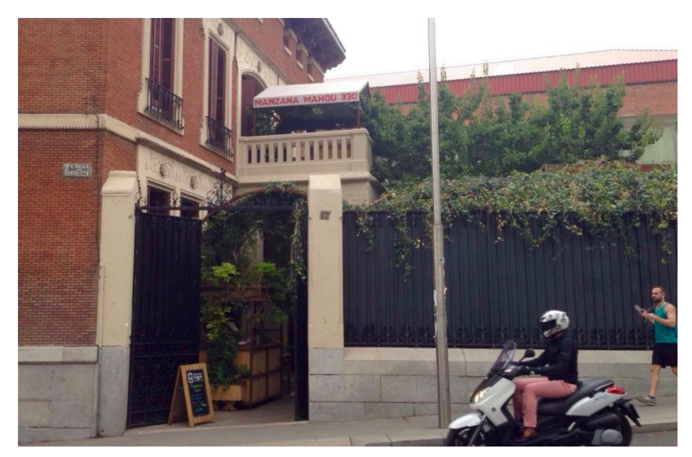
Entrance on Calle Hortaleza

Open Monday to Sunday, from 11am to 1am, Manzana Mahou is a great opportunity to try some of Madrid's greatest restaurants at a more affordable price while enjoying art and a few beers.