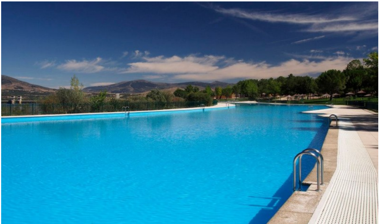
Buitrago de Lozoya by Kripsol