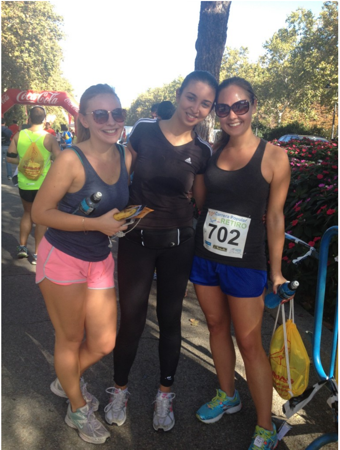
After the X Carrera Popular Distrito de Retiro, 10 kilometre – happy running!