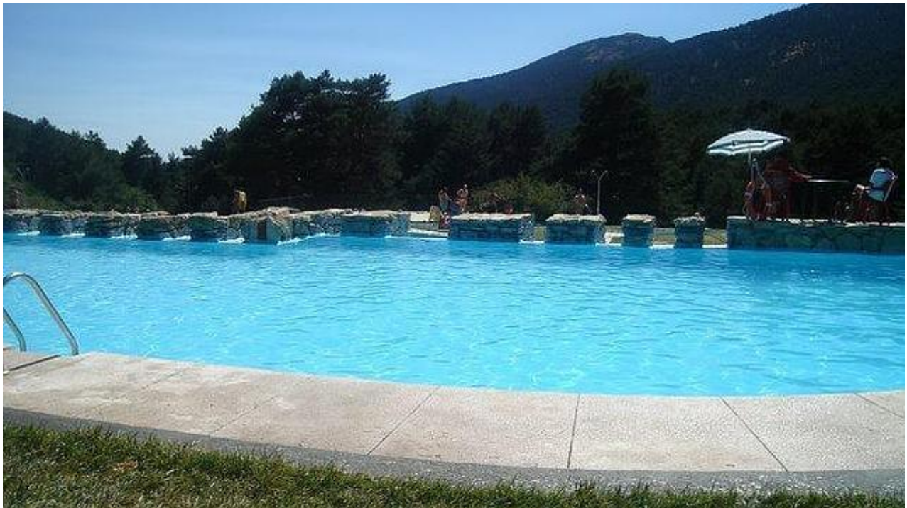
Cercedilla by ABC