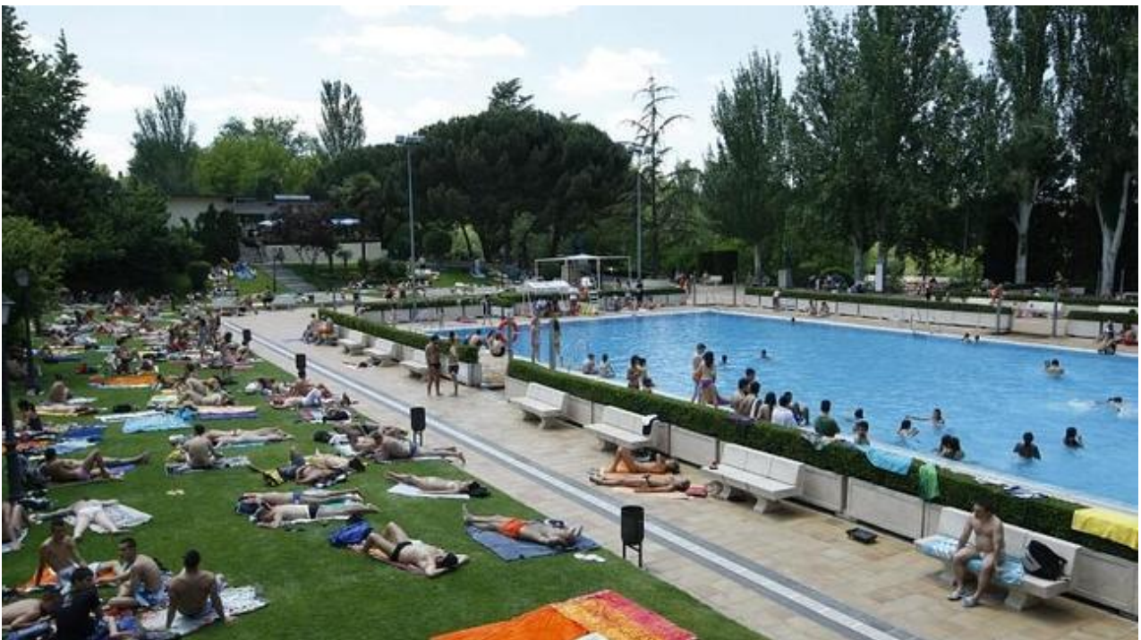
Casa de Campo by ABC

*Note: You or someone you are with must bring a student ID to get in. If you are a Complutense student you also get a discount.