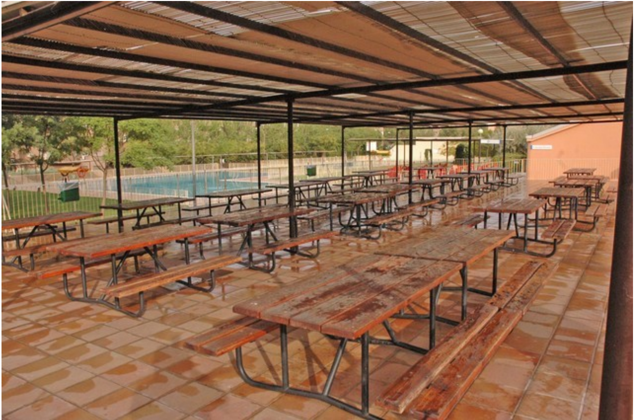
Peñuelas