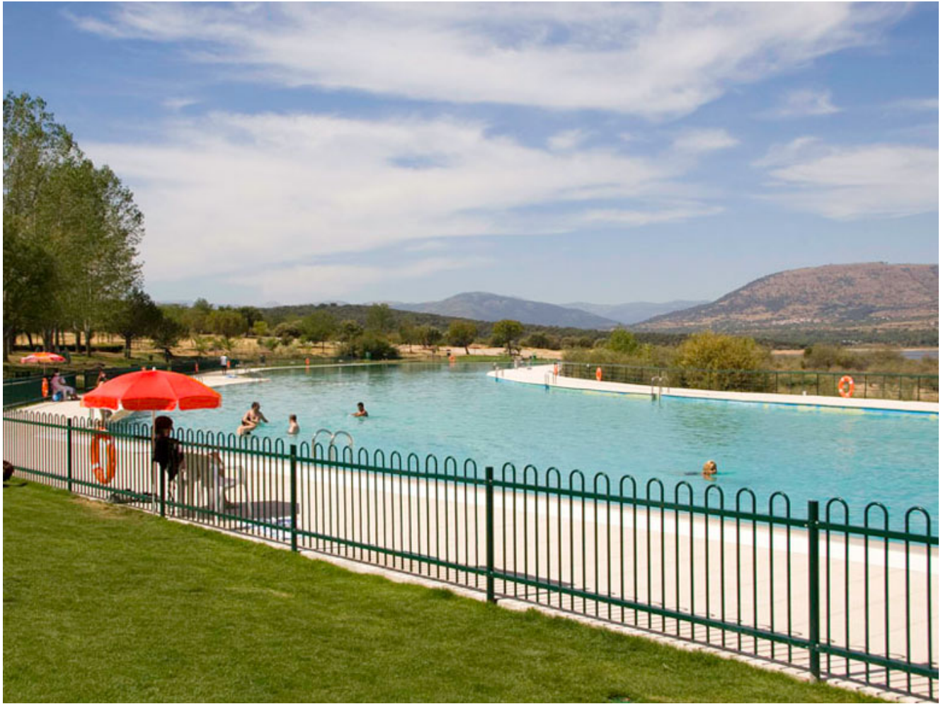
Buíttrago de Lozoya by Canalgestión