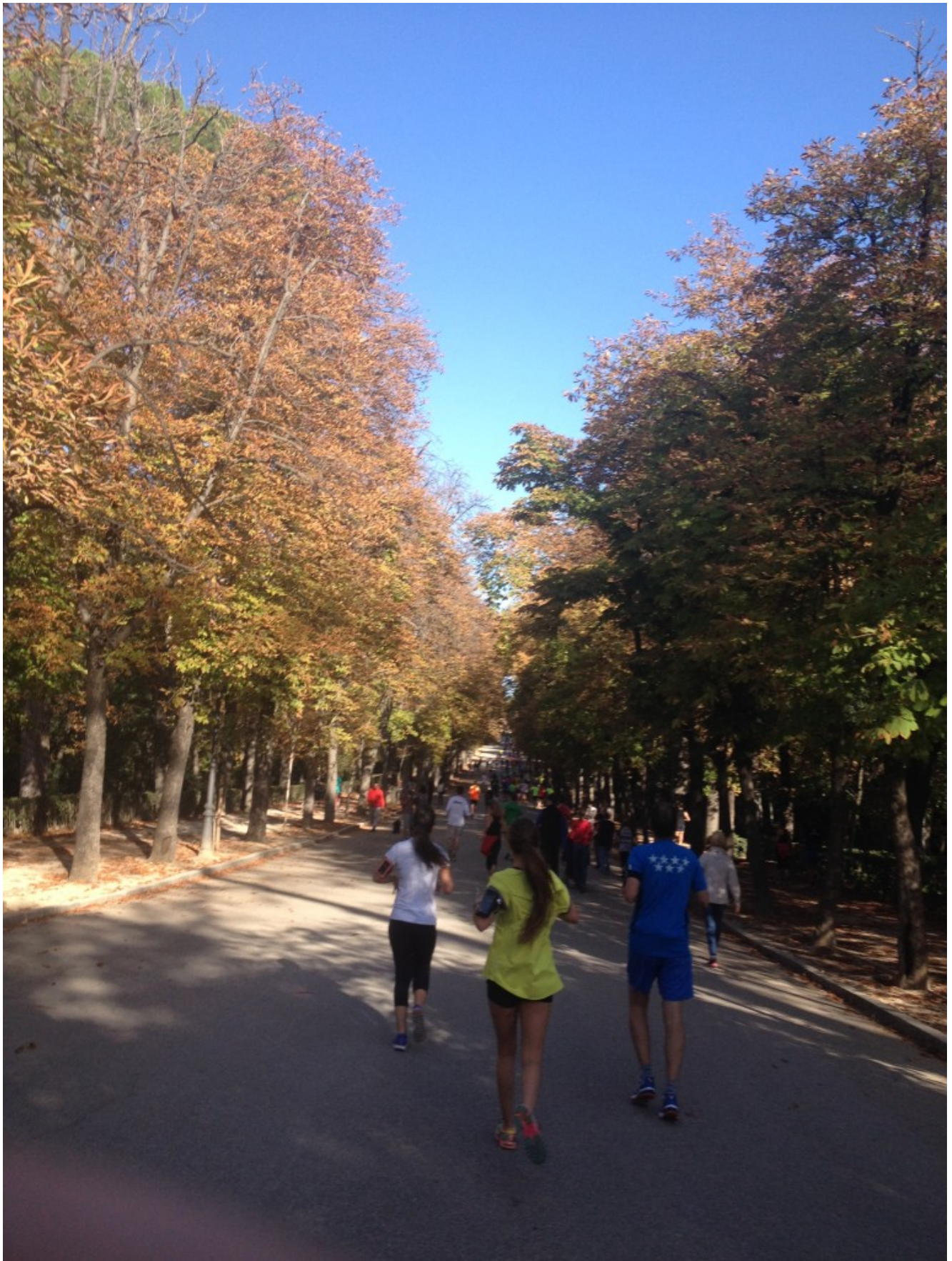
Taken at X Carrera Popular Distrito de Retiro, 26th October.