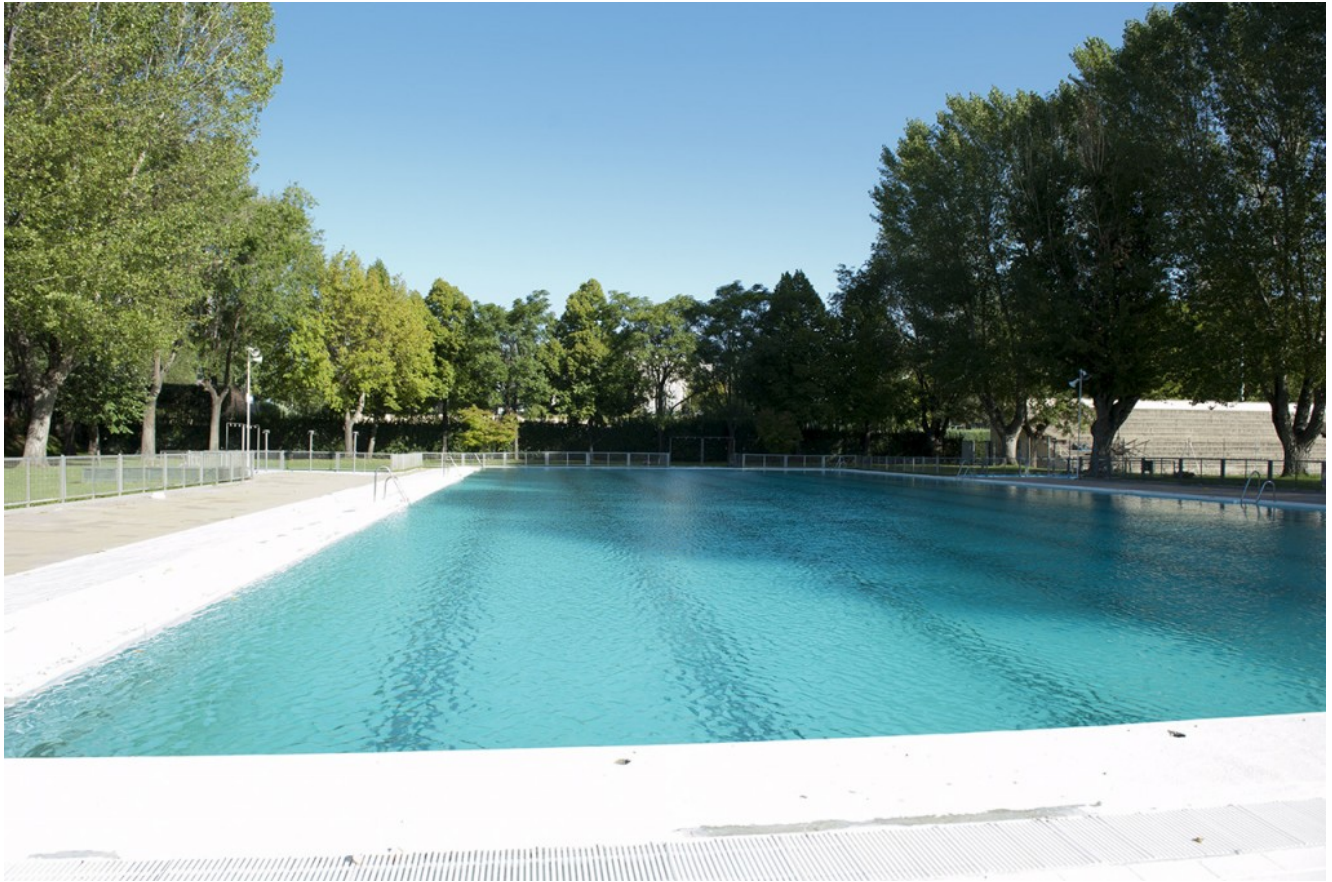
Summer pool by UCM