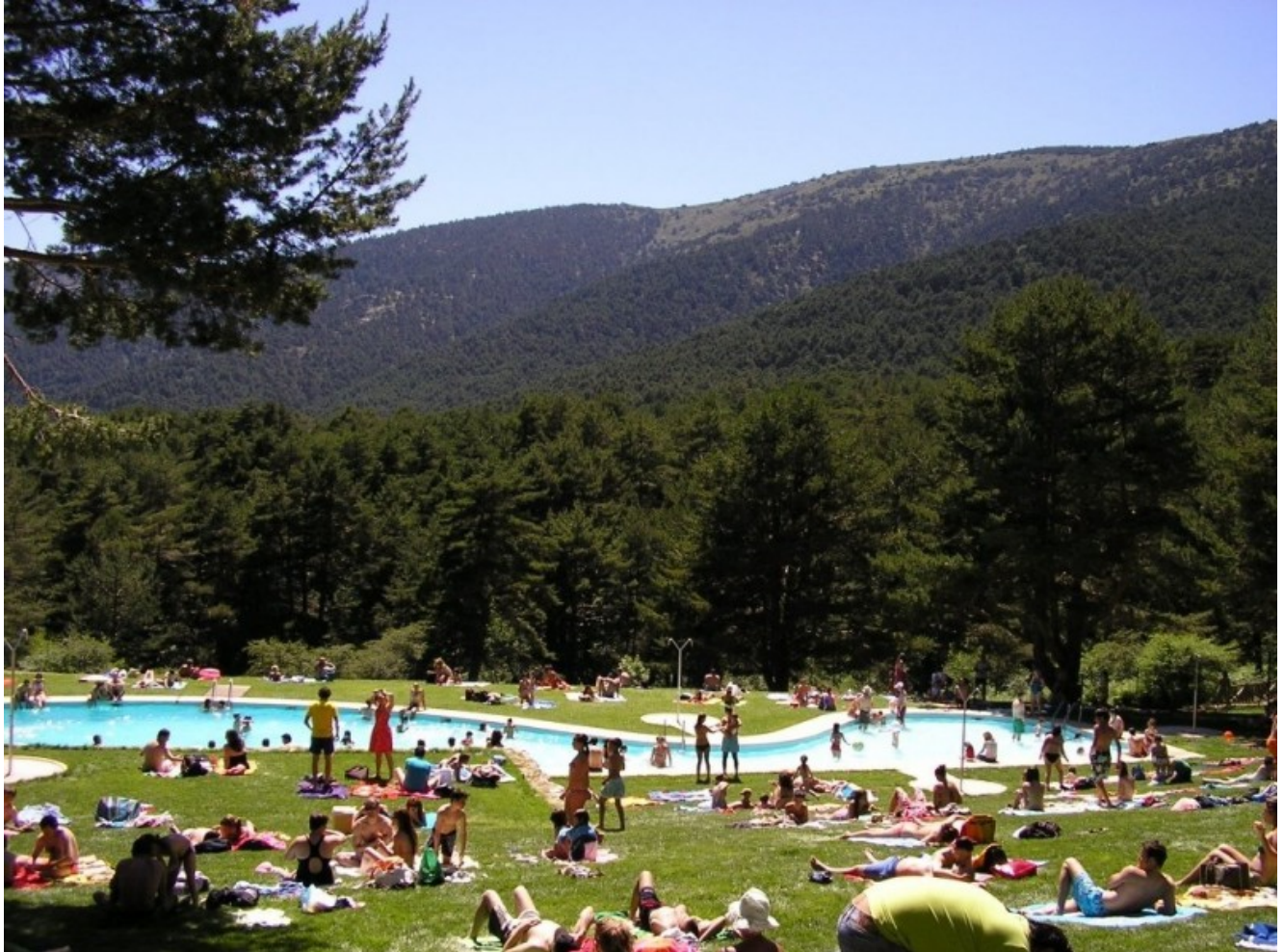
Cercedilla