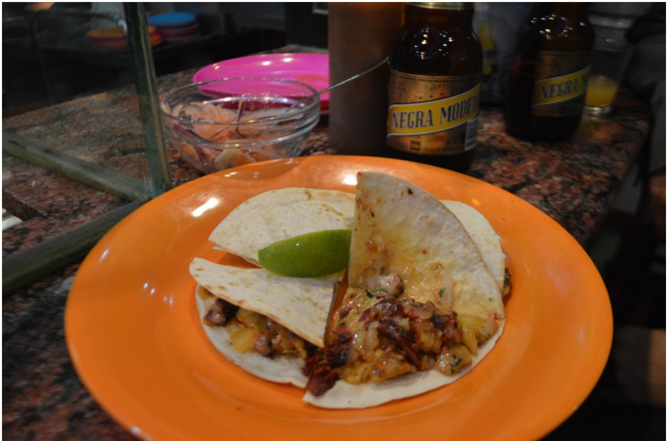
The infamous Gringa at Taquería Mi Ciudad

As the name suggests, tacos are the star of the show here: pastor, cochinita pibil, tinga, carnitas...they've got them all, as well as the usual staples like guacamole, quesadillas and frijoles. My personal favourite is the Gringa, a heavenly combination of carne al pastor, cheese and pineapple sandwiched between two flour tortillas...it needs to be eaten to be believed! If you sit at the bar you can watch the taco man work his magic, although there are plenty of tables for larger groups. Alternatively, you could hop one street over to the original restaurant on Calle Fuentes, which has standing room for about 10.