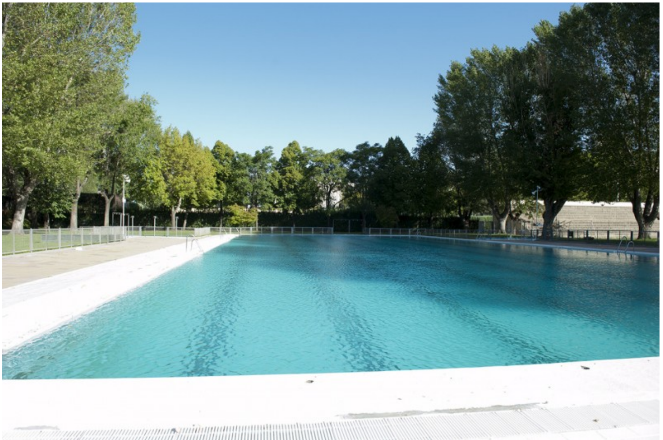
Summer pool by UCM

You also have the largest water park in Europe about 15 minutes from Madrid in Villanueva de la Cañada. Aquópolis can get very packed during the peak season so you may be better off going to one of Madrid's outdoor pools on hot summer weekends.