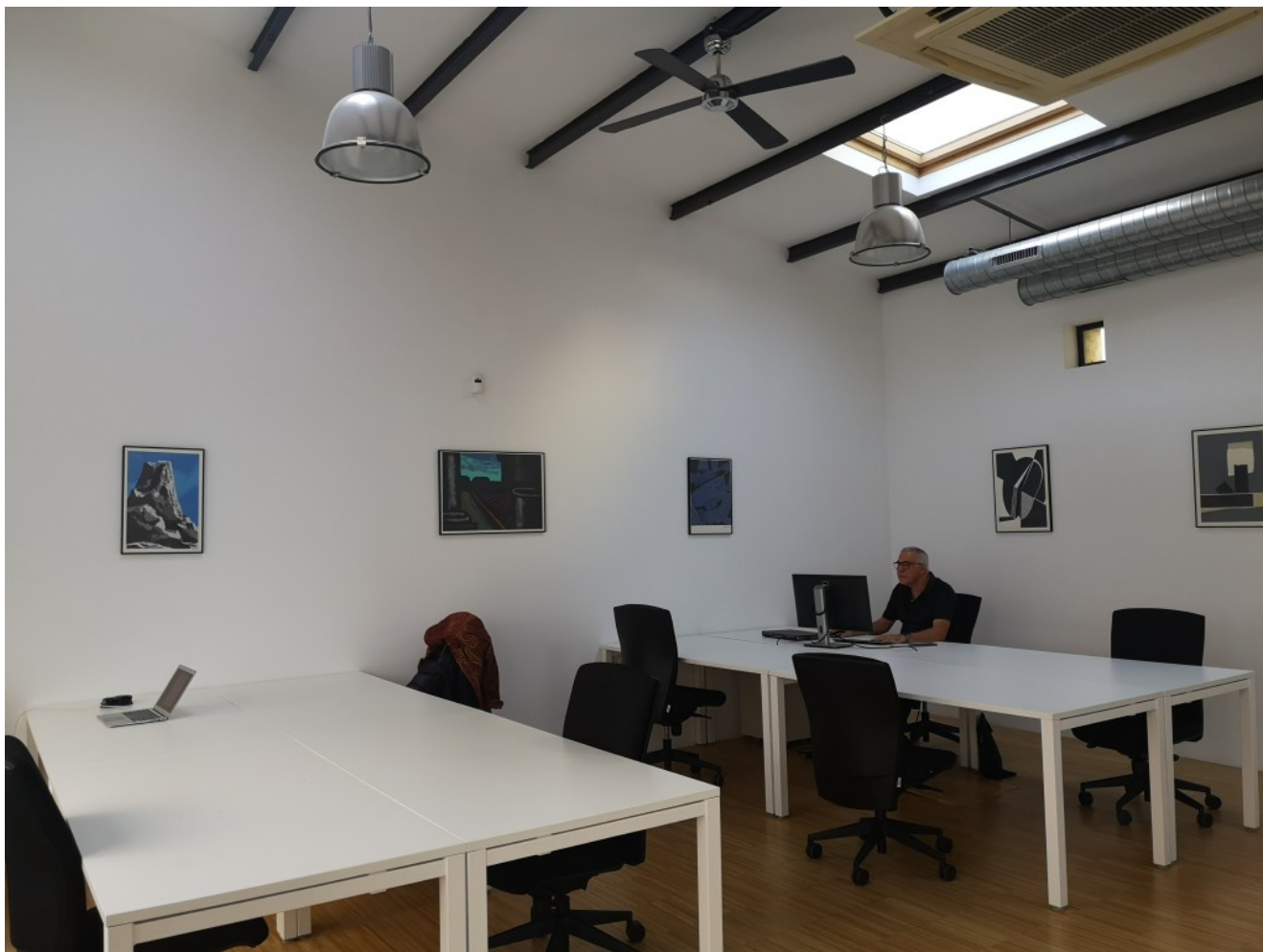
The main coworking space

Somos Coworkers checks all those boxes and more (“more” mainly refers to very cute pets; more on that later). Located in the west part of the city near Ventas, the bright space is enormous, clean, and perhaps most importantly, draws a crowd of hardworking professionals.