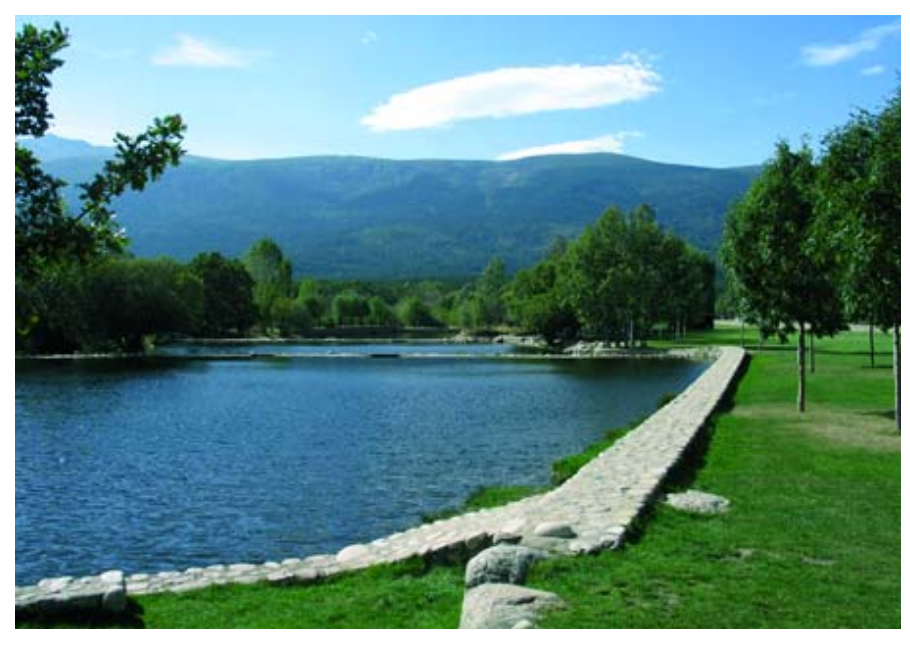
Rascafria by rascafria.eu