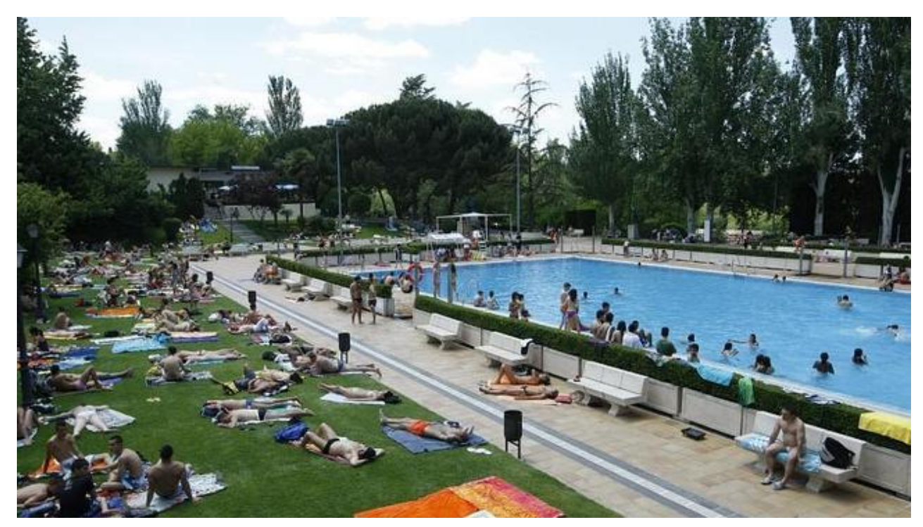
Casa de Campo by ABC

*Note: You or someone you are with must bring a student ID to get in. If you are a Complutense student you also get a discount.