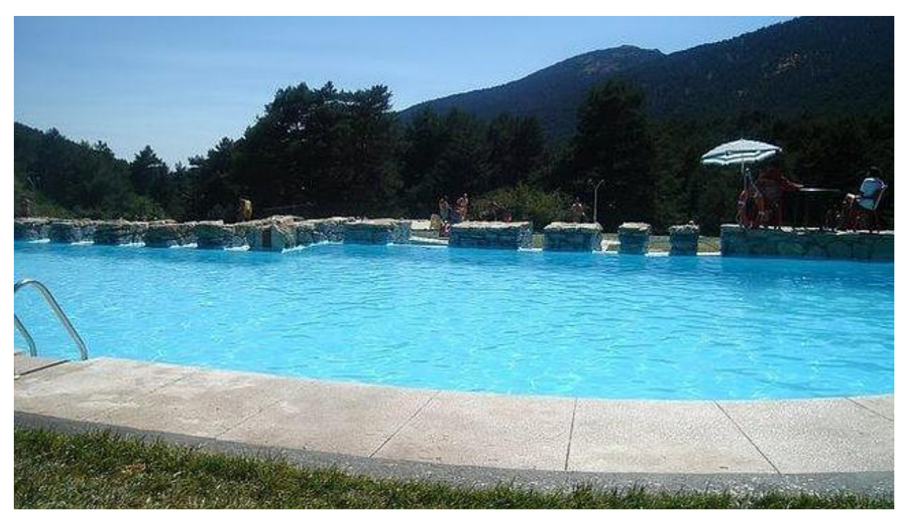
Cercedilla by ABC