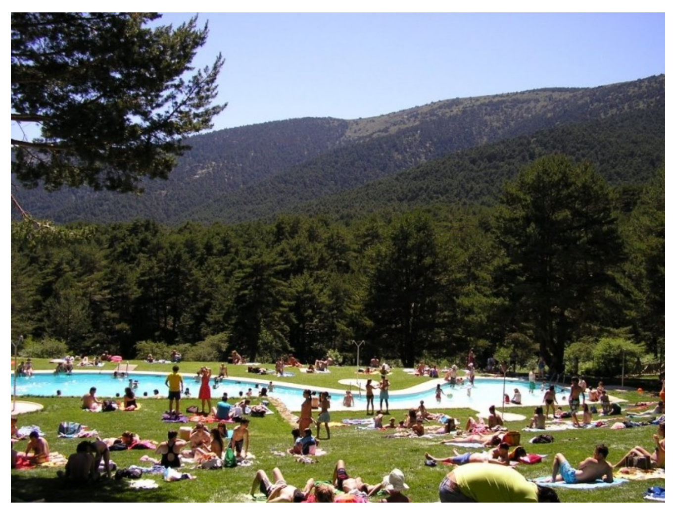
Cercedilla