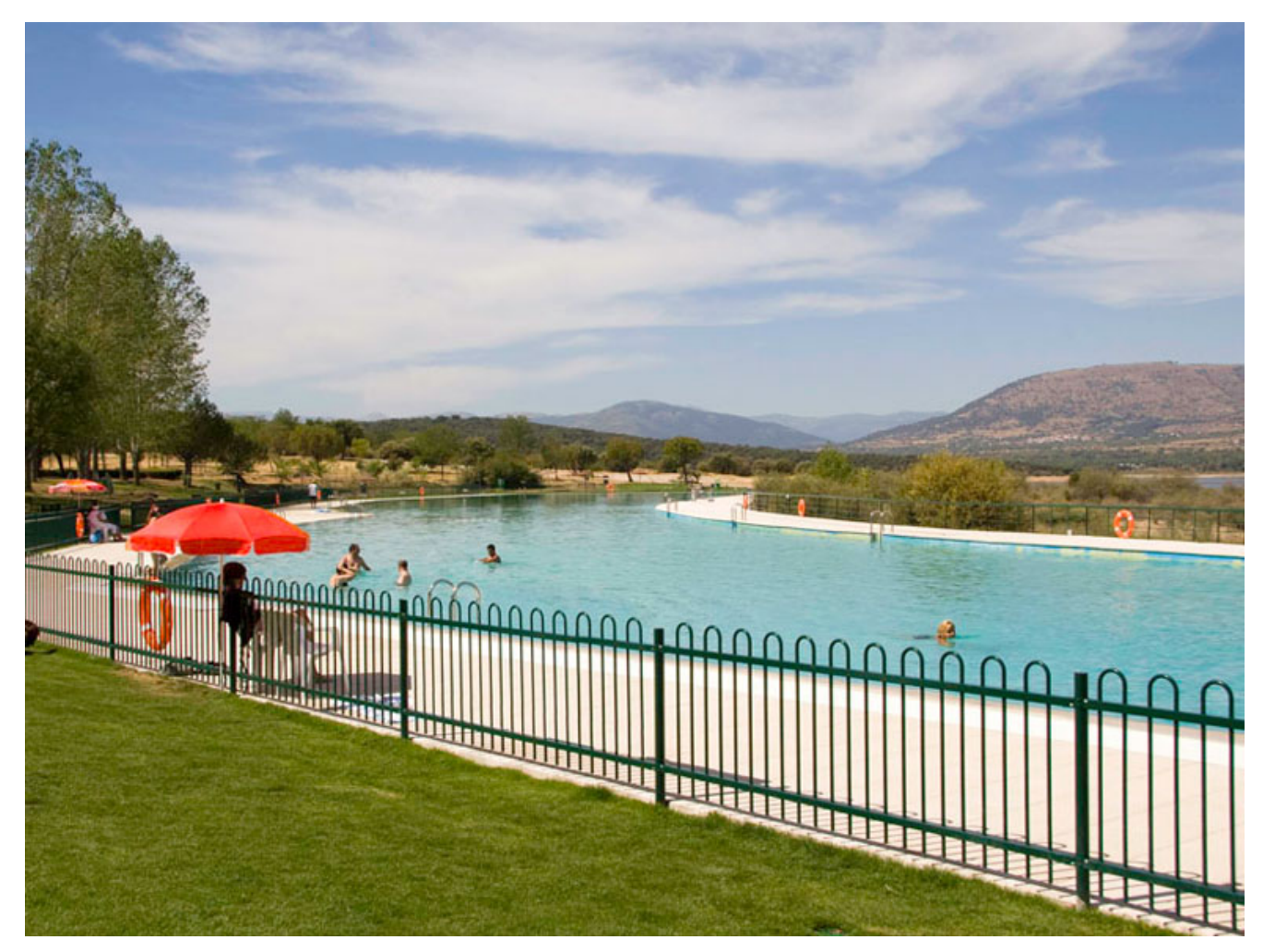
Buitrago de Lozoya by Canalgestión

My perfect day trip would be visiting Buitrago de Lozoya town in the morning, follow by spending the afternoon at the pool while enjoying the view. Buitrago's pool is a bit farther than the one in Cercedilla, and the public transportation is not as convenient. However, the town and the pool deserve a try.