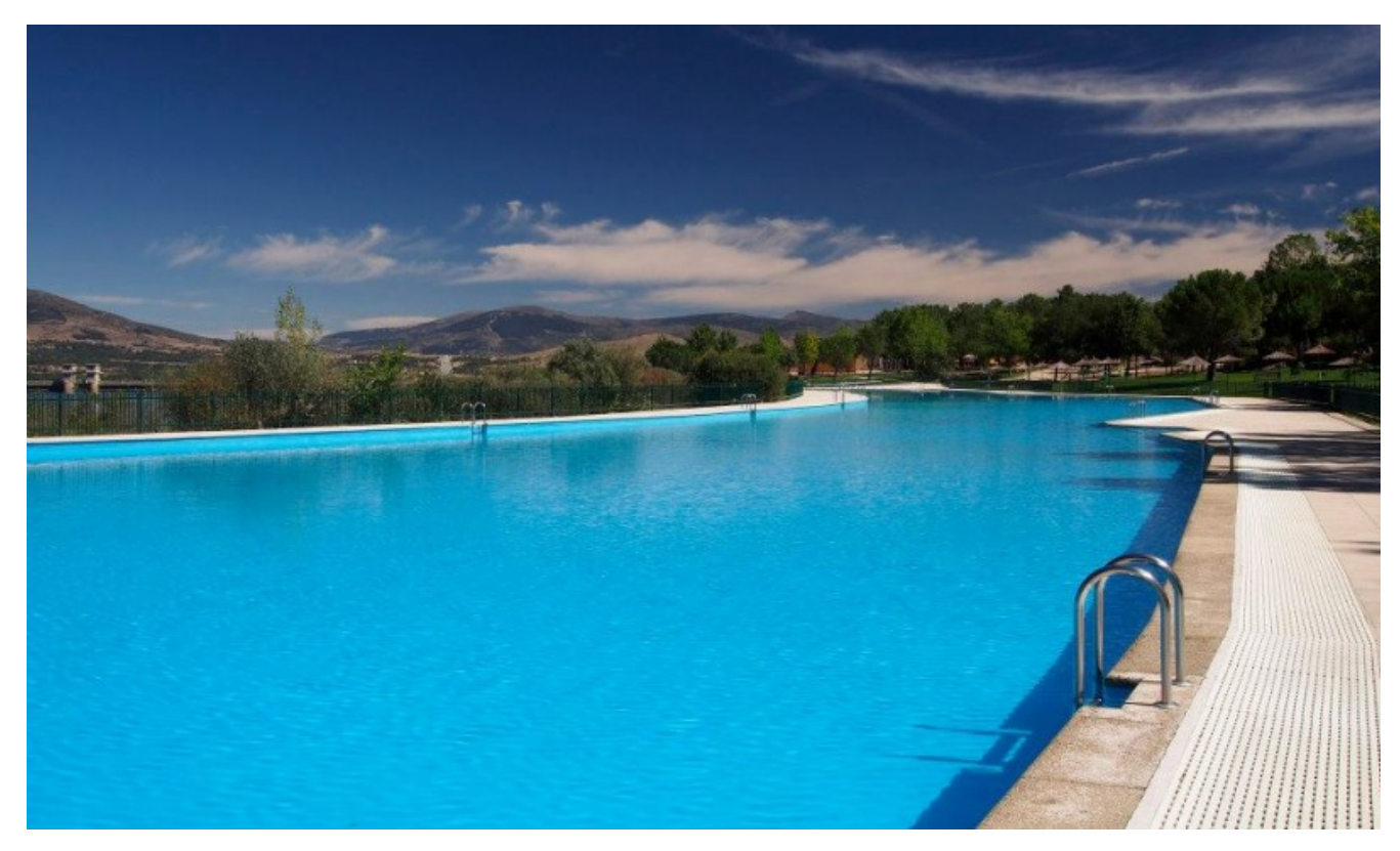
Buitrago de Lozoya by Kripsol