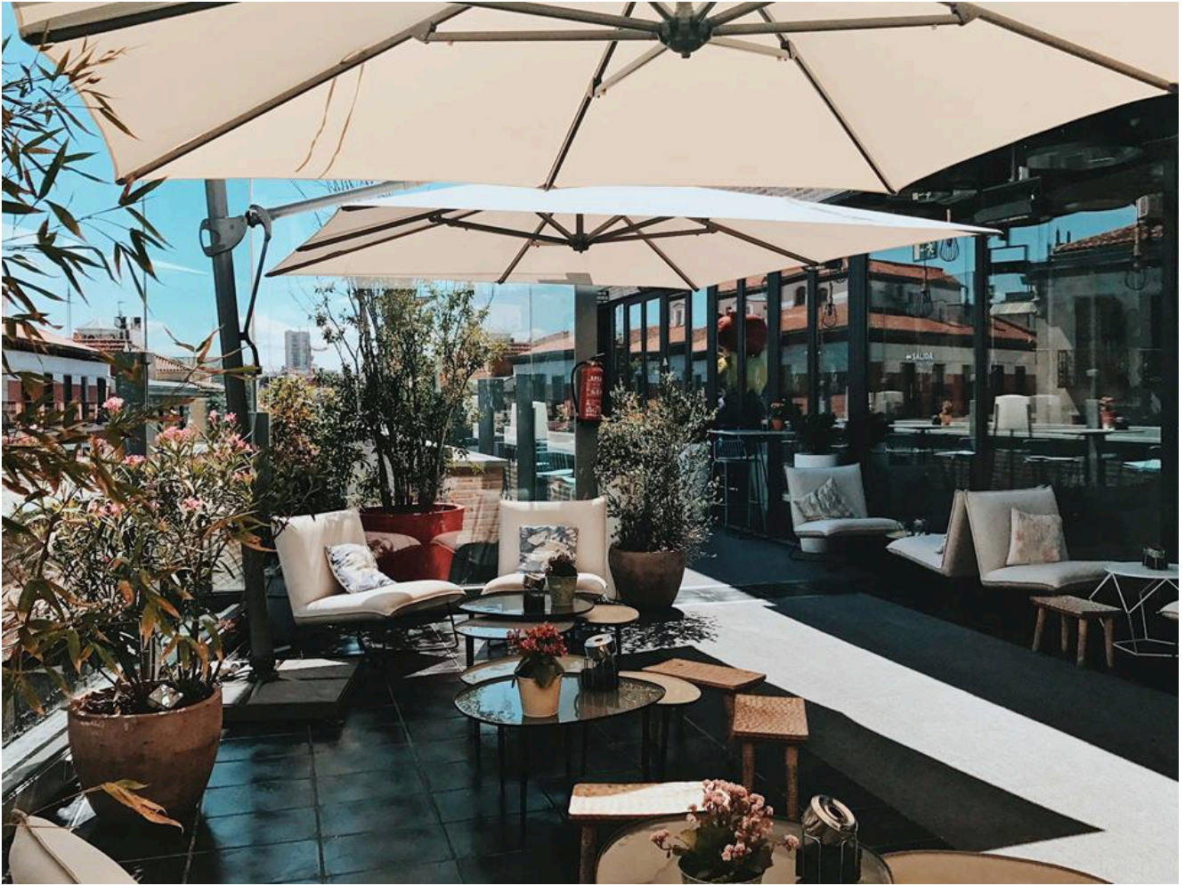
Photo from Mercado de San Antón

This is a perfect place to start your evening with friends. As you enter Chueca's beloved food market, Mercado de San Antón, first you'll walk through various food stalls and tapas stands. Then make your way up to the fourth floor for a drink any time of day, any time of year.