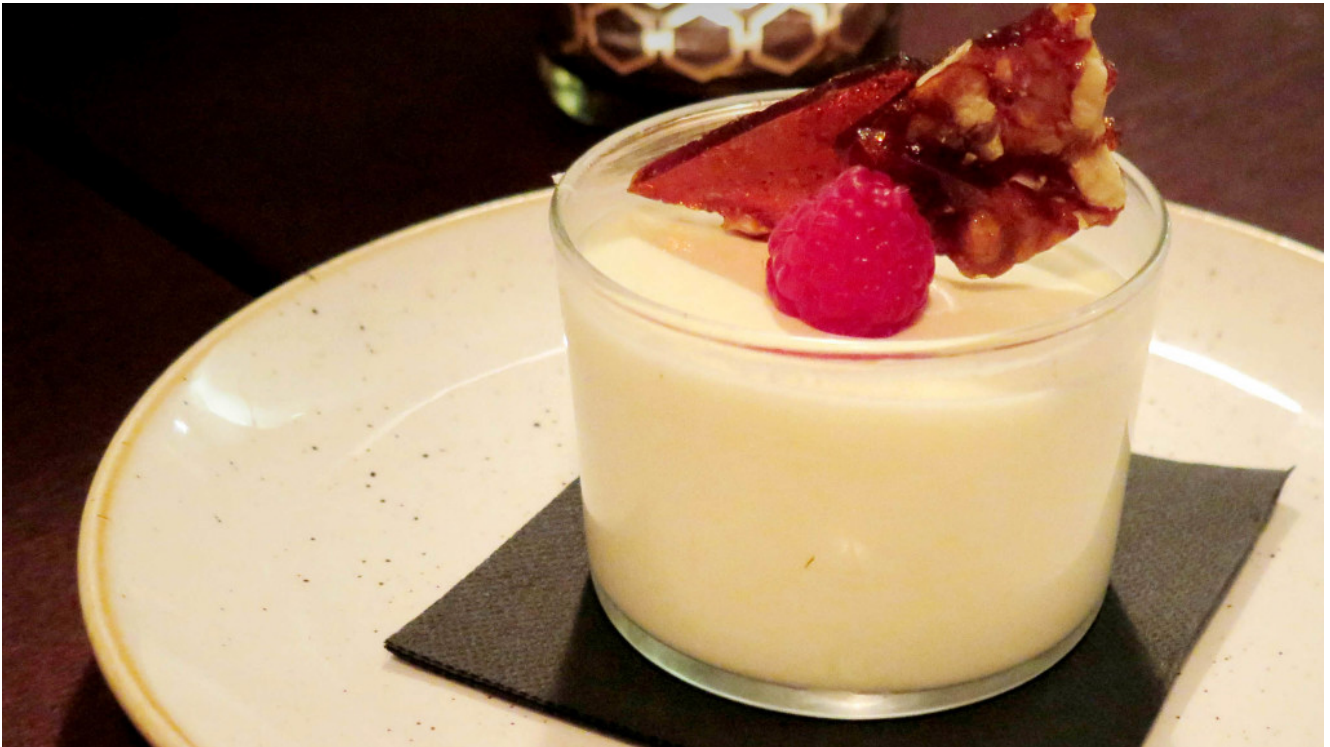
The Amaretto Connection

Despite being pretty full, we ordered the Margherita Cheesecake and the Amaretto Connection for all of us to share, because when a dessert is good enough (and you know what I'm talking about here), you'll find room for it.