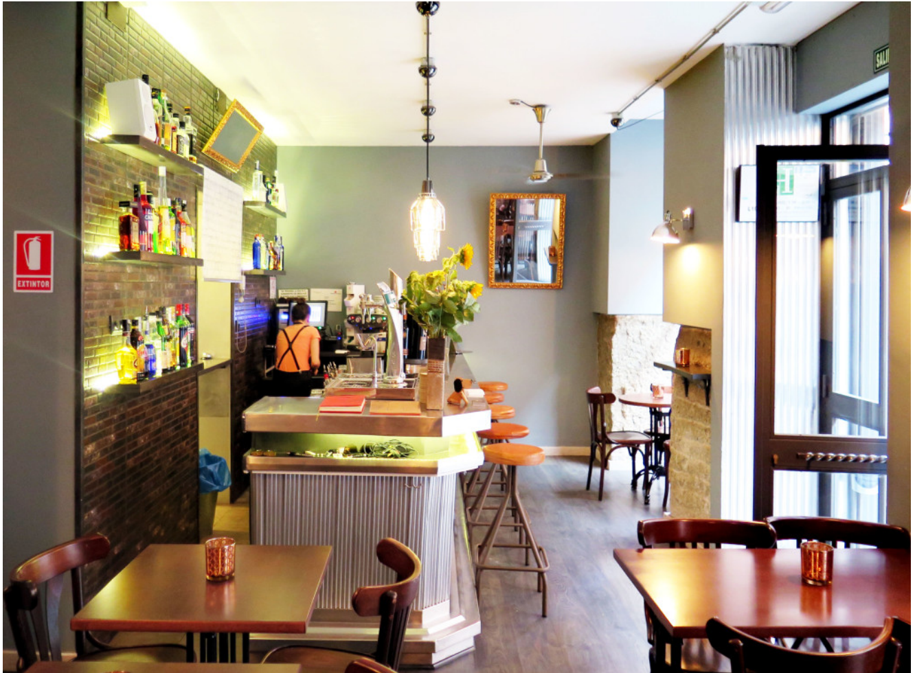
The bar area

years, he travelled around the world opening and running game-changing restaurants before finally settling in Madrid and opening Jack Percoca Bar & Kitchen, a cosy little Italian restaurant in the heart of the city's Conde Duque district.