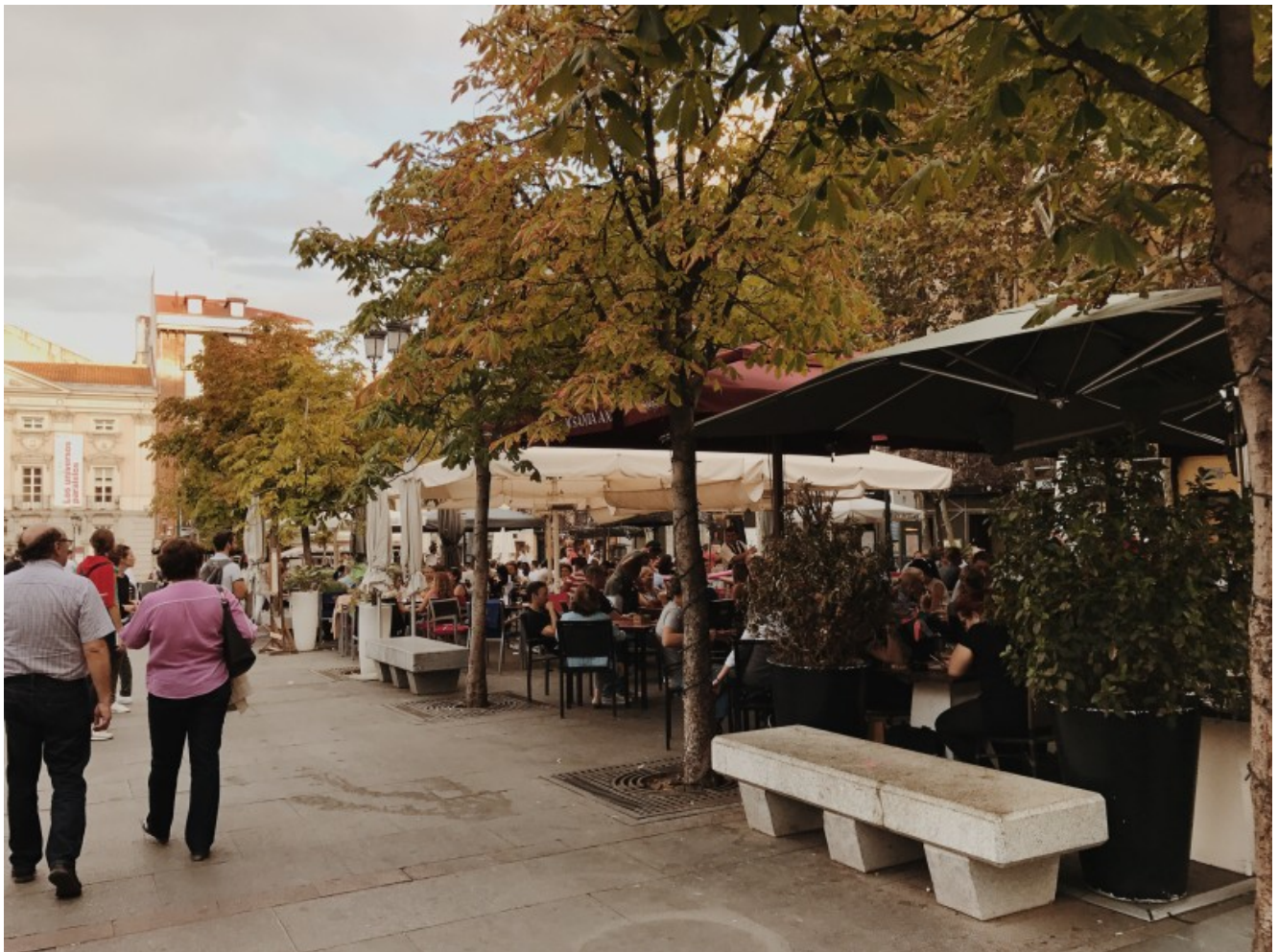
Plaza Santa Ana

When I first moved to Madrid I walked that well trodden path like so many ex-pats had done before me; the month long TEFL course. I rocked up with my Spanish phrase book, some SPF 20 and the overwhelming desire to live abroad. With no set plan (well, with no actual plan at all having quit my job in PR back in London) I quickly got into the groove of my new TEFL timetable; which essentially meant a 3pm finish. As soon as my 'working' day was done, I would wile away afternoons in Plaza Santa Ana.