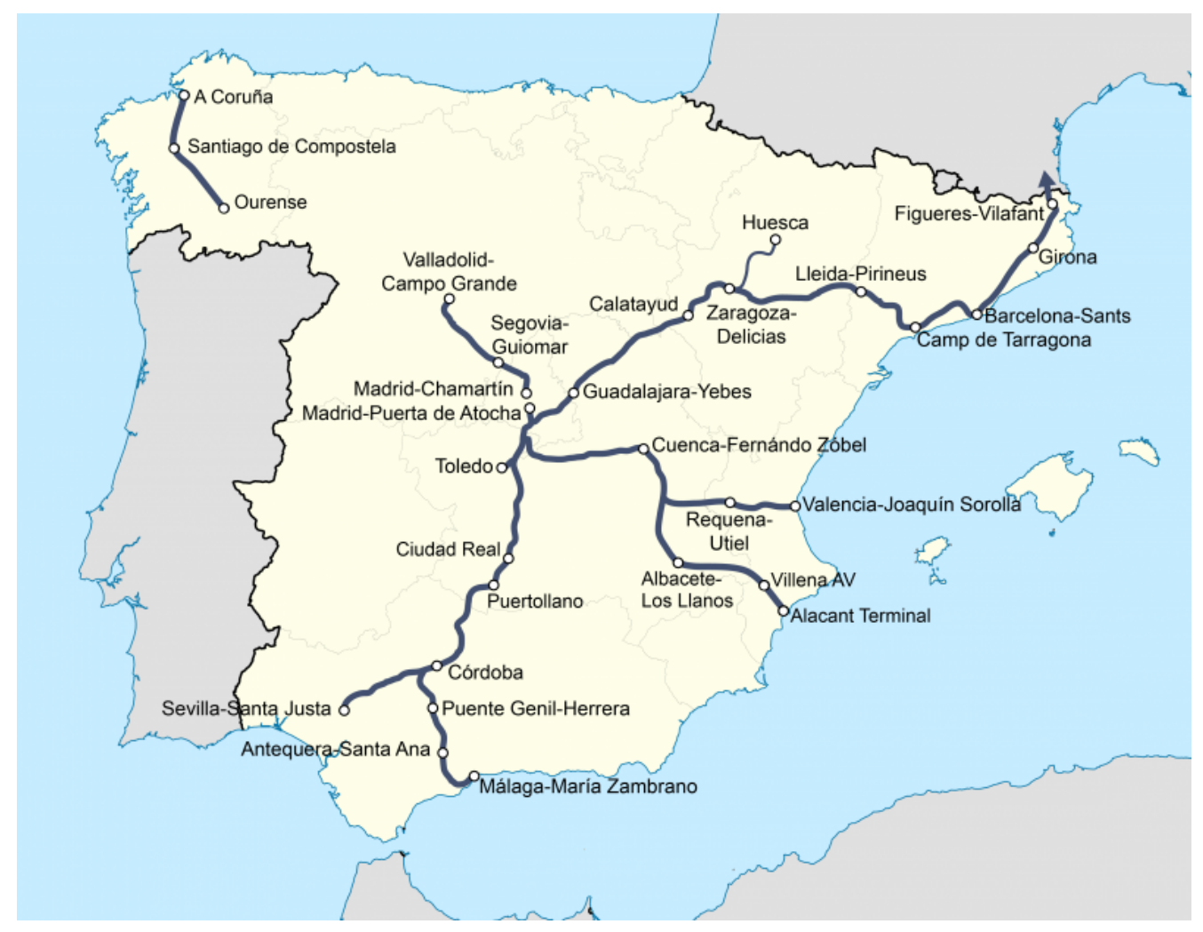
Red española alta velocidad by Wikipedia