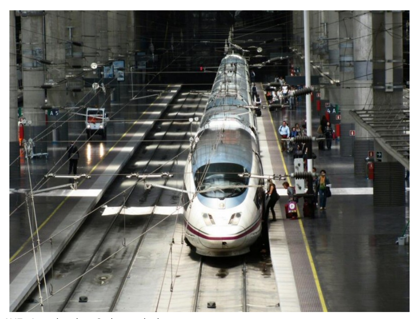
AVE Atocha

AVE is the Spanish high-speed-train system. These trains get you to some of the biggest cities in Spain in just few hours or less. Although prices aren't cheap, there are some ways to get them cheaper: the most advisable is to take 4 seats (a table). That way you'll save 40-50%. Also, it's good to remember that train stations are in the city center, so you won't spend money and time getting to and from the airport.