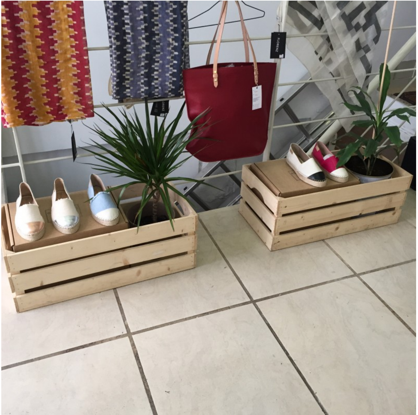
Some of the selection of Mintandrose at Etbang