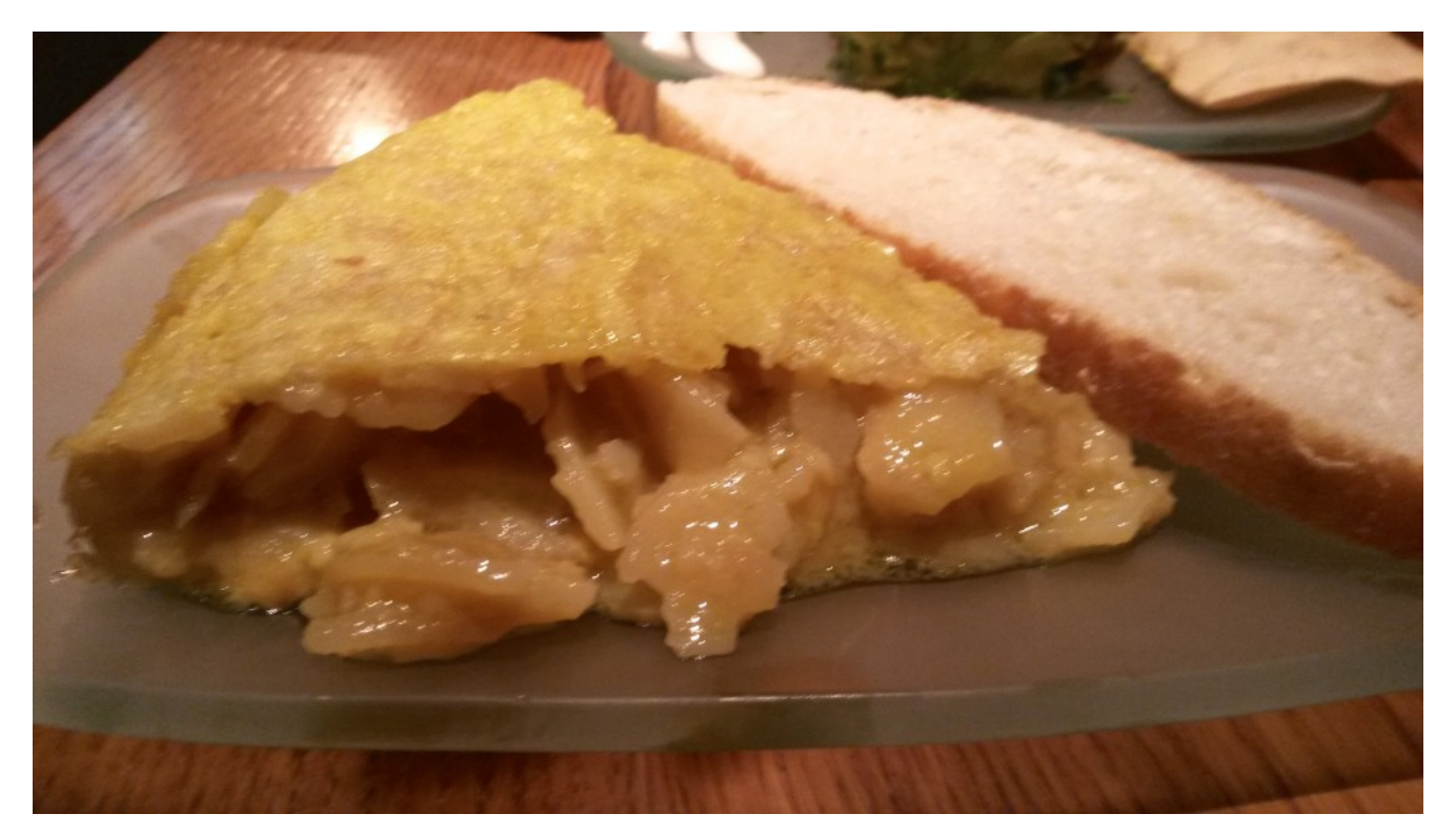
the tortilla de patata, a surprisingly delicious Spanish staple: potato and egg omelette

And when it comes to dessert, I recommend the tiramisu , the torrijas (a very traditional Spanish version of bread pudding; a slice of bread soaked in milk and honey, then fried and topped with whipped cream and ice cream) and you should also try the apple crumble . Again, this was a surprise. Never would I have thought that apple crumble could be so good (I've had it many times and it's usually just not my cup of tea. Here, though, it truly was).