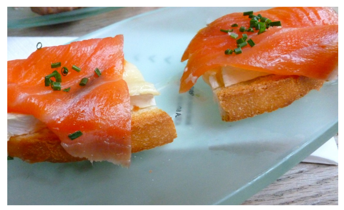
tosta de salmon con brie