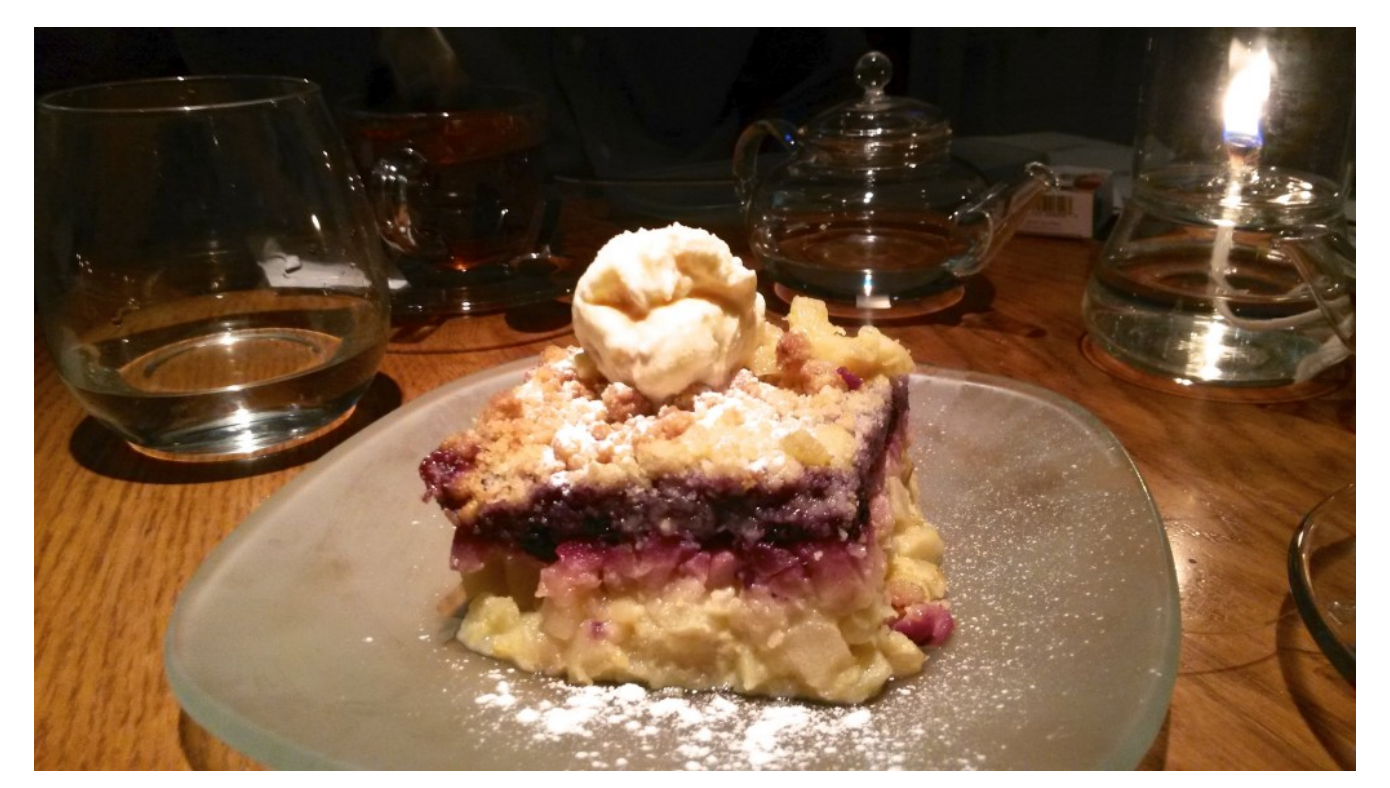
Apple and cranberry crumble topped with vanilla ice cream, to die for

To drink, I usually order tinto de verano (a great spin on sangría) which is a cold mix of red wine and a sweet Spanish seltzer called casera . During the winter, I almost always share a bottle of wine with friends. Last time the waiter recommended the Finca Vieja Reserva from La Mancha for 12E, which was very much worth it.