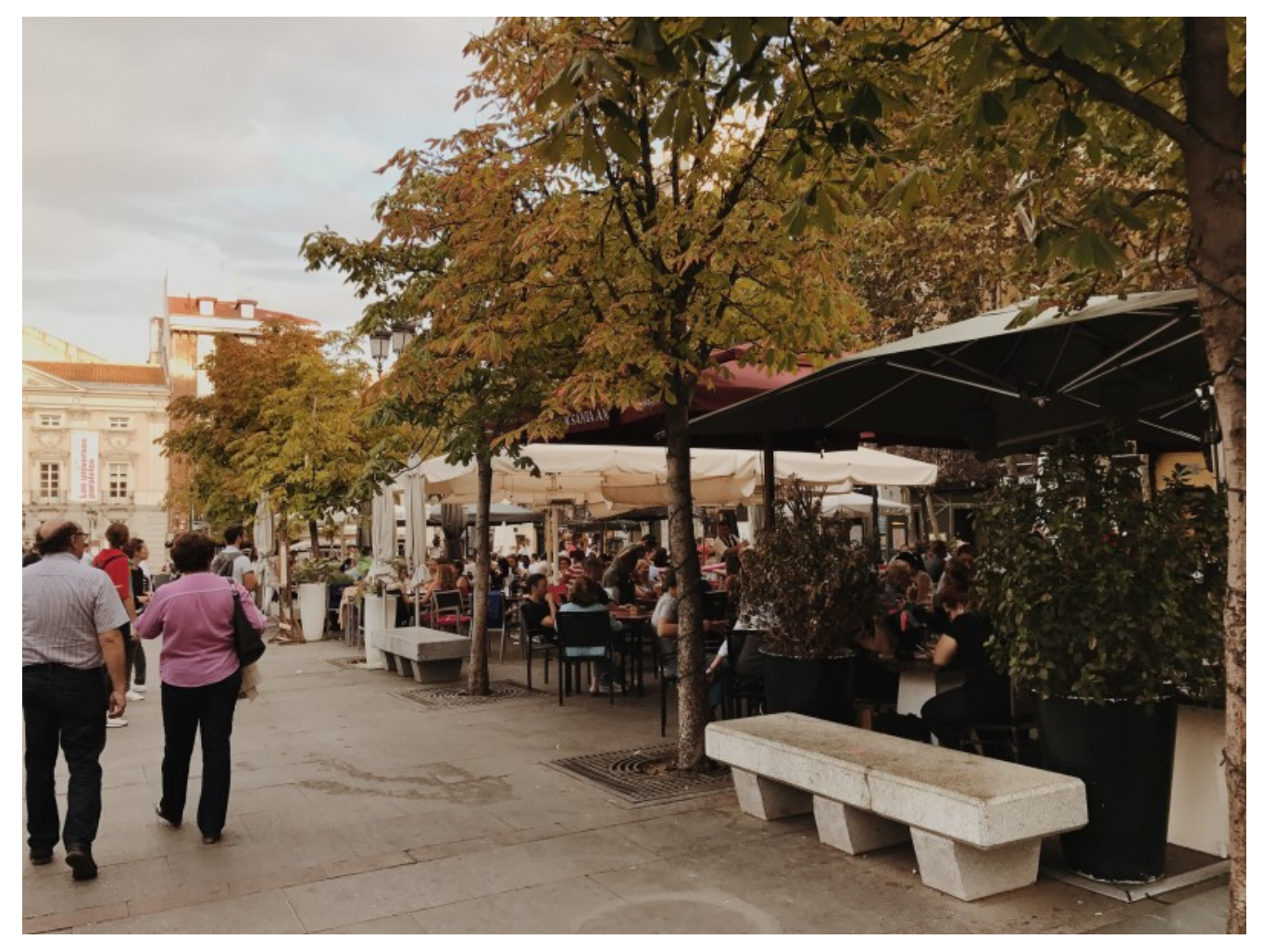
Plaza Santa Ana

When I first moved to Madrid I walked that well trodden path like so many ex-pats had done before me; the month long TEFL course. I rocked up with my Spanish phrase book, some SPF 20 and the overwhelming desire to live abroad. With no set plan (well, with no actual plan at all having quit my job in PR back in London) I quickly got into the groove of my new TEFL timetable; which essentially meant a 3pm finish. As soon as my 'working' day was done, I would wile away afternoons in Plaza Santa Ana.