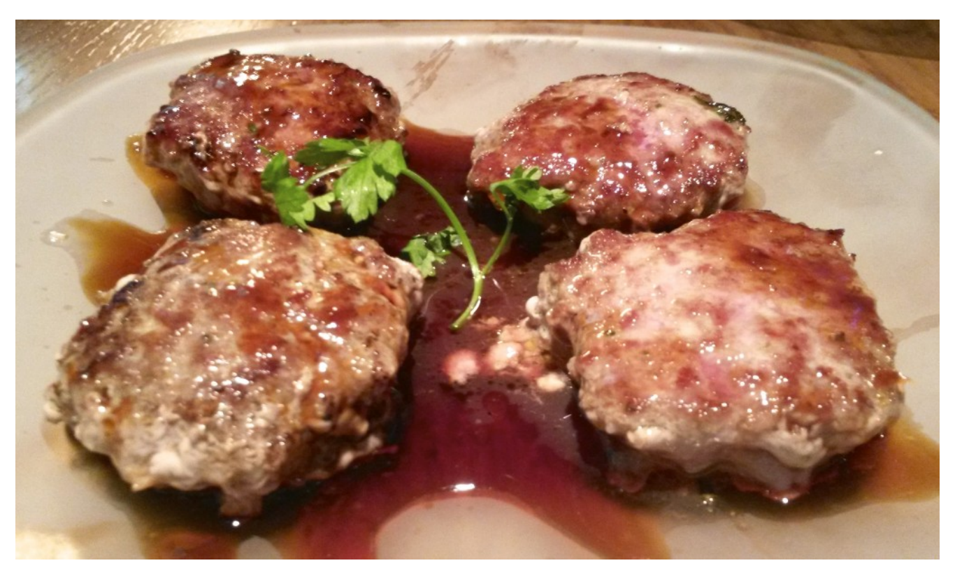
mini hamburguesas con reducción de Pedro Ximenez (sherry reduction)

Although the Spanish passion for croquettes is not always understood by foreigners, las croquetas de jamón are a must here too, as are the albóndigas (meatballs). Since I always order them both, last week I decided to venture out a bit and went for the mini-hamburgers instead, and wow, that was a good choice. They're served with a reduced Pedro Ximenez (sherry) sauce which you can sop up with bread.