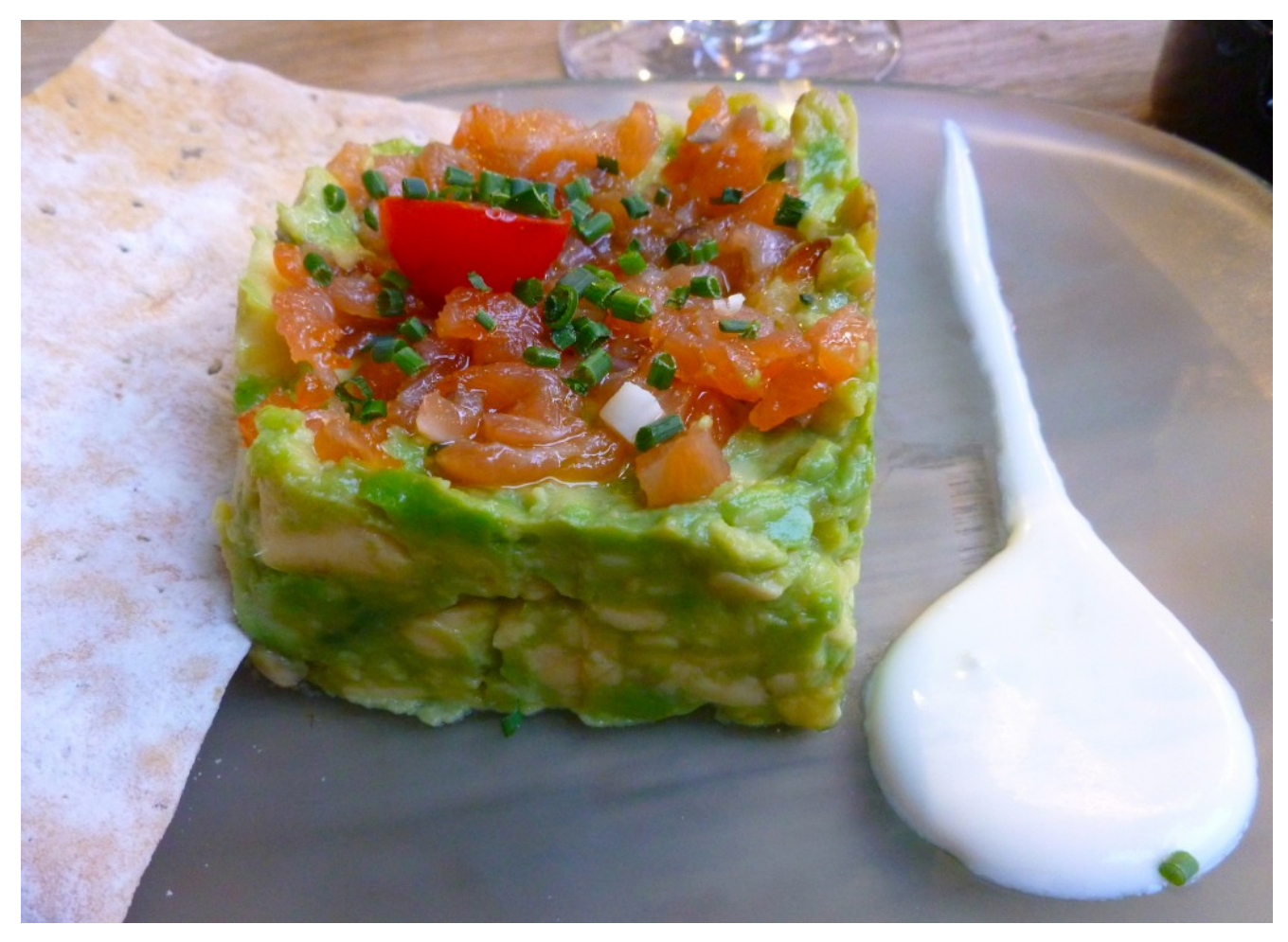
tartar de aguacate con salmon