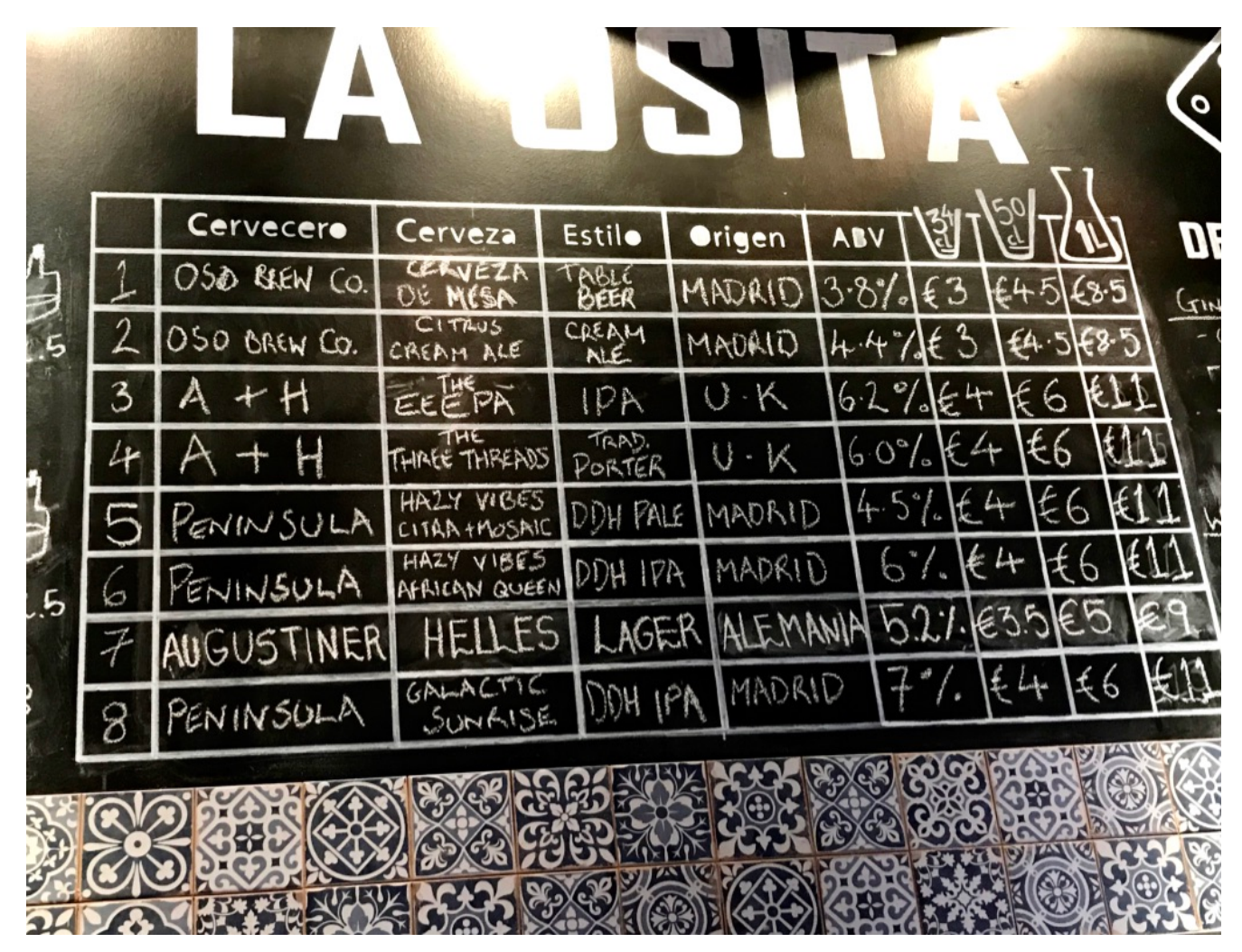
Here's what was listed on the chalkboard the day we went!

When you walk in you'll see their daily beer selection listed on the chalkboard. The first two options are their homemade brews — citrus cream ale and cerveza de mesa (table beer) — which they make at a local brewery in Alcobendas, Cervecera Península.