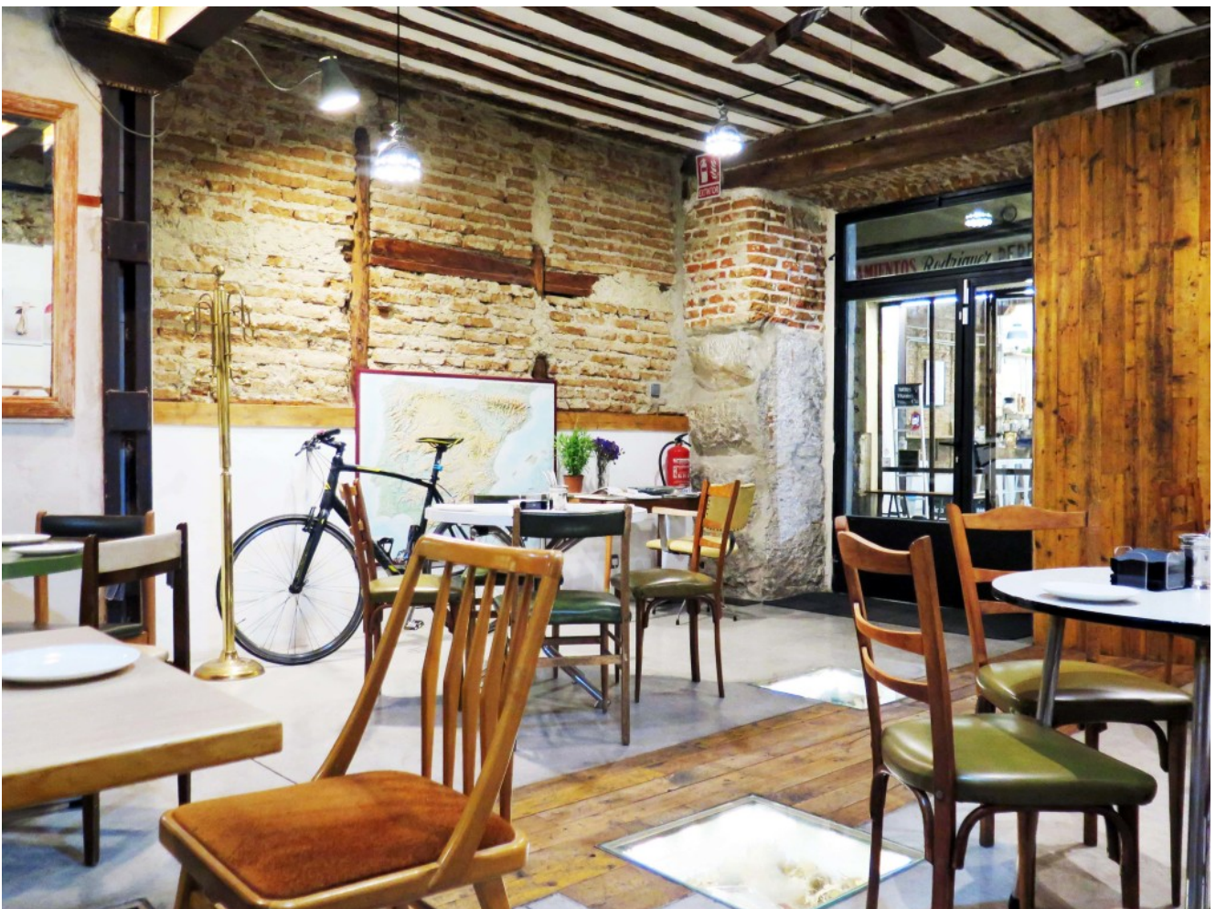
El Brote's dining area

Mushrooms: they're an inspiring subject one can easily get carried away with, especially after paying a visit to El Brote. Years of academic mushroom knowledge and on-the-ground wisdom were literally delivered to us on a plate and I'm now a devout mushroom apostle on a mission to spread the message to the foodie people of Madrid.