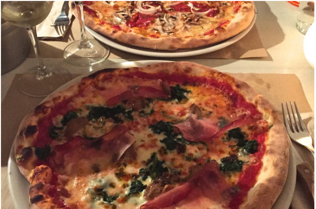
Casa dei Pazzi