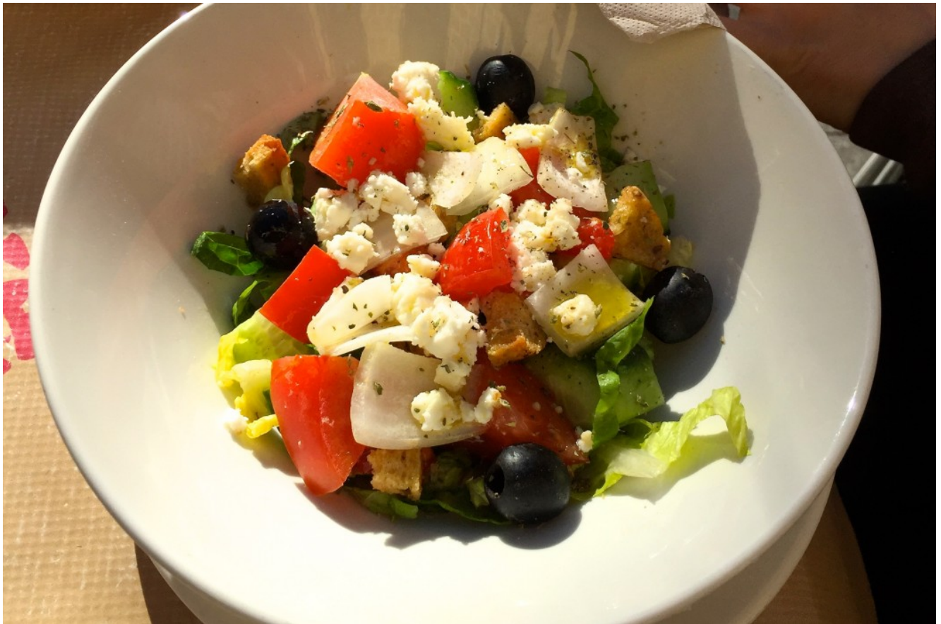
Greek salad starter at La Mucca, Malasaña