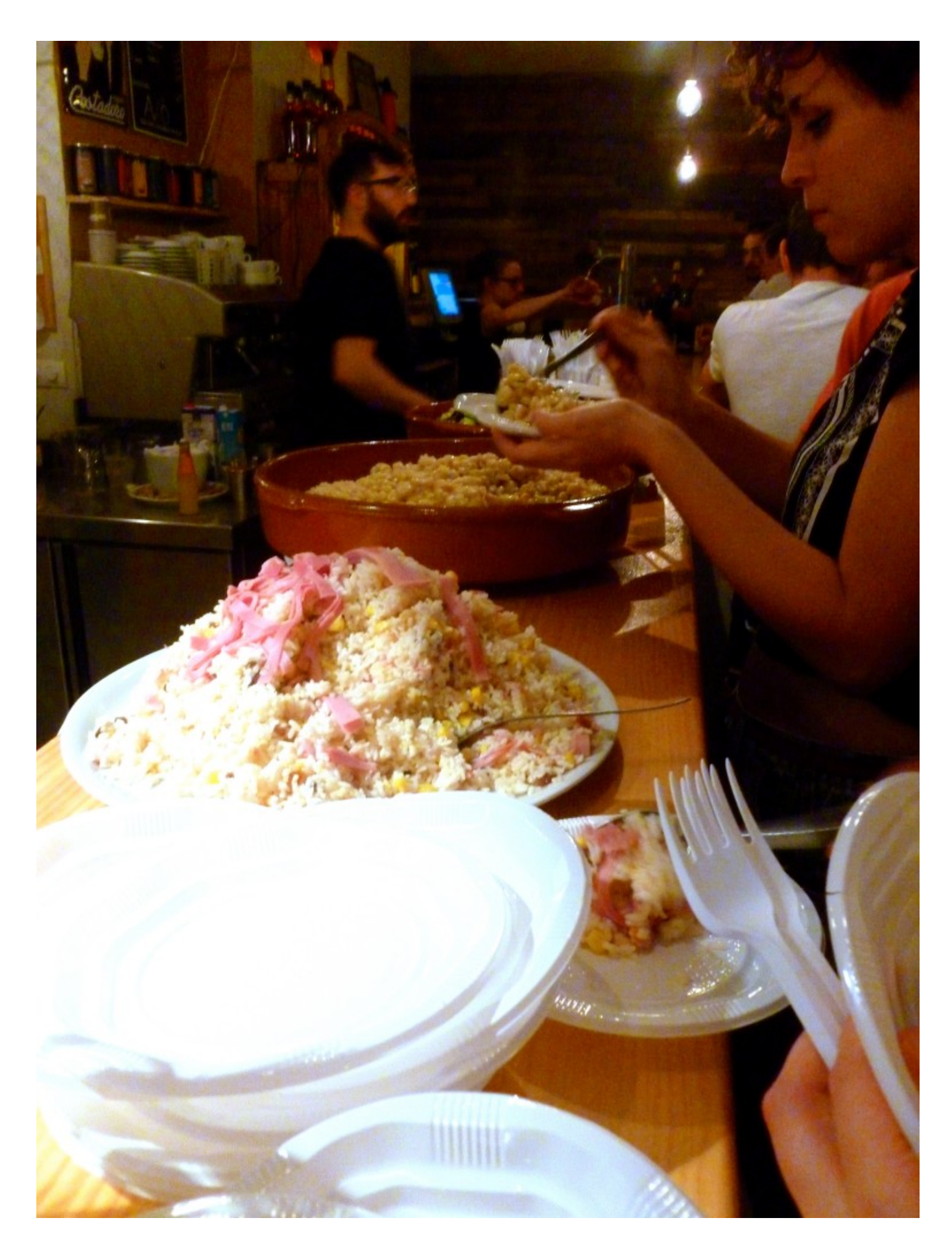
The salad was far from your average ensalada mixta , as it came with all types of greens, onions, green bell peppers,