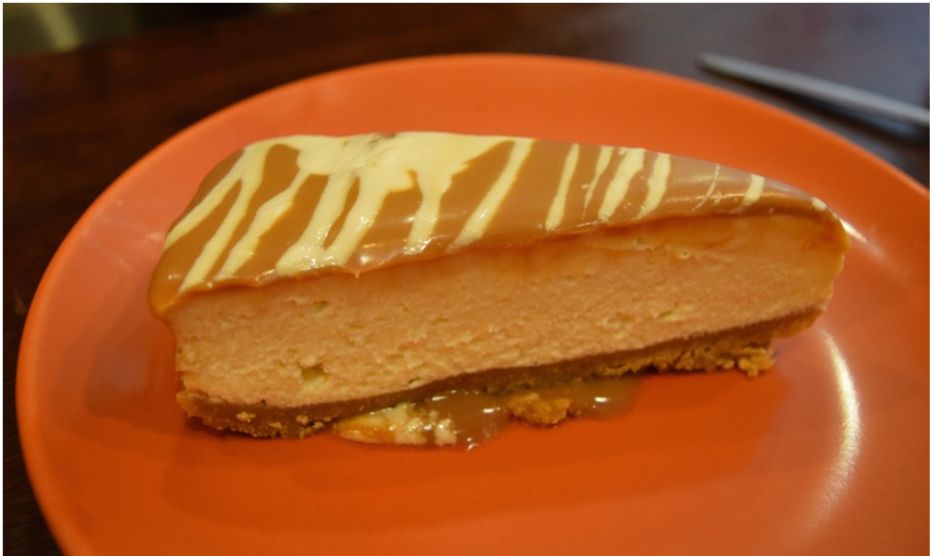
White chocolate caramel cheesecake

To wash it all down, you can choose from a variety of espresso drinks made with Dominican Café Santo Domingo (“Even the coffee is amazing,” according to Sophia), including bulletproof coffee and affogato . Or give into temptation and go for Zakiya’s signature Nutella hot chocolate, or the Dominican specialty morir soñando (orange or passion fruit juice mixed with evaporated milk). If you want something a bit lighter, there are also several kinds of natural juices.