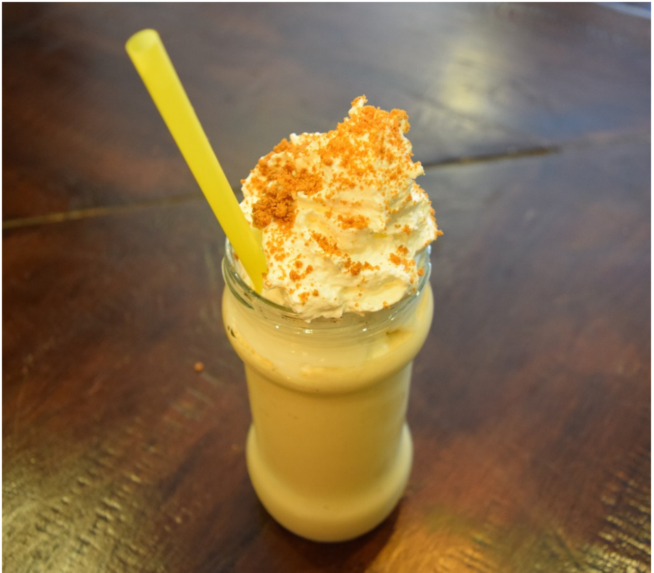
Galleta Biscoff batido : “Like drinking a cookie”

Still hungry? Try one of the sweet empanadas, dreamed up as a way to combine Aderly's talents with Zakiya's passion for baking. The same perfectly fried dough, stuffed with apple pie, dulce de leche , nutella cheesecake, Oreo, white chocolate, strawberries, or pineapple... it's clearly a match made in heaven.