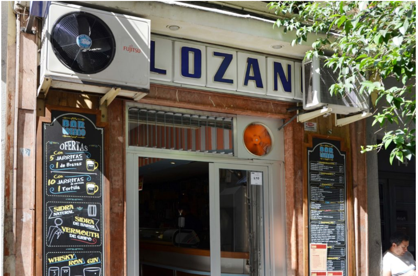
Bar Lozano: one of Malasaña's last no-frills bars (closed 2018)