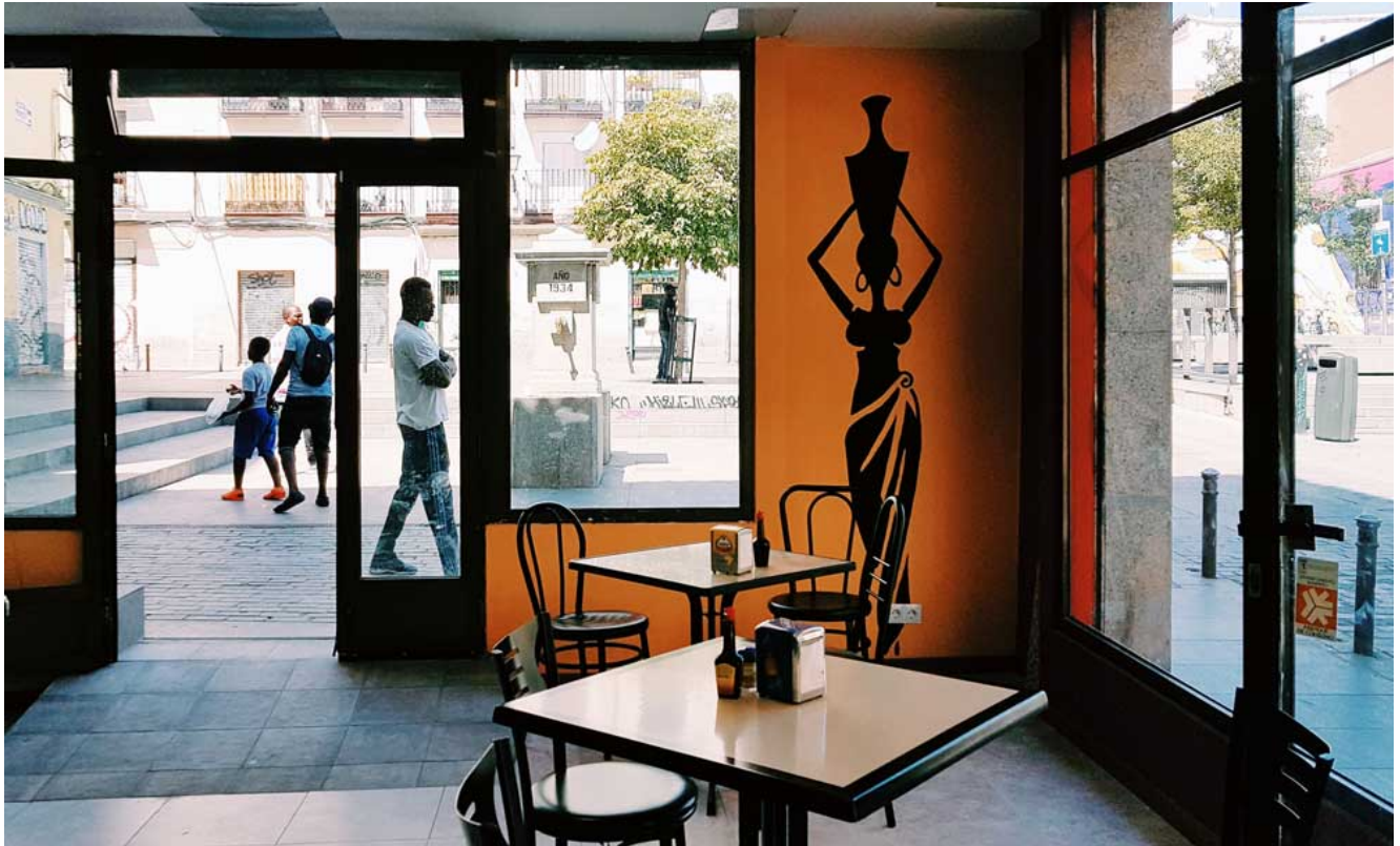
Mandela 100: Emblematic Senegalese diner opens on Plaza Nelson Mandela