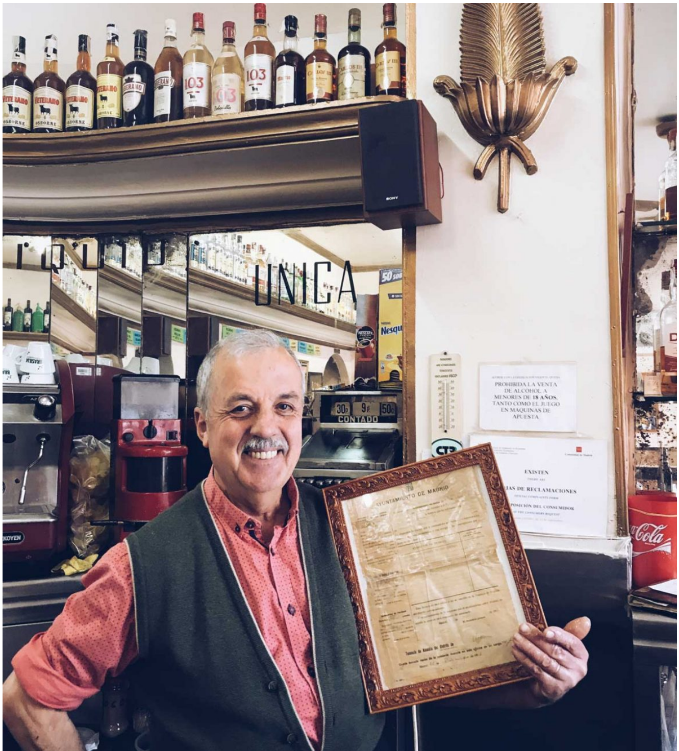
Relive the old Vallecas in Bar Etiquio