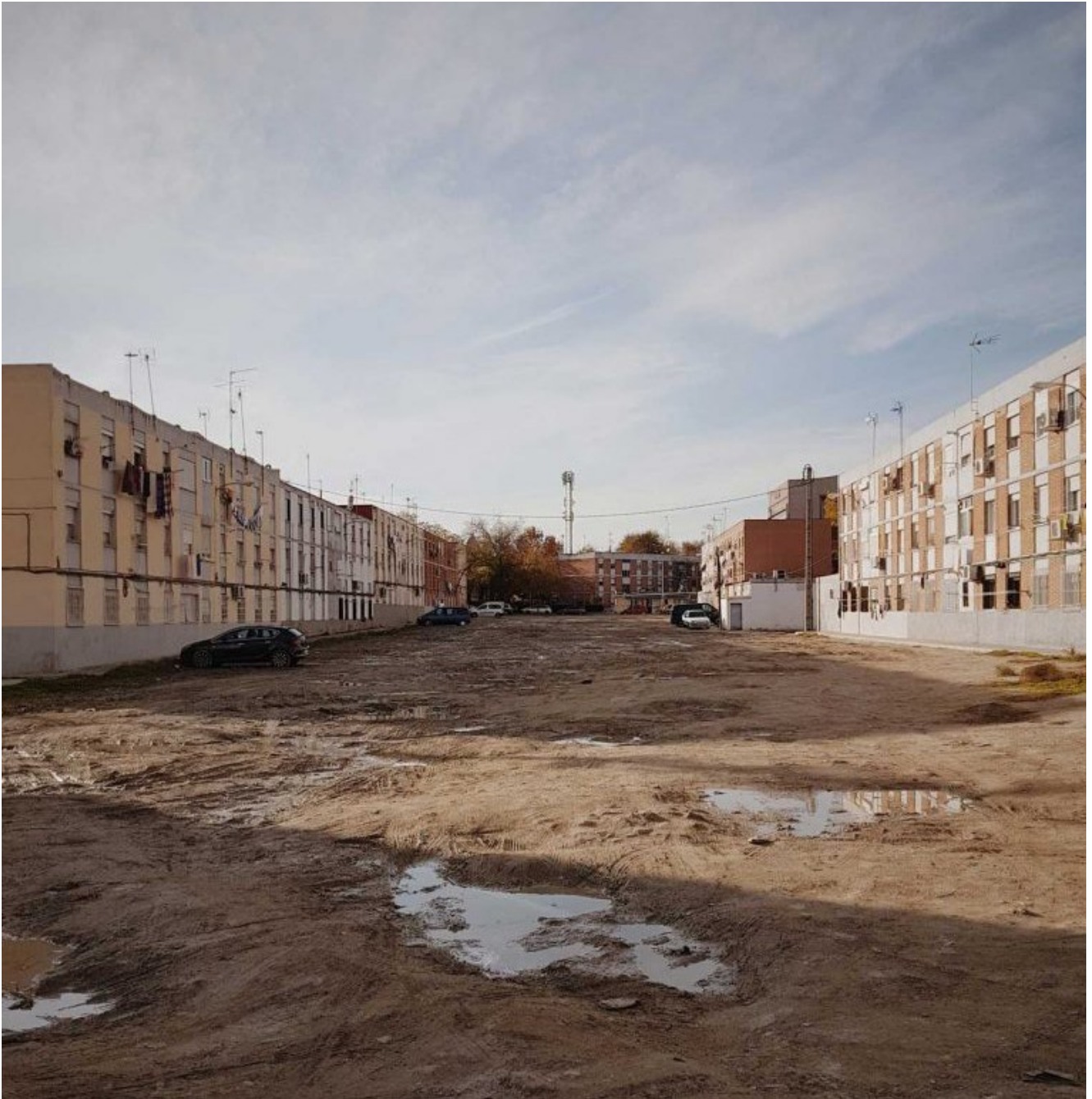
Barrio Aeropuerto, one of the poorest neighborhoods of Madrid, captured in 10 no-frills finds (Vol. VI)