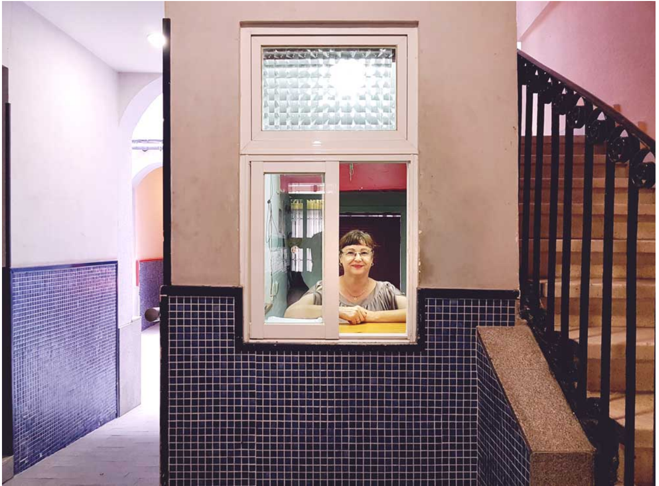
Tale of a Lavapiés concierge