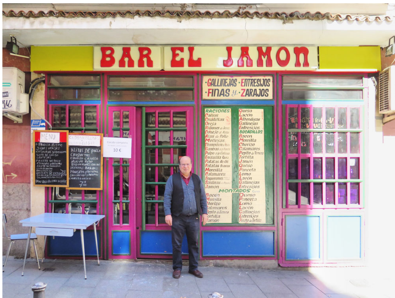
Bar El Jamón: the godfather of Lavapiés

Looking back to the very beginning of Madrid No Frills, I've brought in a lot more human stories. But the core of MNF is still Madrid's no-frills bars. I absolutely love no-frills bars. I genuinely spend a lot of time in them.