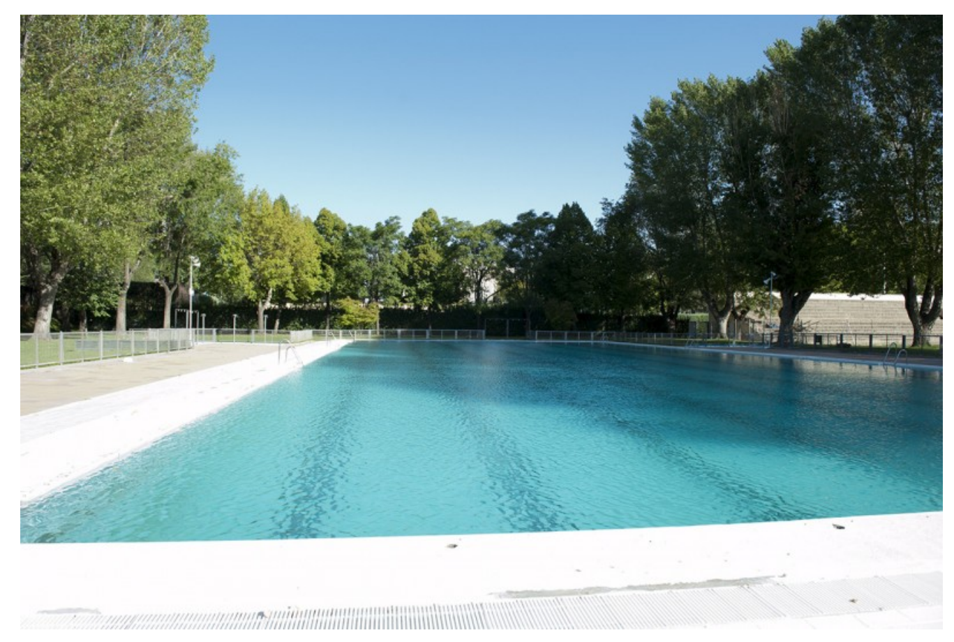
Summer pool by UCM