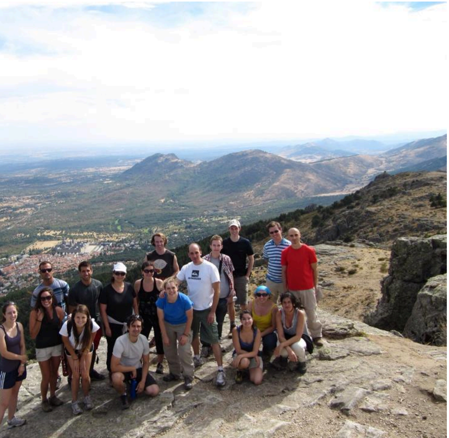
Organised by Hiking Madrid.

Check it out: Website Hiking Madrid or email hikingmadrid@hikingmadrid.com and you can sign up for regular newsletters. Follow on Facebook for regular updates and upcoming events: Facebook Hiking Madrid