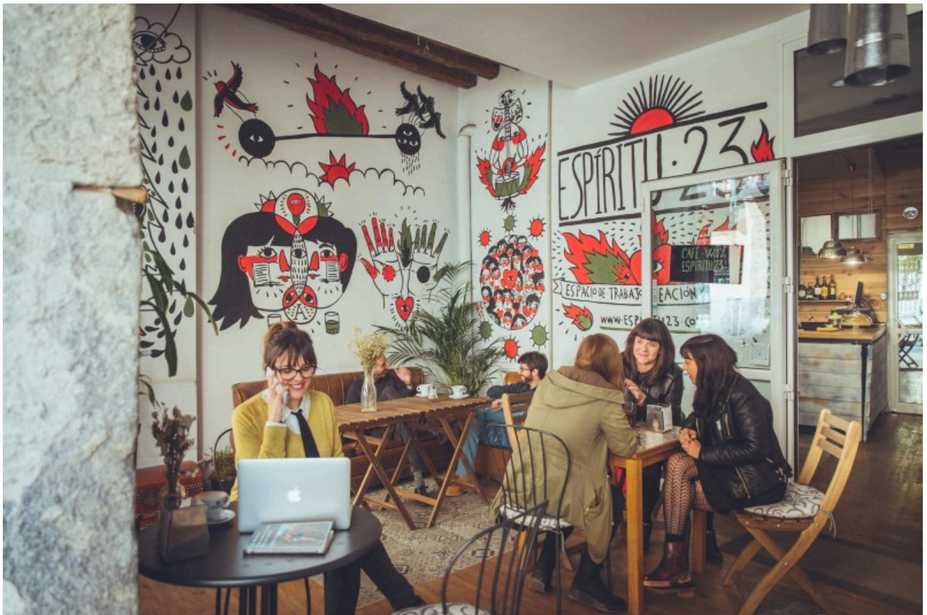
Image from Espíritu 23