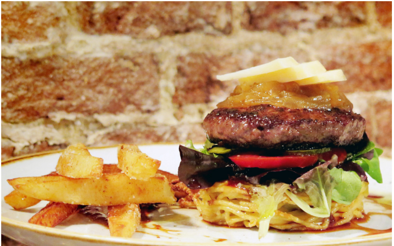
The Spaghetti Burger