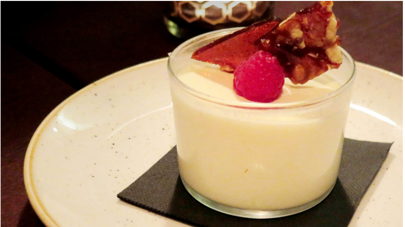
The Amaretto Connection

Despite being pretty full, we ordered the Margherita Cheesecake and the Amaretto Connection for all of us to share, because when a dessert is good enough (and you know what I'm talking about here), you'll find room for it.