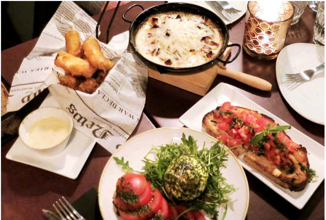
Smoking Bullets, Creamy Meatballs, Bruschetta and Burrata Tricolore