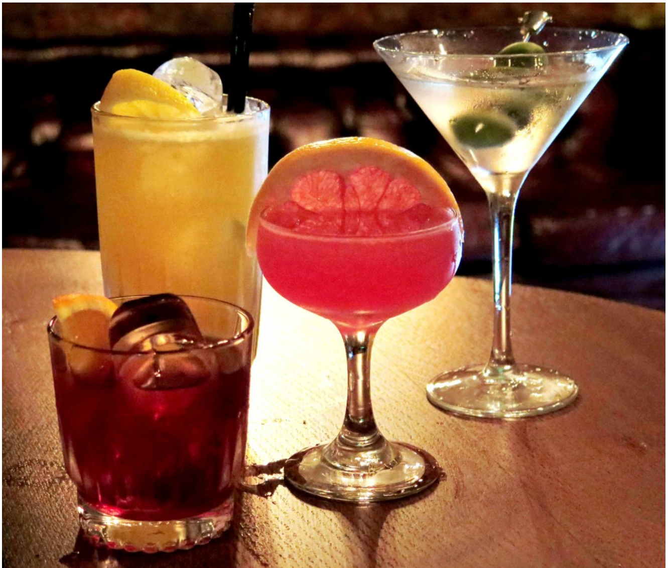
A selection of the classic cocktails

The infamous black market liquors of the Prohibition era echo throughout Luca's cocktails, which are strong enough to cut through all three hearty courses and still leave you feeling merry.