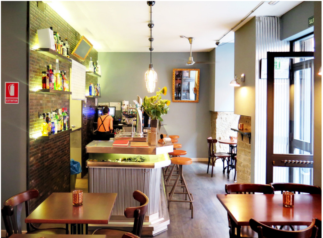
The bar area