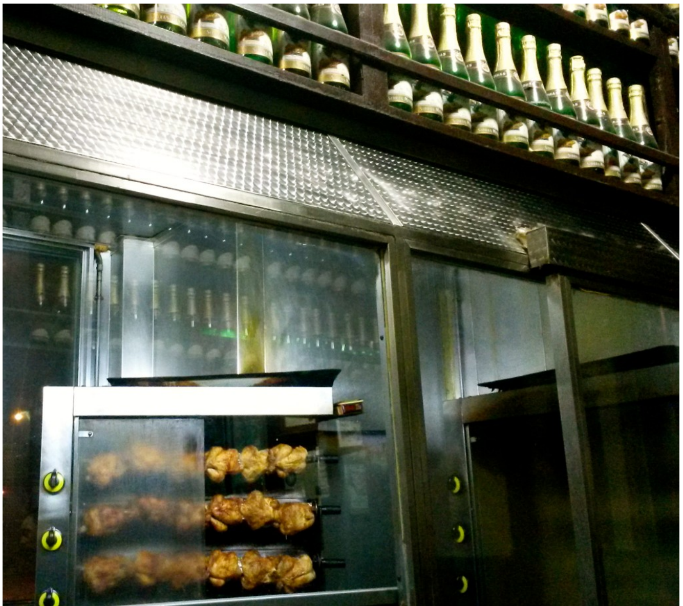
rotisserie chicken and endless cider at Casa Mingo

My favorite dishes are the roasted chicken and the roasted red peppers with tuna . And for dessert, try the tarta de sidra or tarta de santiago .