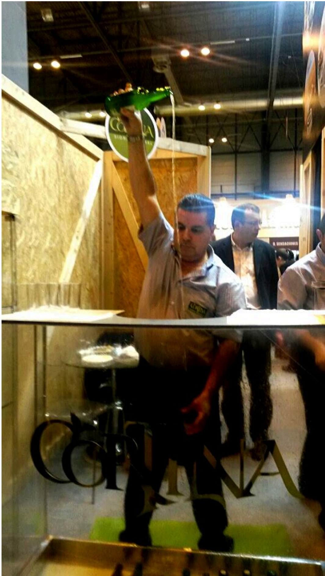
a professional showing how to pour cider the right