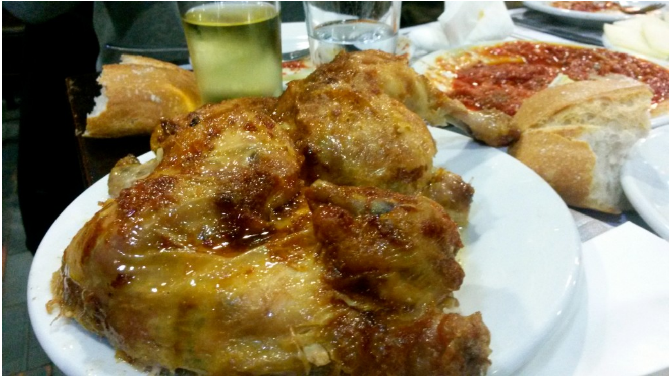
a whole roast chicken at Casa Mingo