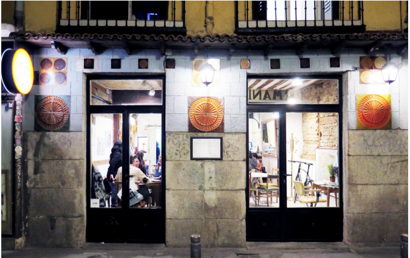
The 0th floor of El Brote