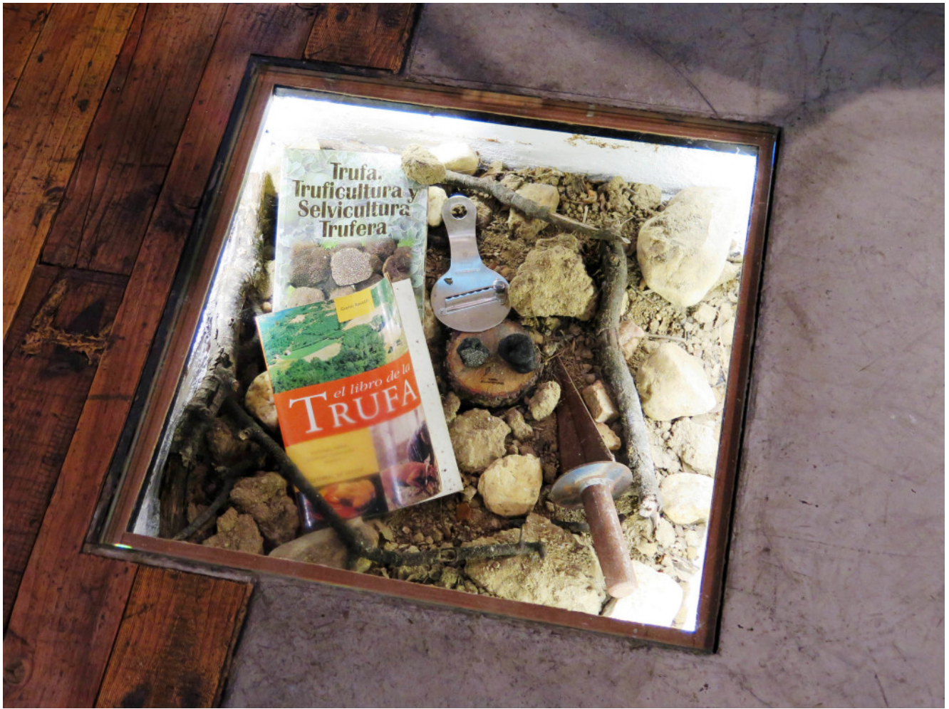
A mushroomy display inside the floor