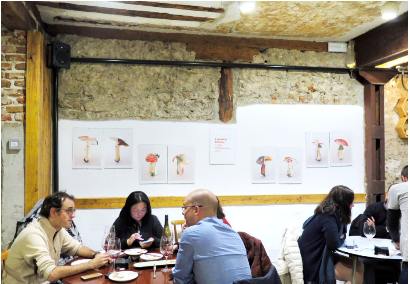
Abstract mushroom artwork