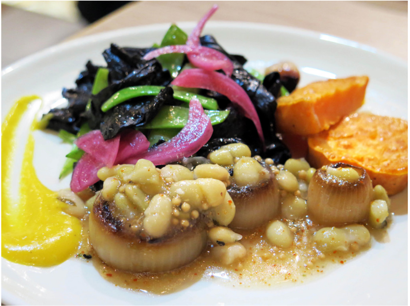
Black mushrooms with beans, squash and leek

Try their wine too, it's really good. We also noticed that every single table in the restaurant was sharing a bottle of red between them... such a beautiful sight.