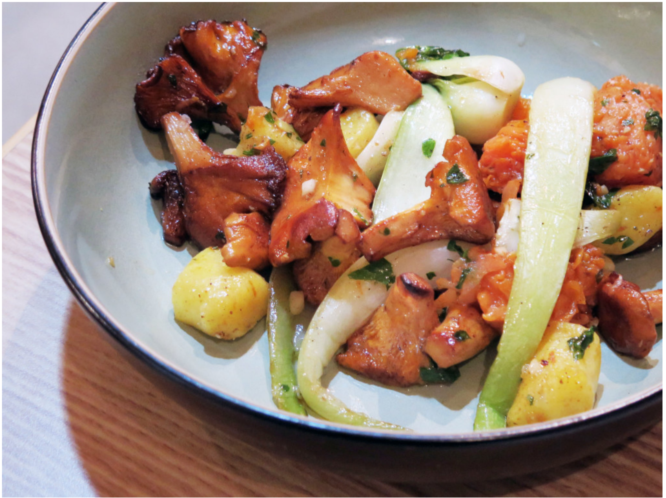
Red mushrooms with pak choy, gnocchi and pumpkin gratin