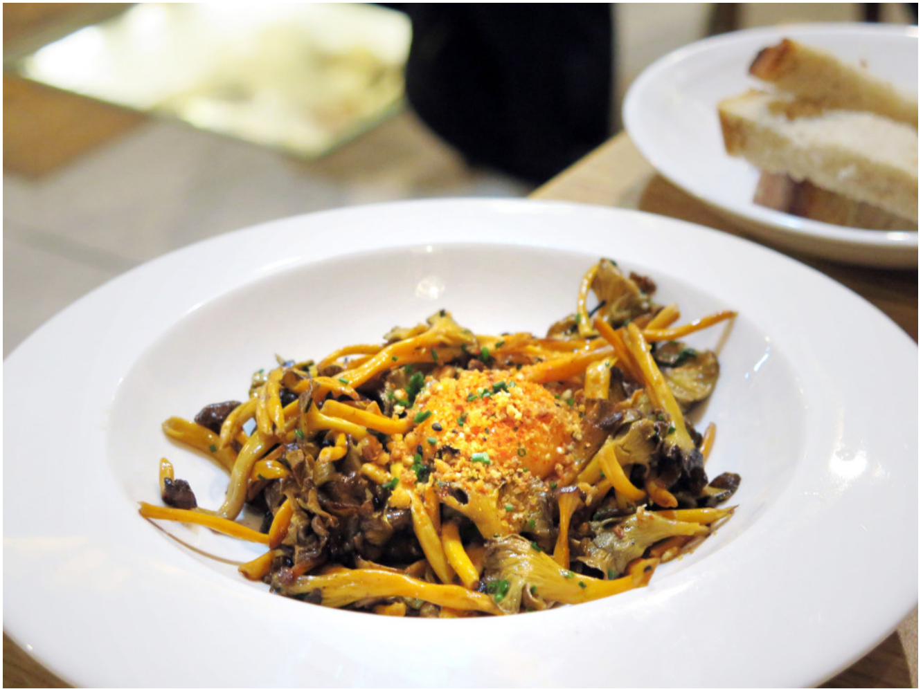
Trumpet mushrooms with a raw egg yolk and herbs