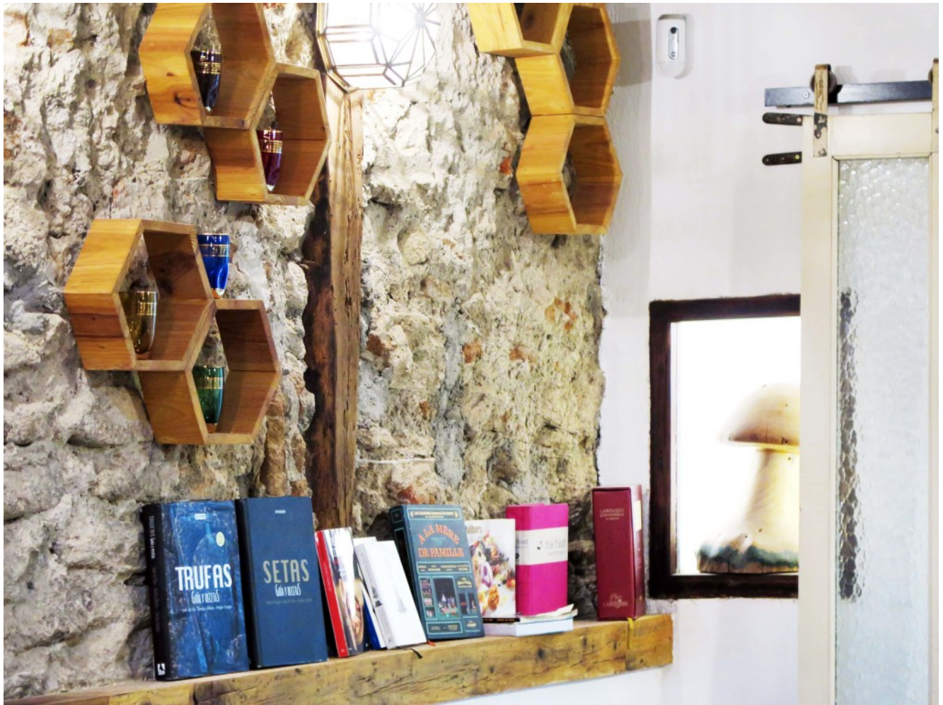
Various gospels of the mushroom bible