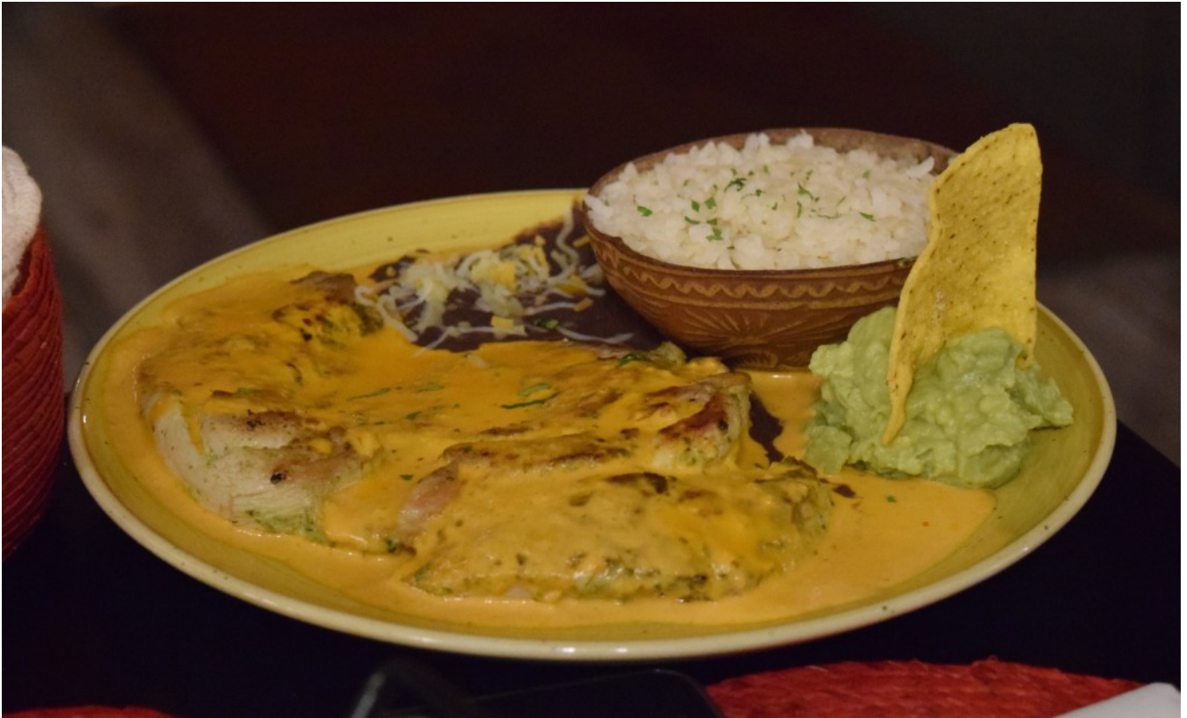
Pollo al chipotle

I'll certainly be returning as soon as humanly possible to sample the rest of the menu, from the salads and ceviche to the enchiladas and desserts. Sahuaro also offers a menú del día during the week and brunch on the weekends, so you can satisfy your cravings no matter what time it is. It's the perfect place to come for a casual drink with friends or even a date; the interior is elegant and colorful, and the enclosed outdoor patio features tropical plants and comfy couches (plus plenty of fans).