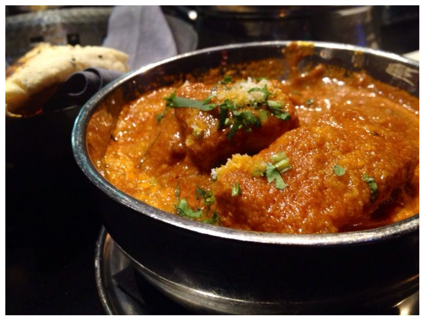
Madras Wali Machli swordfish