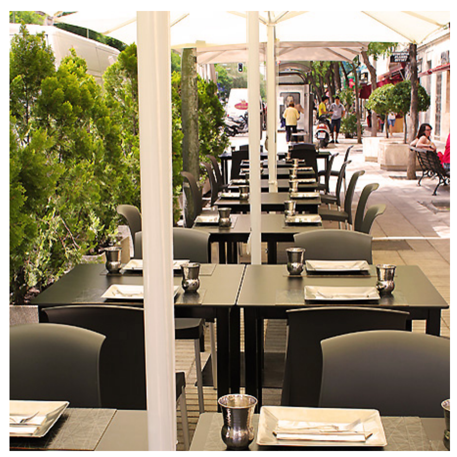
from Tandoori Station's web