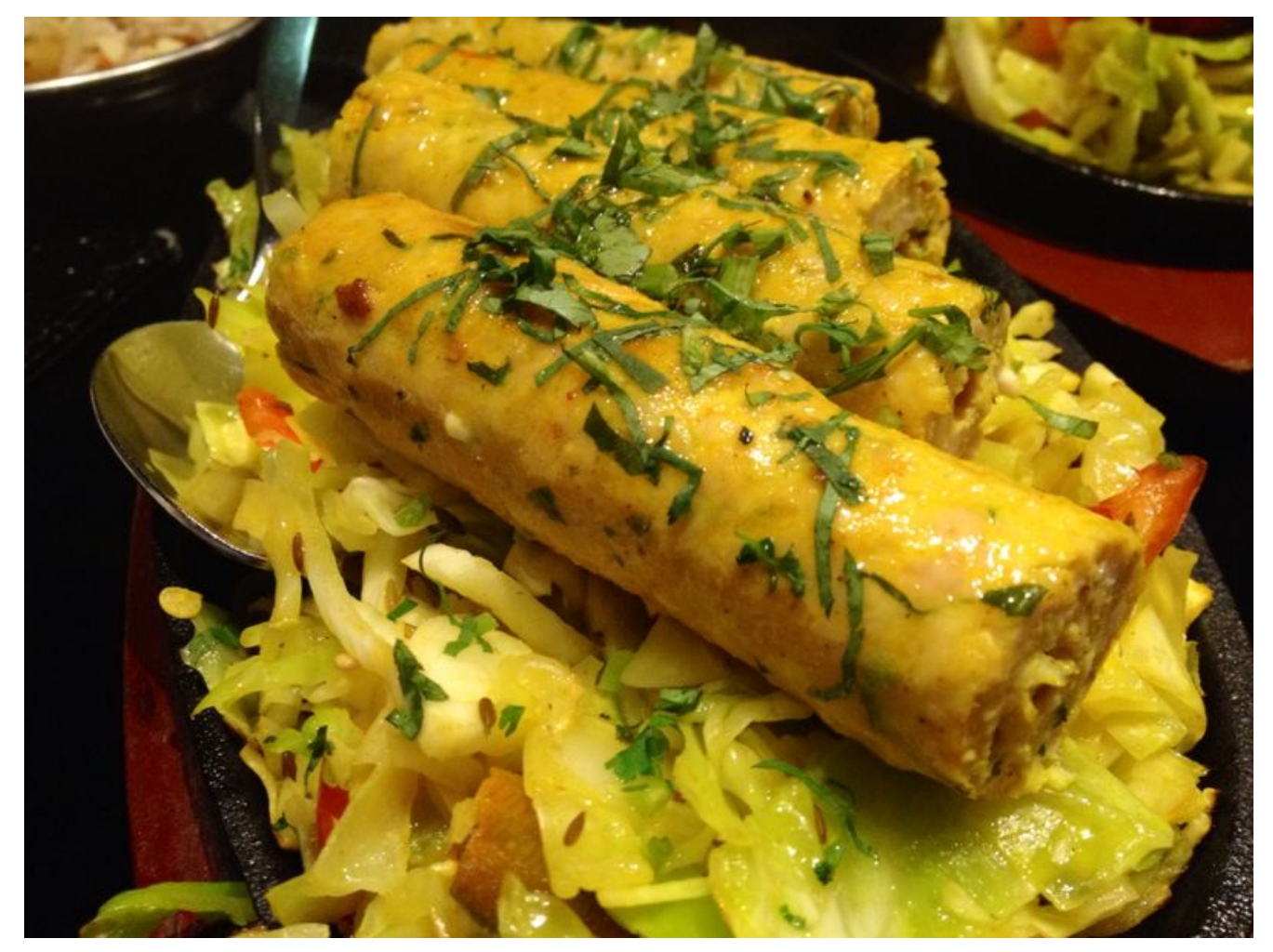
Murghi Ki Balti chicken curry

We shared several other dishes too. Our table was full of colours and smells, and it took some creativity as to what sauce and rice to mix with what chicken or vegetable. We had Murgh Ka Tikka (marinated tandoori chicken) which I liked even more than the Murghi Ki Balti .