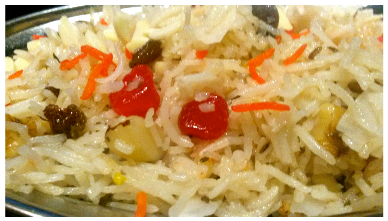
Kashmir Ka Pulau rice