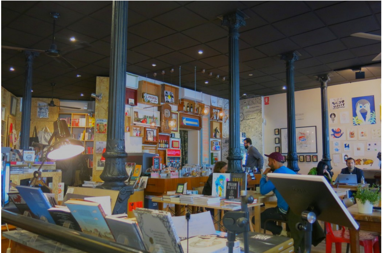
Swinton & Grant, Embajadores

Natural light streaks through black velvet curtains, revealing two main areas: on the first floor, Ciudadano Grant , a café-bookstore. In the basement, the Swinton Gallery , a large space for local artist exhibitions.