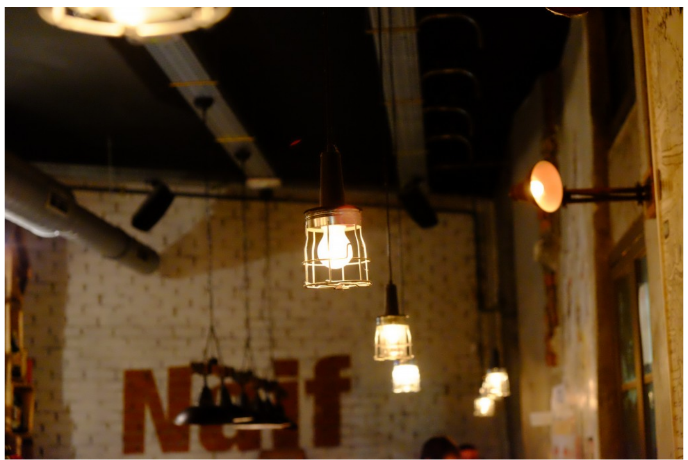
And beyond burgers, dessert awaits on the horizon. There is carrot cake, of course, as well as cheesecake and American Pie. It's not your mom's recipe, but it's pie! Inexplicably,