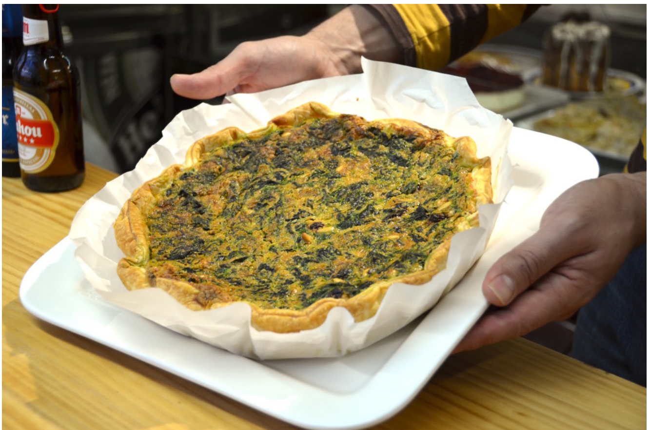
Vegetarian spinach quiche

This is a great place to get authentic Portuguese food, from a variety of quiches and the classic Pastéis de Belém , to empanadas , arancini and everything bacalao . Here are a few photos of their snack food, very proudly displayed by the jolliest of the three musketeers: