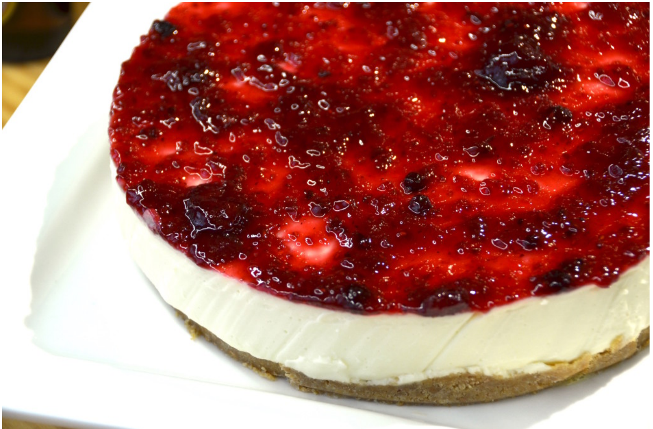
Strawberry cheesecake (wow)

You can also buy a selection of Portuguese beers and wines (including vinho verde ), plus an almond liqueur ( licor de amêndoa ) specially driven over from Portugal by the guy on the right. I bought their last bottle a couple of weeks ago and with it came this story – suddenly €12 seemed like an absolute steal. You'll be glad to know that they've since been back to Portugal and brought another few bottles for us, but get it while you can – or I will!