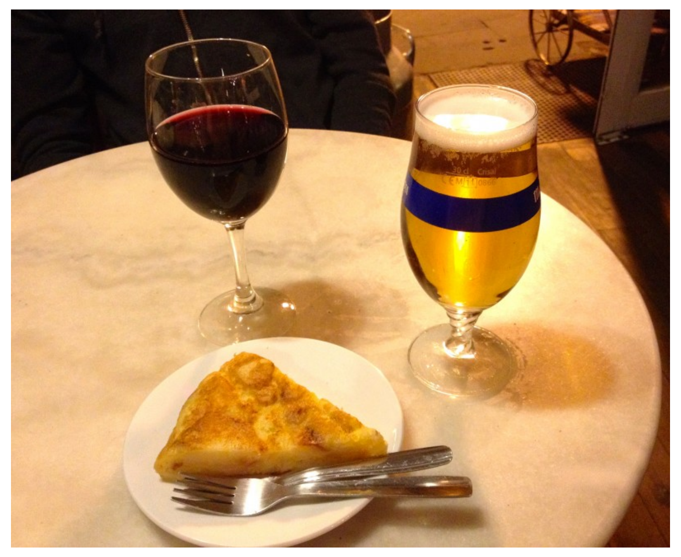
my favorite tapa at La Paca

In this quintessential Malasaña café , you've also got to try their tortilla de patatas (homemade Spanish omelet), it is my favourite!