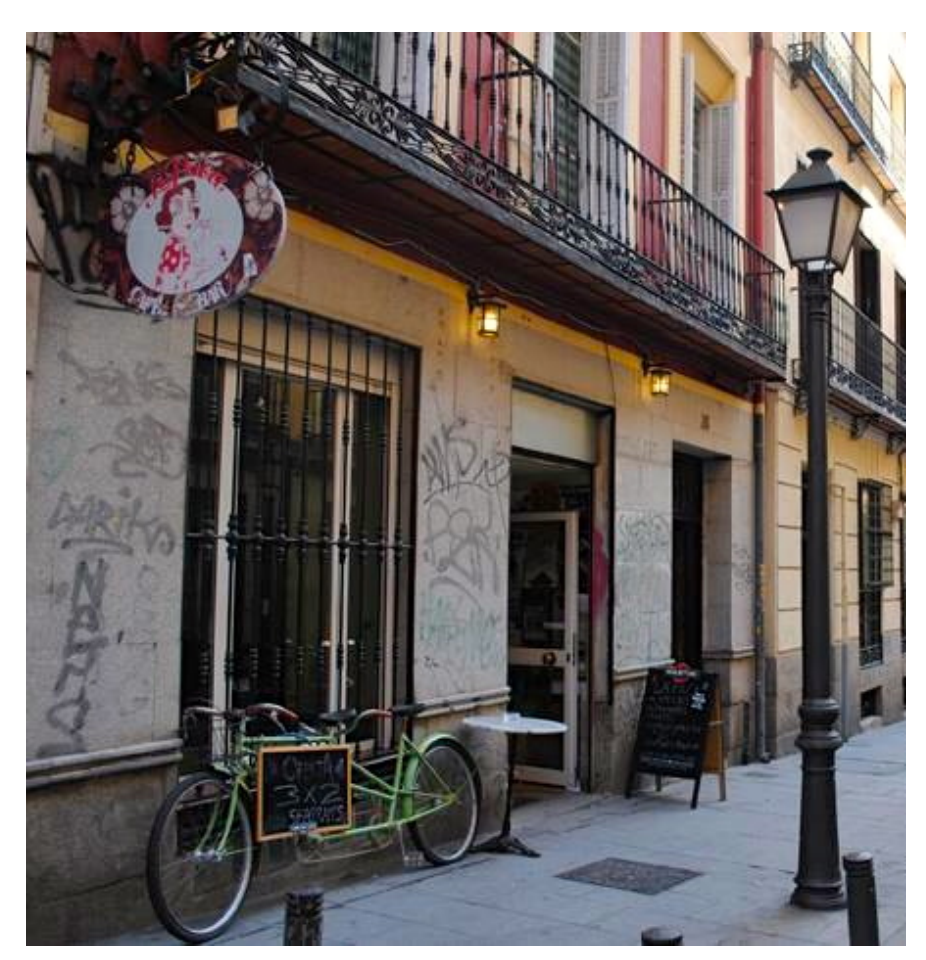
La Paca's facade on calle Valverde in Malasaña

As you walk through La Paca's door, you feel like you're in the right place. This funky café in Malasaña is always a good choice when you're in the mood for a coffee, a beer, or something stronger.