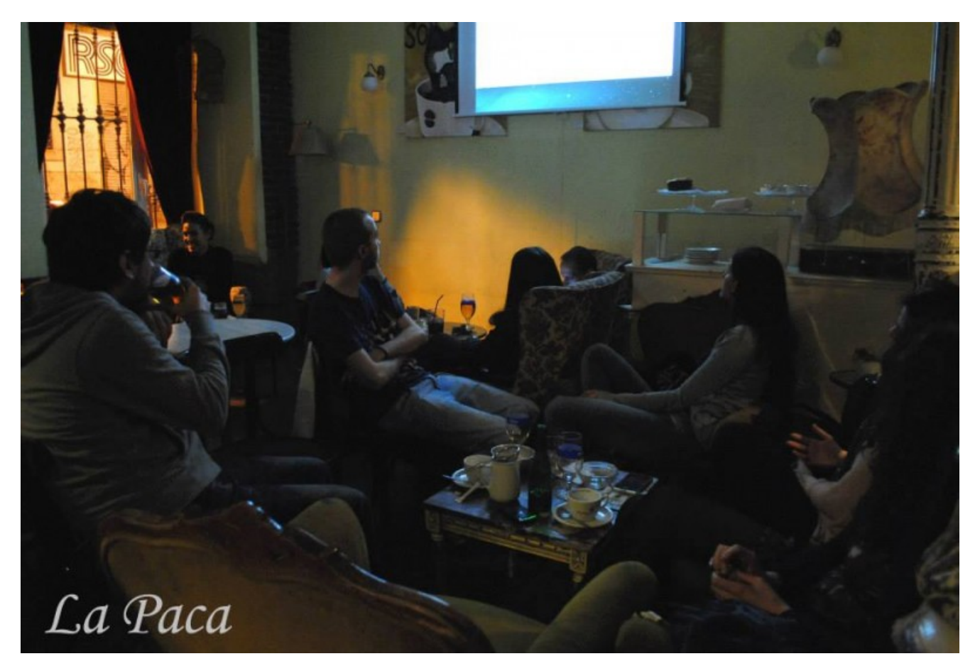
free movie nights on Wednesdays at La Paca in Malasaña

with no order whatsoever (plus the popcorn is also free!). I went last Wednesday and saw Kill Bill I , and the week before they had shown Taxi Driver (in Spanish with no subtitles).