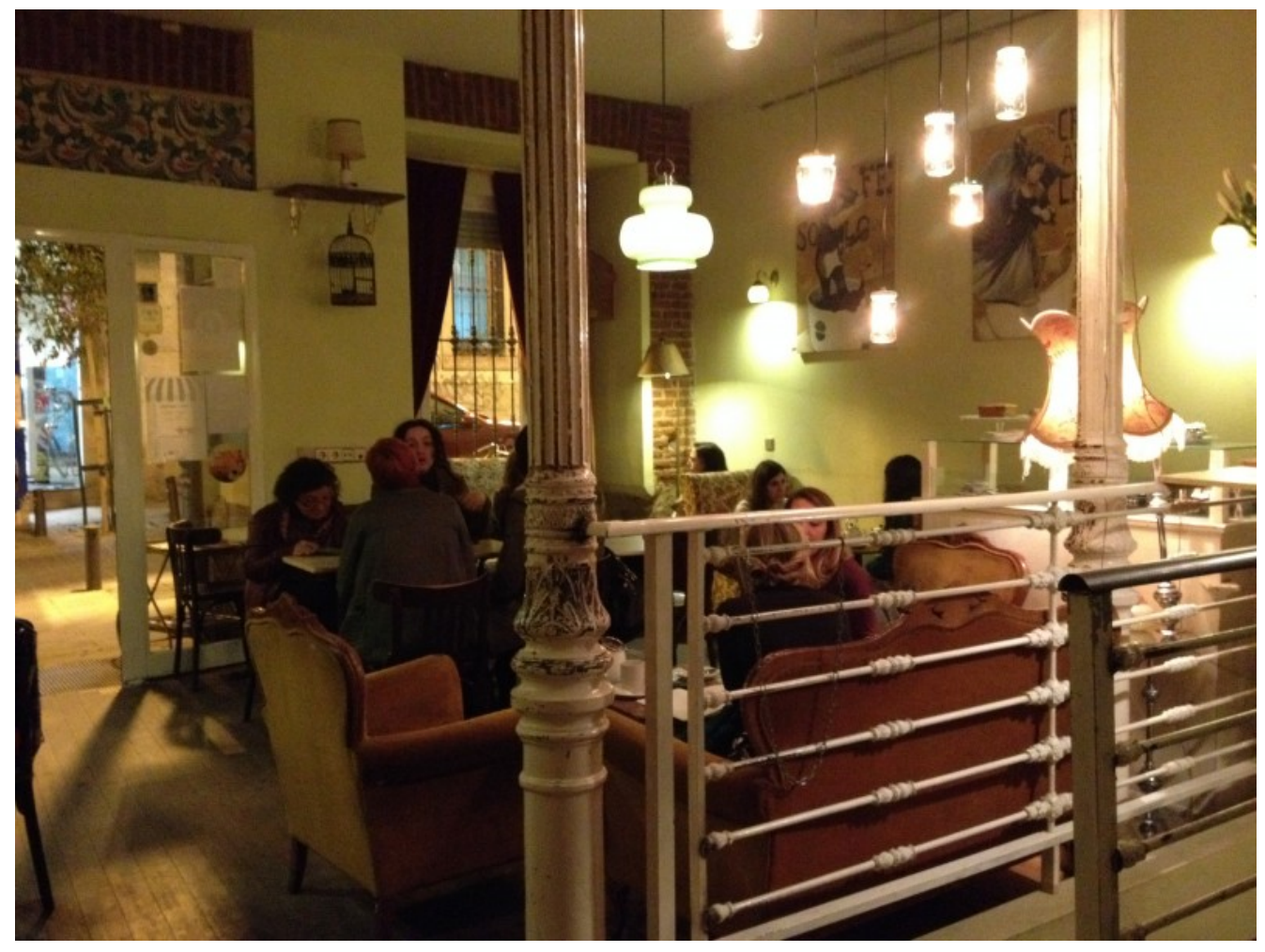
funky furniture at La Paca

La Paca is divided into two areas: the ground bears a worn-out floor from a different time period, when the place used to be a family's house. Vintage furniture from every single corner of Spain fills the room: old sofas, lamps, Galician mirrors, and bird-cages. La Paca's owner is an antique collector who travels across Spain in pursuit of treasure troves. You can find his finest pieces either sold at his vintage store La Republicana, or displayed at La Paca.