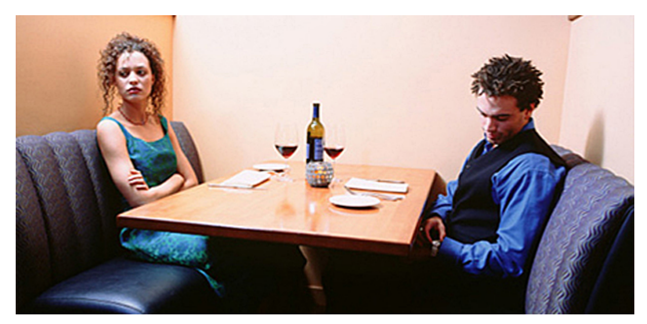
The moment: Check your phone or ditch all together

I get nervous and will probably continue to get nervous when planning a first date. It's not easy. It can even be daunting. You might have just met the girl/boy on a drunken Saturday night and you find yourself trying to come up with a way to entertain, show off, and come across as interesting and intelligent all at once. So I'm back to getting nervous and with little idea of what might or might now work.