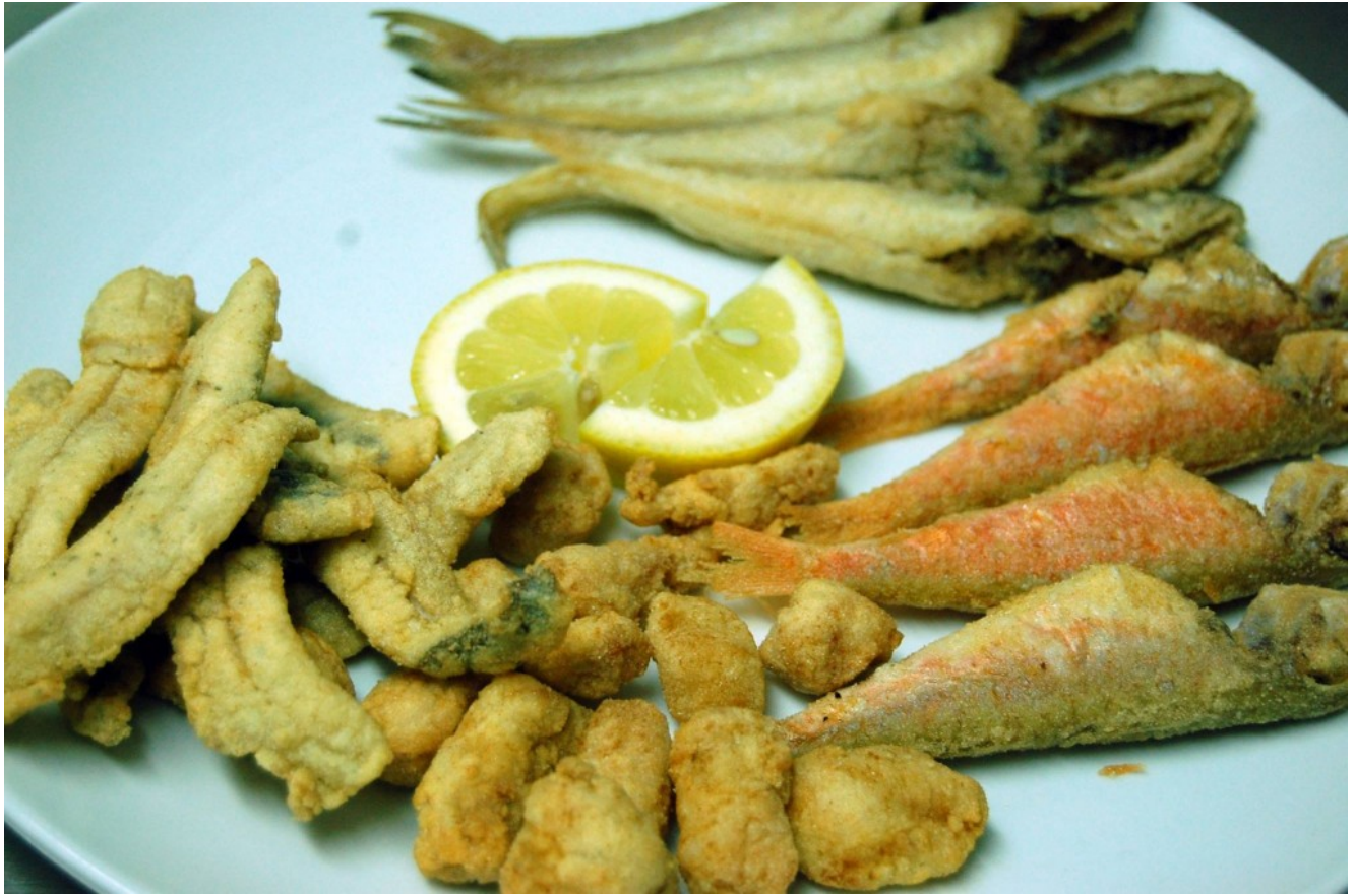
assorted pescadito frito