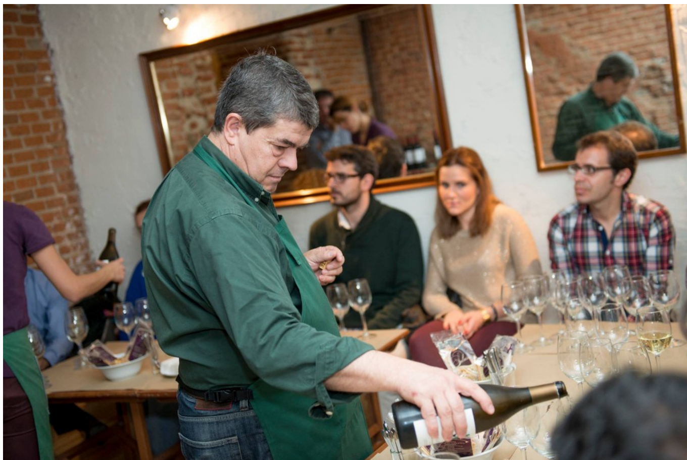
Owner and father Pepe serving at a wine tasting in the cellar

On Thursdays, Lambuzo also holds Microteatro : they showcase 30-minute theater performances, from 9pm-11pm. Each session costs 4€ , plus you're more than welcome to grab a drink at the bar and bring it down to the cellar as you enjoy the show, and then go right back upstairs for more when it's over.