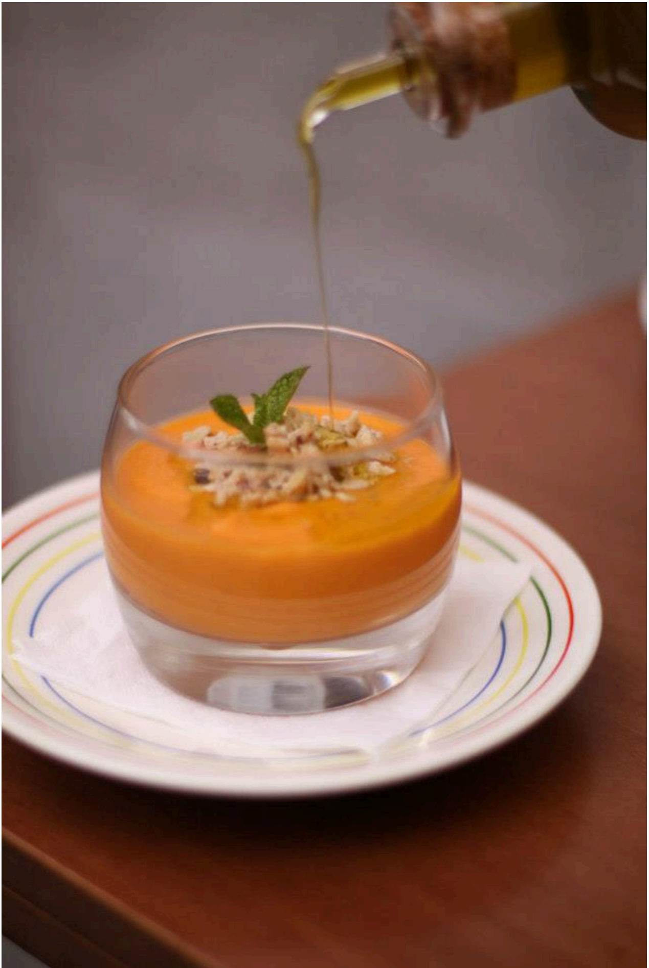
Salmorejo, a cold soup or dip originating from Cordoba,