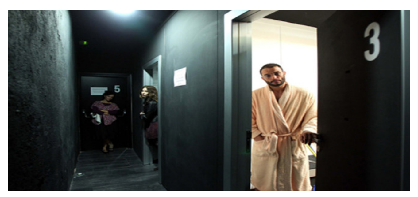
What surprise will await?

Act Three: <u>Microteatro</u> por dinero in Calle de Loreto Prado y Enrique Chicote, 9