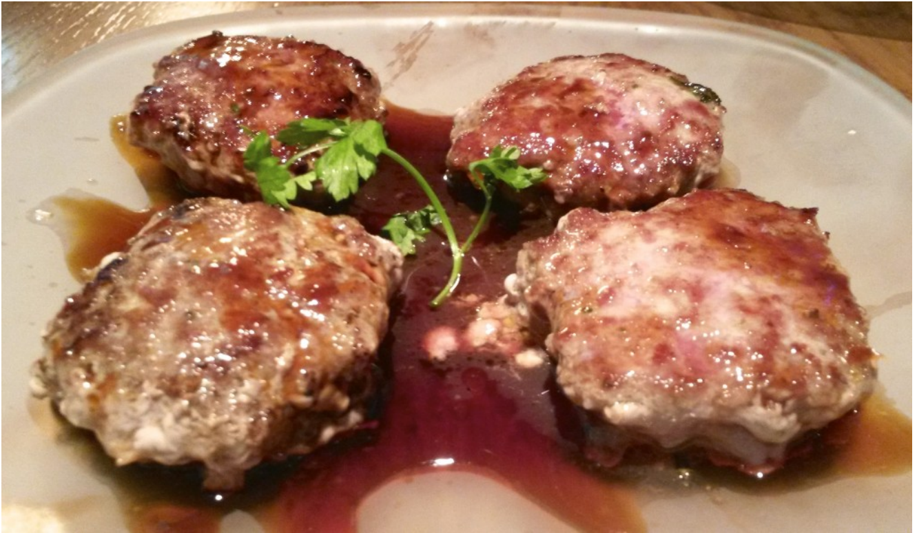
mini hamburguesas con reducción de Pedro Ximenez (sherry reduction)

One of our latest and most surprising discoveries was the tortilla de patata (Spanish potato and egg omelette). This Spanish staple is so common that it had never occurred to us to order it at Lateral . But don't be fooled, please do try their tortilla de patata right away. It's really one of the best I've had in Madrid.