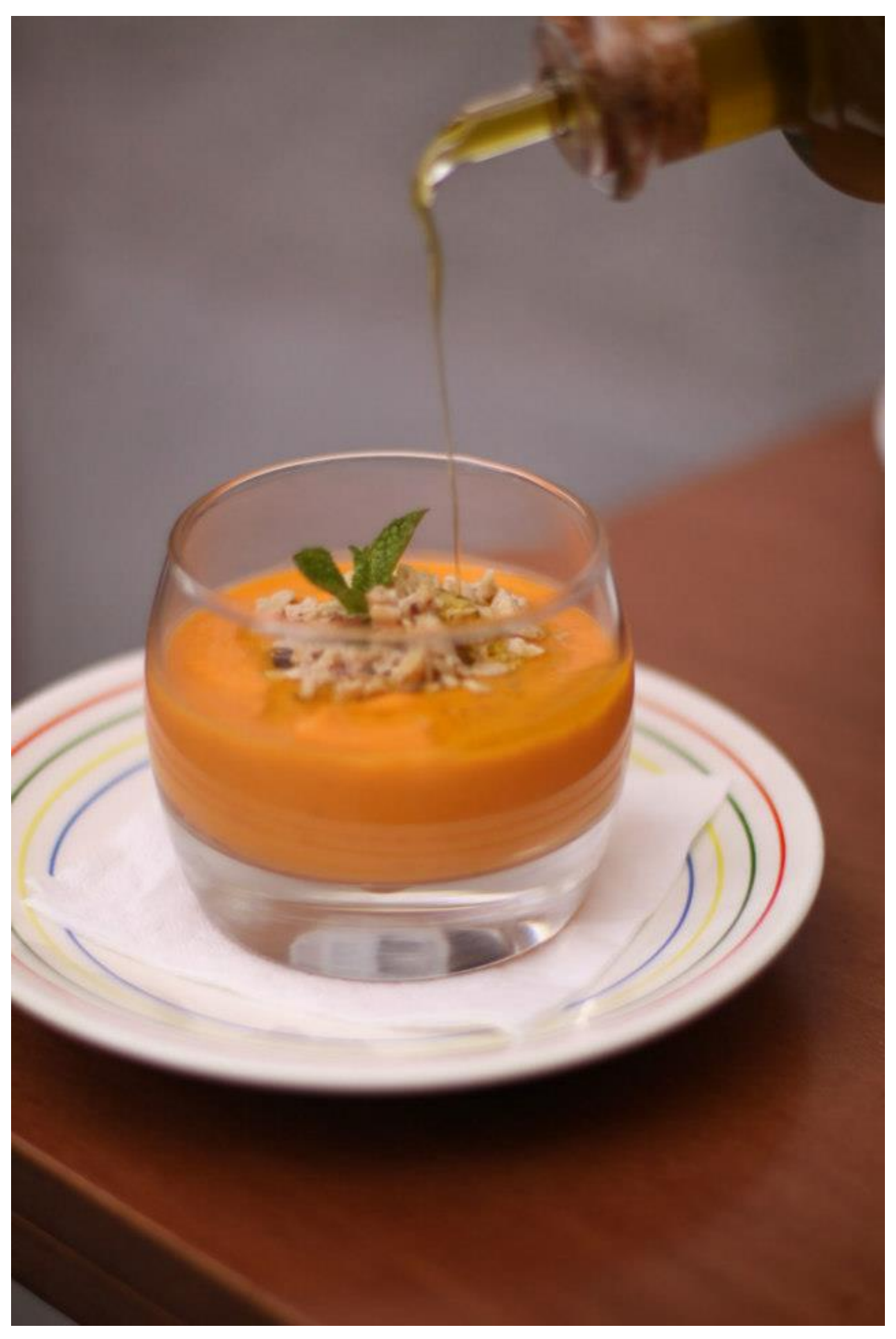
Salmorejo, a cold soup or dip originating from Cordoba,