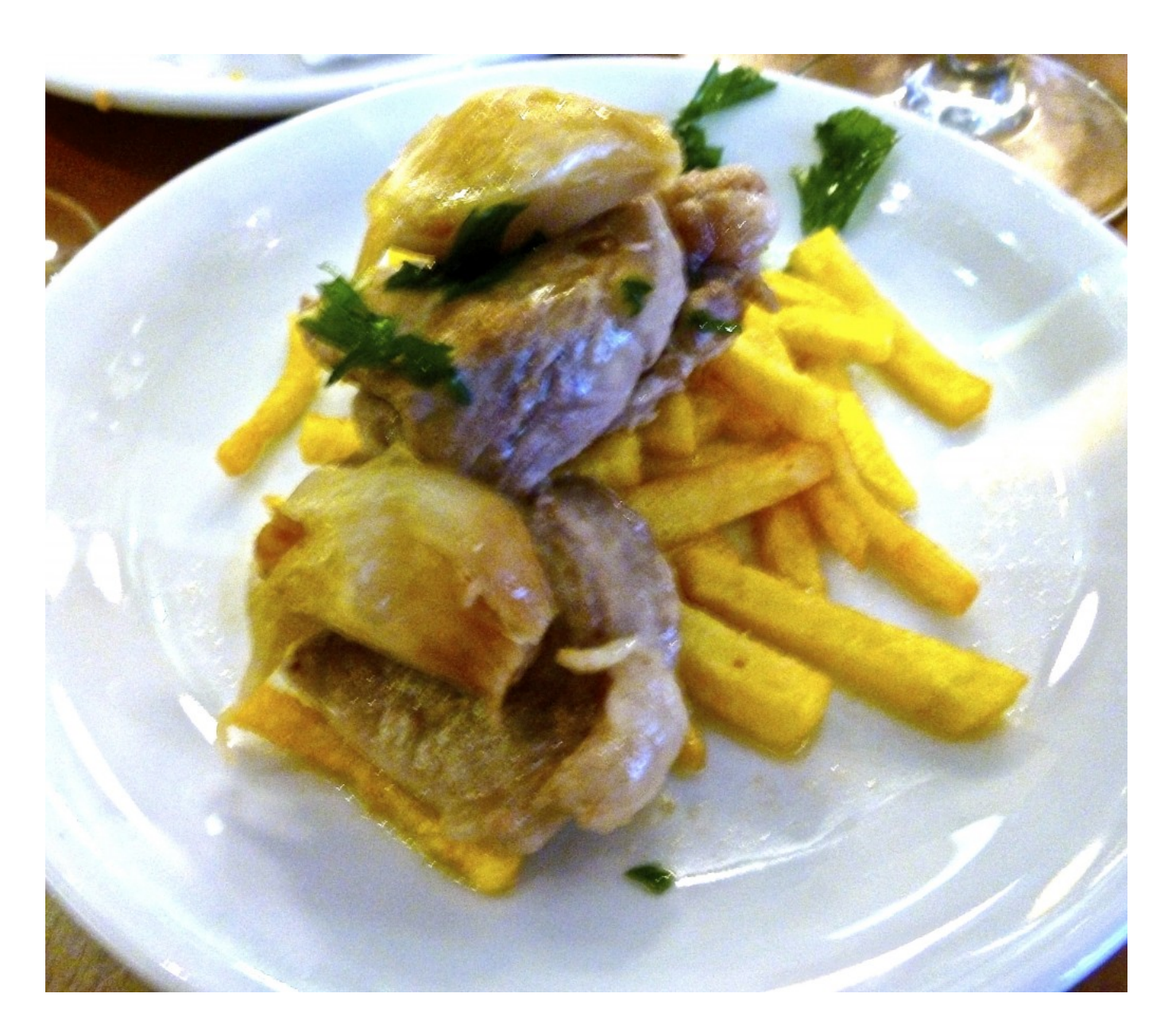
solomillo al whisky (pork tenderloin with roasted garlic, served on top of handcut french fries)

made with tomato, bread and olive oil, topped with tuna and then drizzled with some more, olive oil