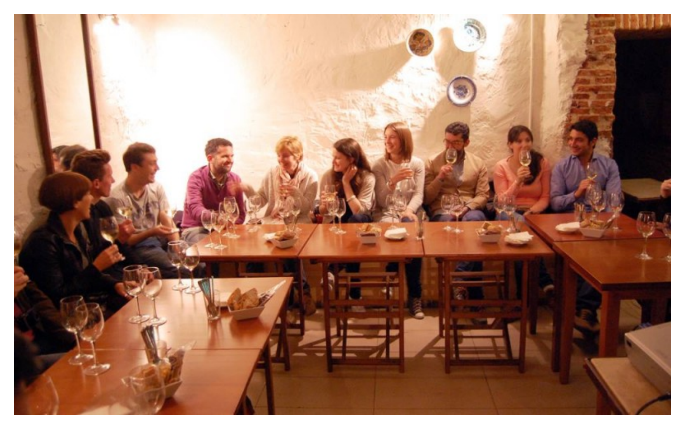
with friends in Bar Lambuzo's underground cellar, tasting wines from Bodegas Barbadillo

What's more, Lambuzo offers fun activities in the downstairs wine cellar, from football forums to wine-tastings and olive-oil-tastings. I've been to the tastings and highly recommend them! At the last wine tasting I went to, we had a presentation from Bodegas Barbadillo, a winery from Cádiz that is actually the house wine at Bar Lambuzo. As usual, we tried three different types—rosé, white and red—the red was really spectacular.