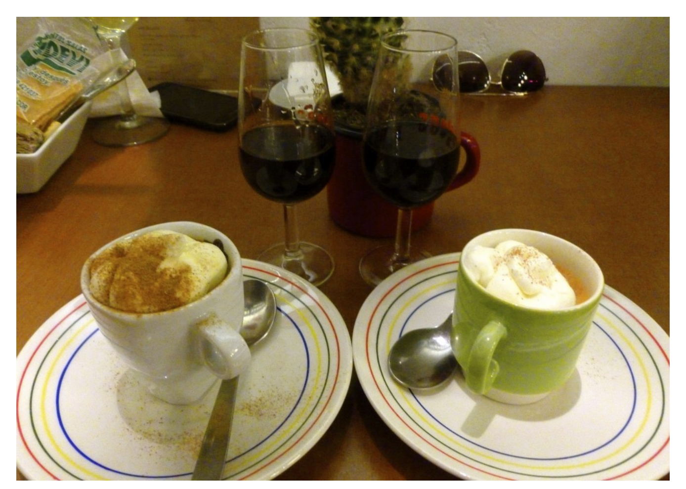
tocino de cielo, made by daughter Ignacia (similar to creme brûlée without the crunchy top layer)

Lambuzo's tapas range in price from 3 \in -5 \in , and main dishes average at 11 \in . For lunch. They offer a menu del día (set lunch menu) for 10 \in . with a starter, main dish, drink, plus coffee or dessert. And they have an express lunch menu for 8 \in . including one dish.