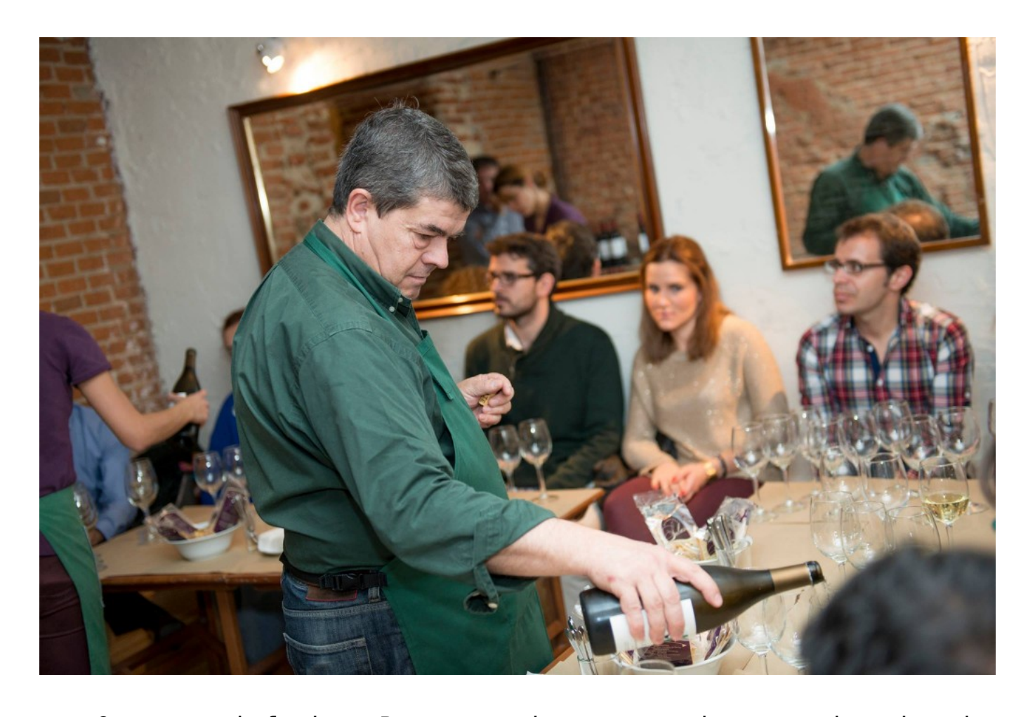
Owner and father Pepe serving at a wine tasting in the cellar

On Thursdays, Lambuzo also holds Microteatro: they showcase 30-minute theater performances, from 9pm-11pm. Each session costs 4€ , plus you're more than welcome to grab a drink at the bar and bring it down to the cellar as you enjoy the show, and then go right back upstairs for more when it's over.