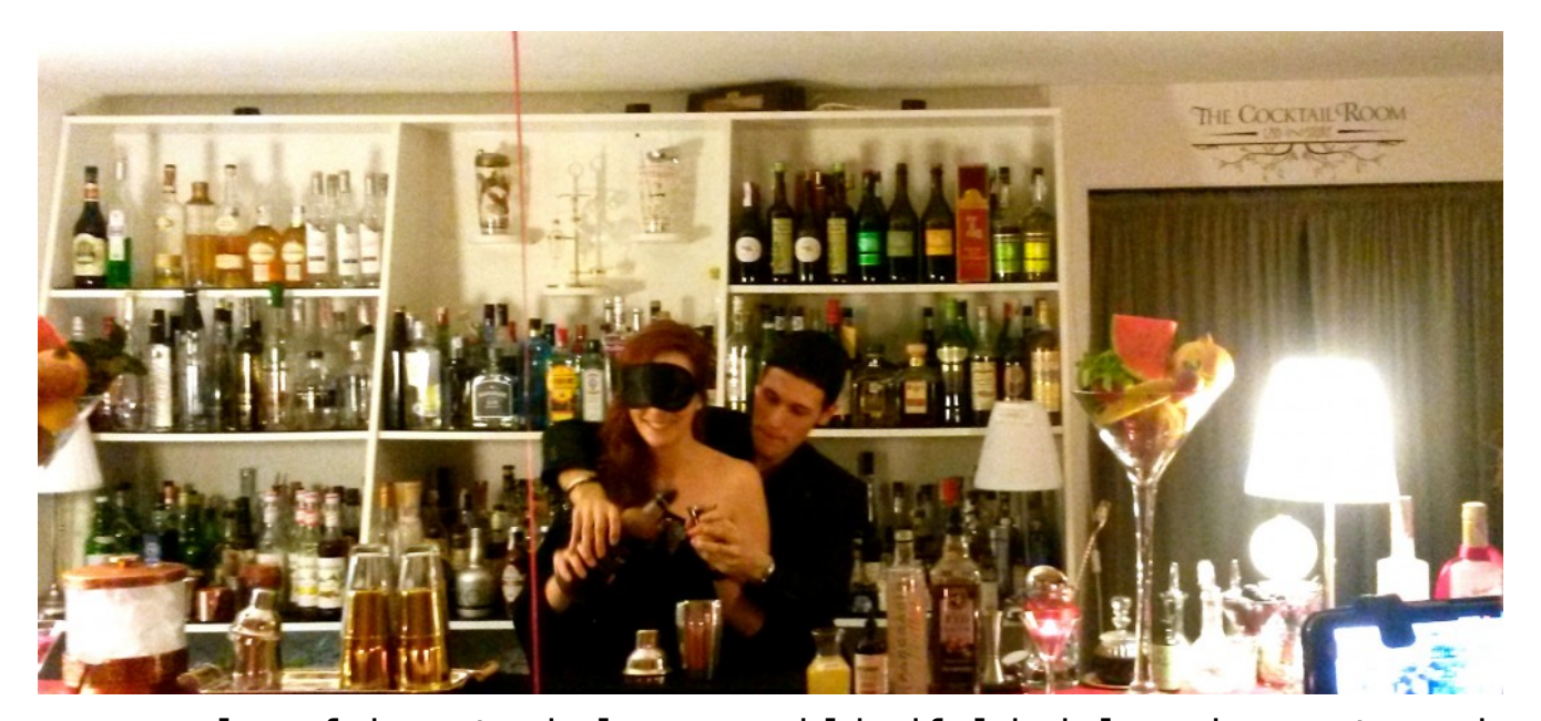
an example of how to help your blindfolded loved one to make an aphrodisiac cocktail. much better than couple's therapy...