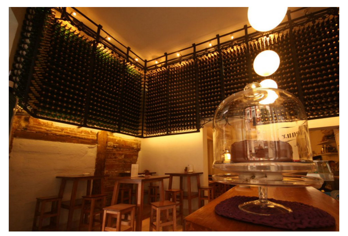
the entrance invites you in with thousands of wine bottles decorating the walls

Opened a little over a year ago, Bar Lambuzo has already become a beloved neighborhood spot for its authentic cuisine, warm ambience and family-style service; it is a haven for Andalusians living away from home, and for anyone seeking a true taste of the South in the center of Madrid .