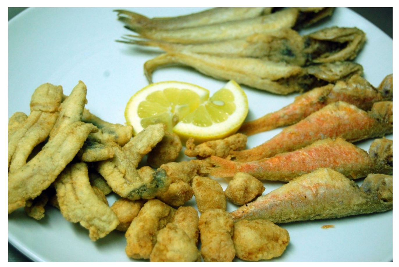
assorted pescadito frito