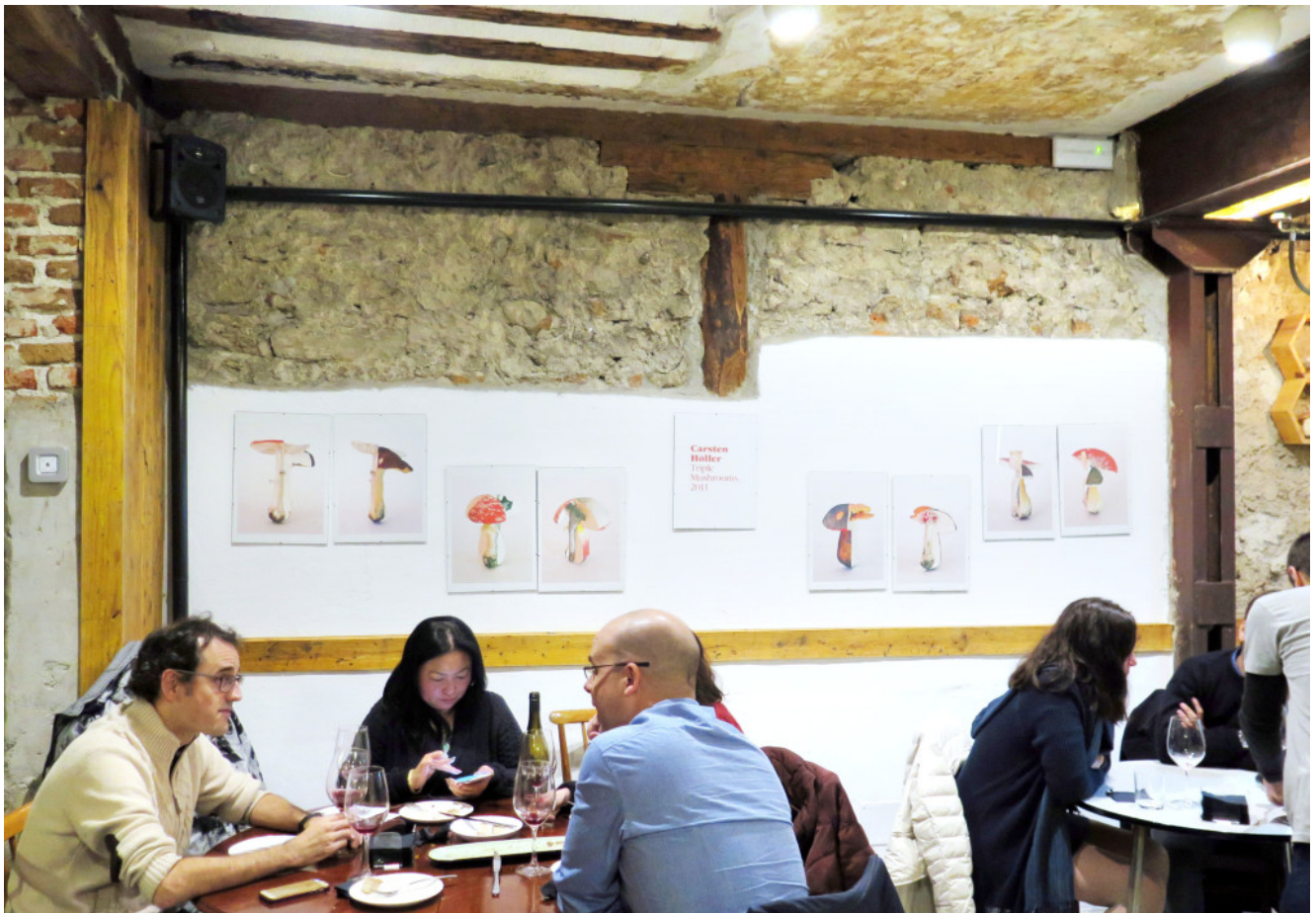
Abstract mushroom artwork