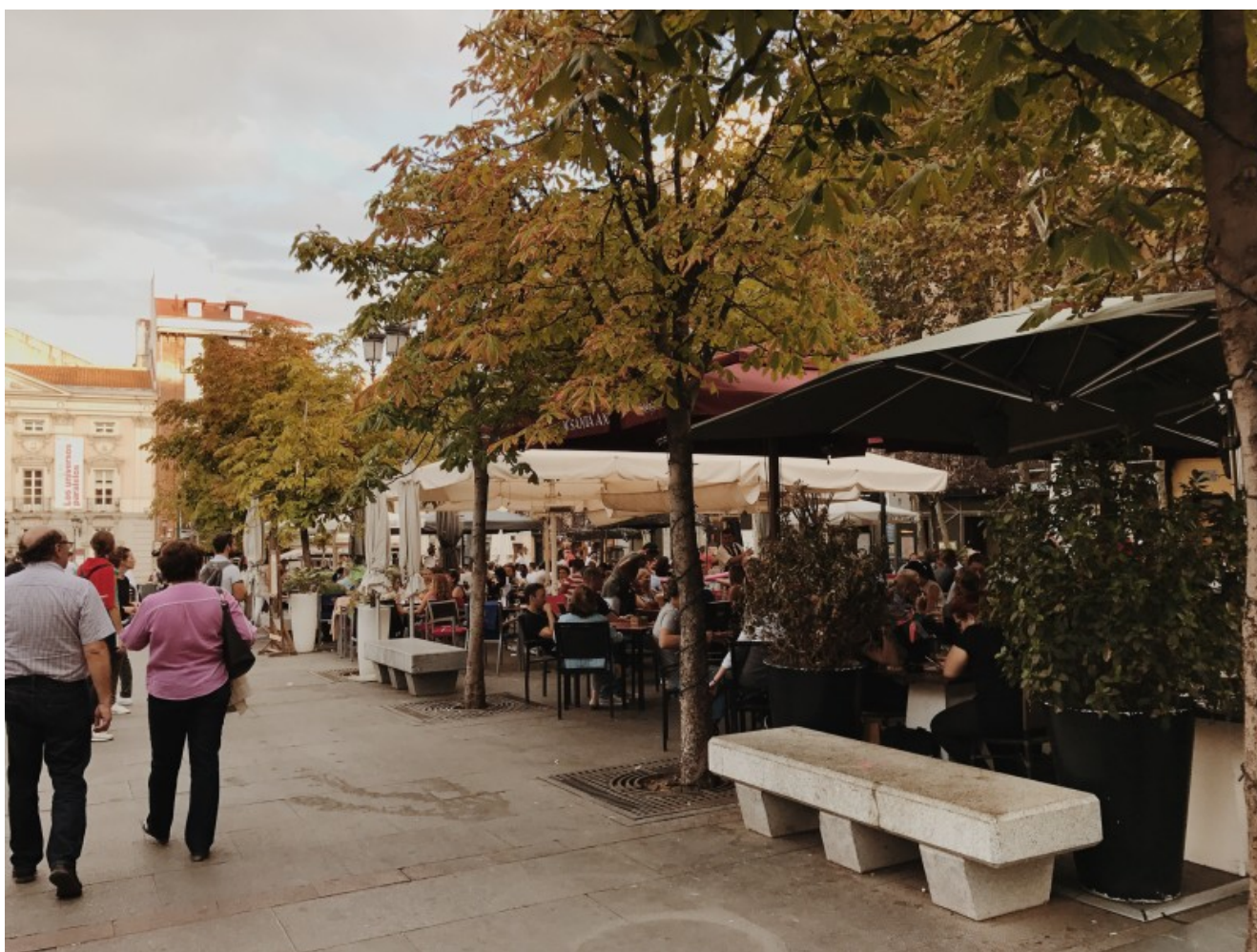
Plaza Santa Ana

When I first moved to Madrid I walked that well trodden path like so many ex-pats had done before me; the month long TEFL course. I rocked up with my Spanish phrase book, some SPF 20 and the overwhelming desire to live abroad. With no set plan (well, with no actual plan at all having quit my job in PR back in London) I quickly got into the groove of my new TEFL timetable; which essentially meant a 3pm finish. As soon as my 'working' day was done, I would wile away afternoons in Plaza Santa Ana.