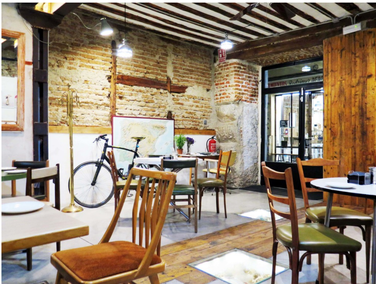
El Brote's dining area

Mushrooms: they're an inspiring subject one can easily get carried away with, especially after paying a visit to El Brote. Years of academic mushroom knowledge and on-the-ground wisdom were literally delivered to us on a plate and I'm now a devout mushroom apostle on a mission to spread the message to the foodie people of Madrid.