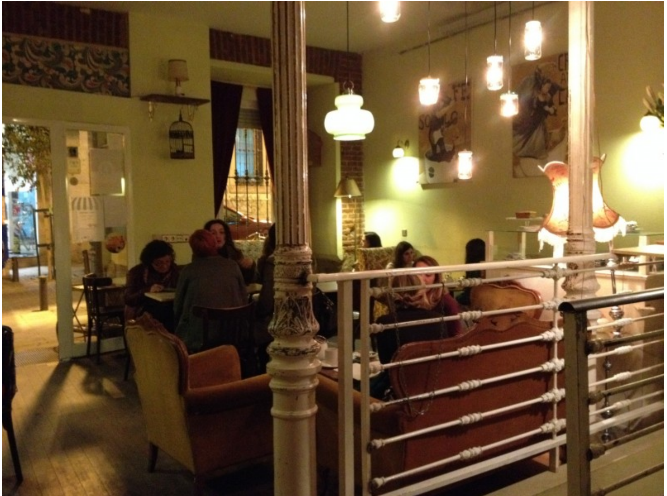
funky furniture at La Paca

of Spain fills the room: old sofas, lamps, Galician mirrors, and bird-cages. La Paca 's owner is an antique collector who travels across Spain in pursuit of treasure troves. You can find his finest pieces either sold at his vintage store La Republicana , or displayed at La Paca.