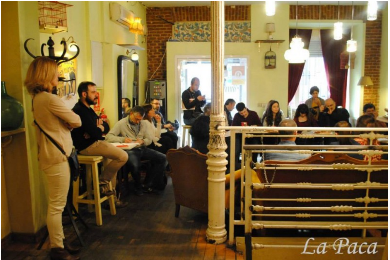
Theater performance at La Paca