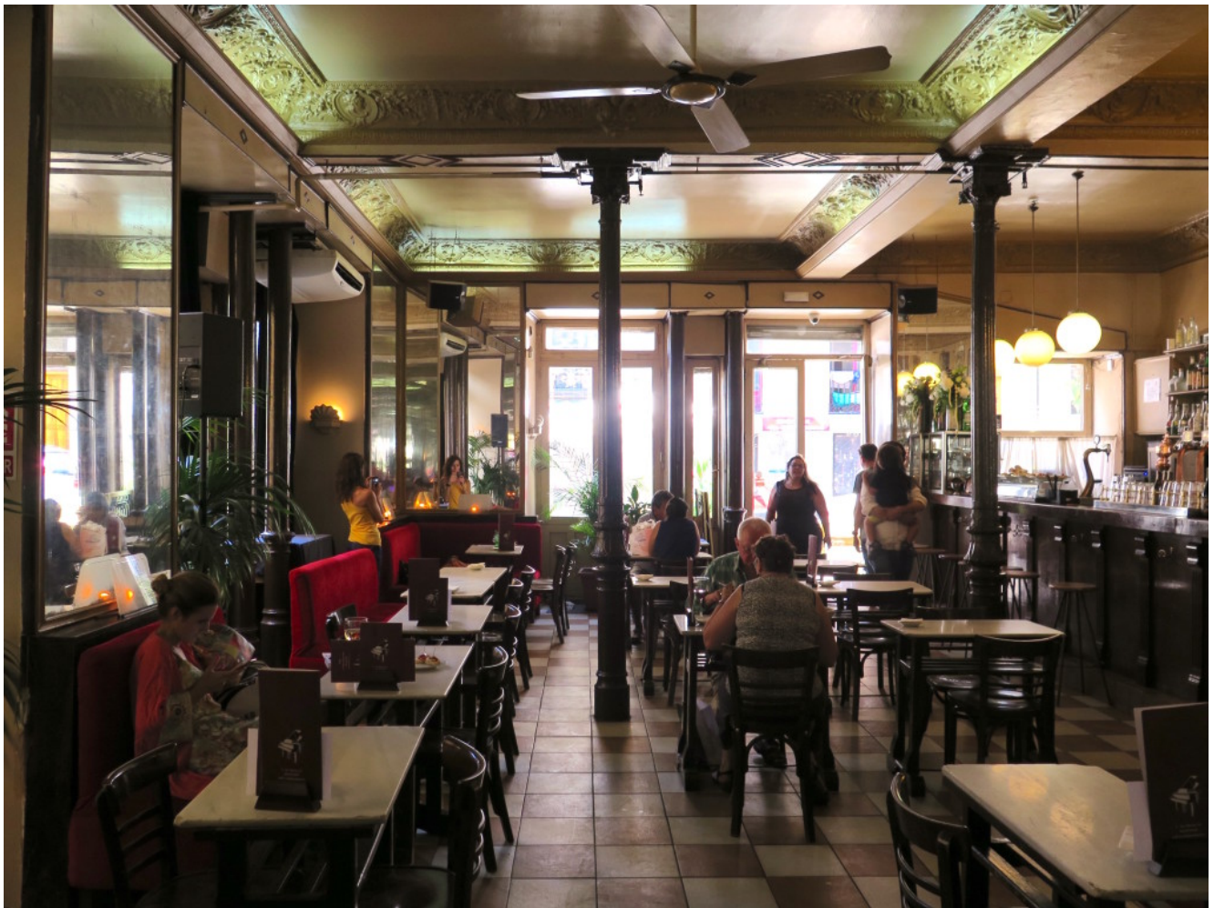
Café Barbieri by day

The worn white marble table tops and red velvet seating lining the dining area mark this place out as opulent, but that's really not the vibe – it's chilled and cosy and attracts a spectrum of people, from the intrepid tourist who's braved it down the hill, to the unassuming local who fancies a read of one of the papers on offer.