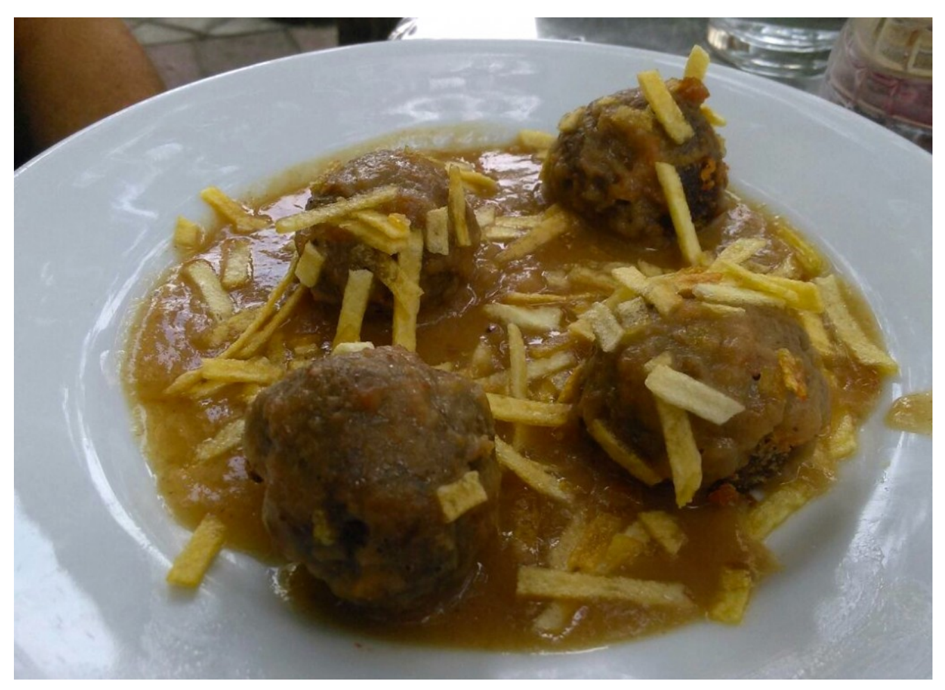
The albóndigas (meatballs) were amazing!

The entrecot was so big that we had to ask the waiter to split it in two. This pic only shows half.