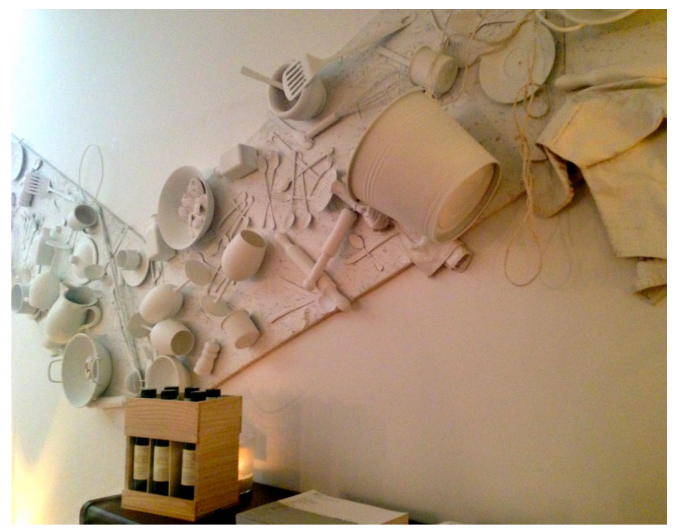
The decor is also original, elegant and minimalist.