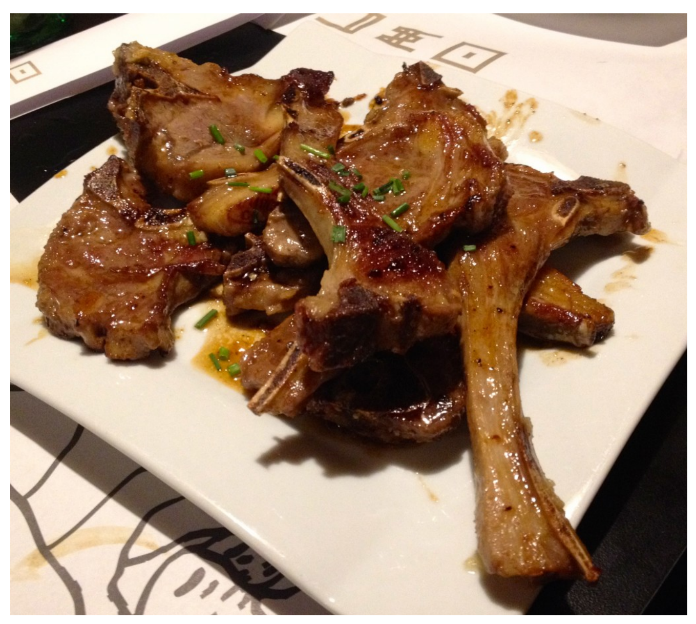
oooh.... the lamb chops

Eighteen packed punches of flavor... three rounds... This Japanese restaurant near metro Bilbao will have you scrambling to the finish line and gasping for air, making you and your friends feel like sumo wrestlers. Dining at Sumo is an experience.