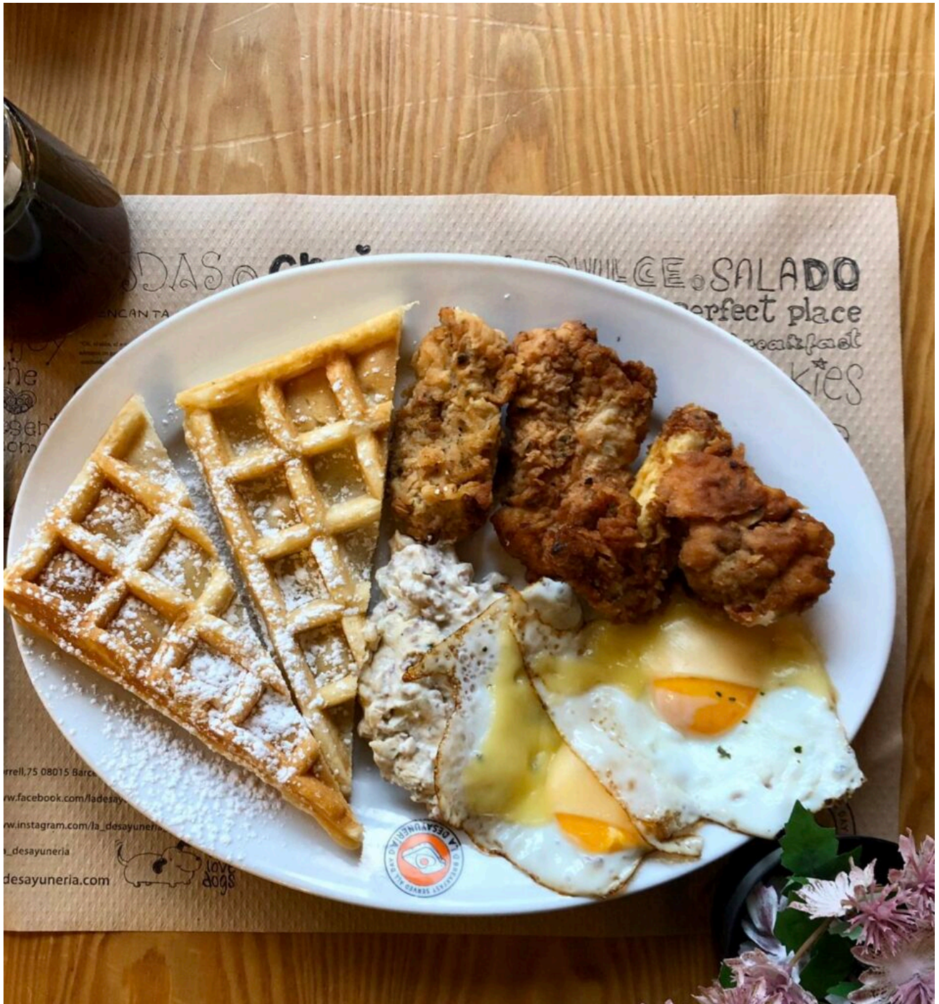
Chicken & waffles with fried eggs

To wet your whistle, choose from flavored lattes (they make their very own maple syrup which you can buy bottled), chai iced tea, fresh fruit smoothies, golden mylk, and more. Pick your favorite milk for coffee: dairy, oat, rice, soy, or almond.