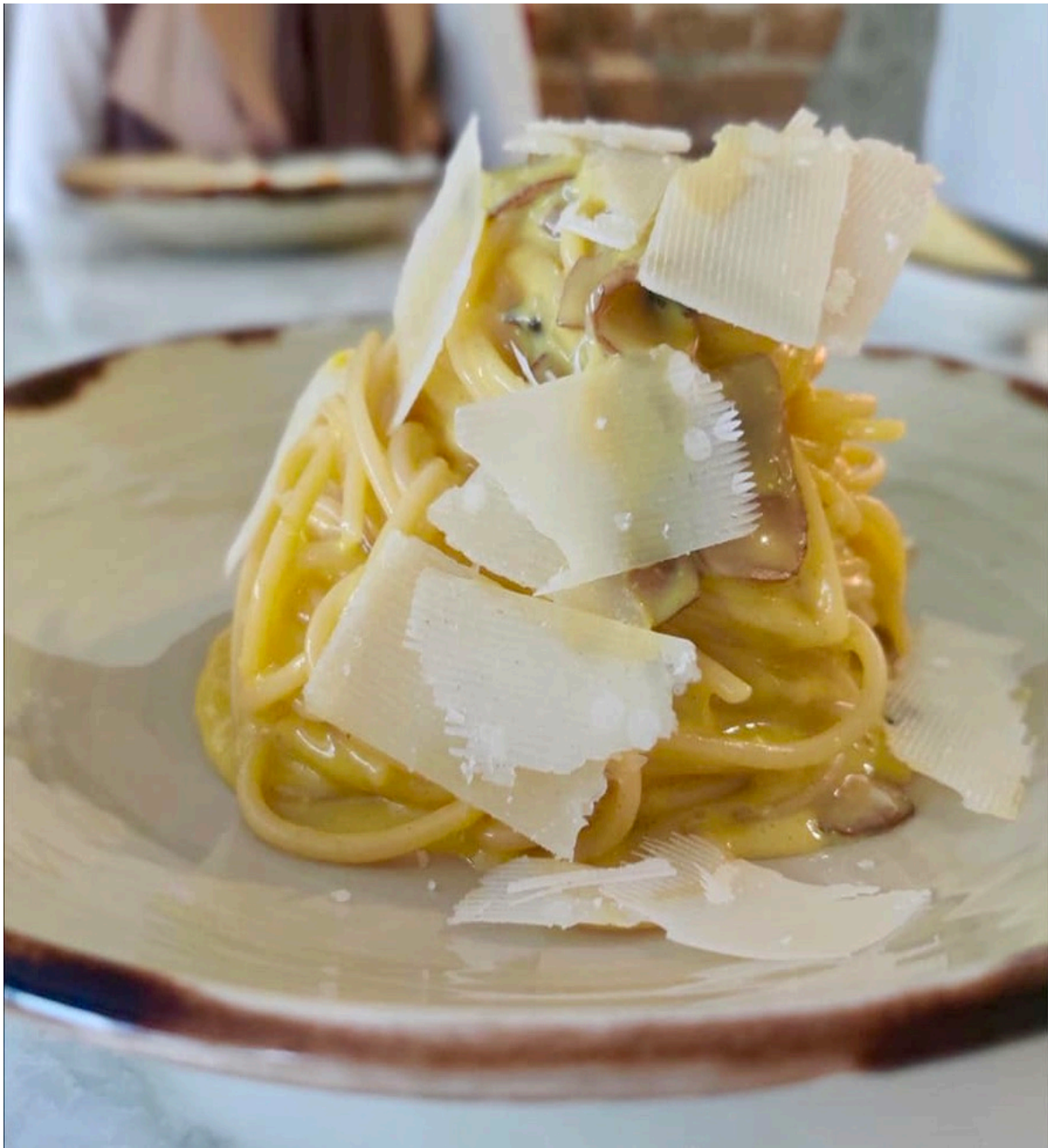
Spaghetti carbonara

I'm currently in the midst of a love affair with their gnocchi bravos, an Italian take on the Spanish classic. They're little panfried pockets of deliciousness, served with a spicy bravas sauce and a creamy alioli. Challenge yourself to share the dish: I inhale an entire serving these days and don't break a sweat.