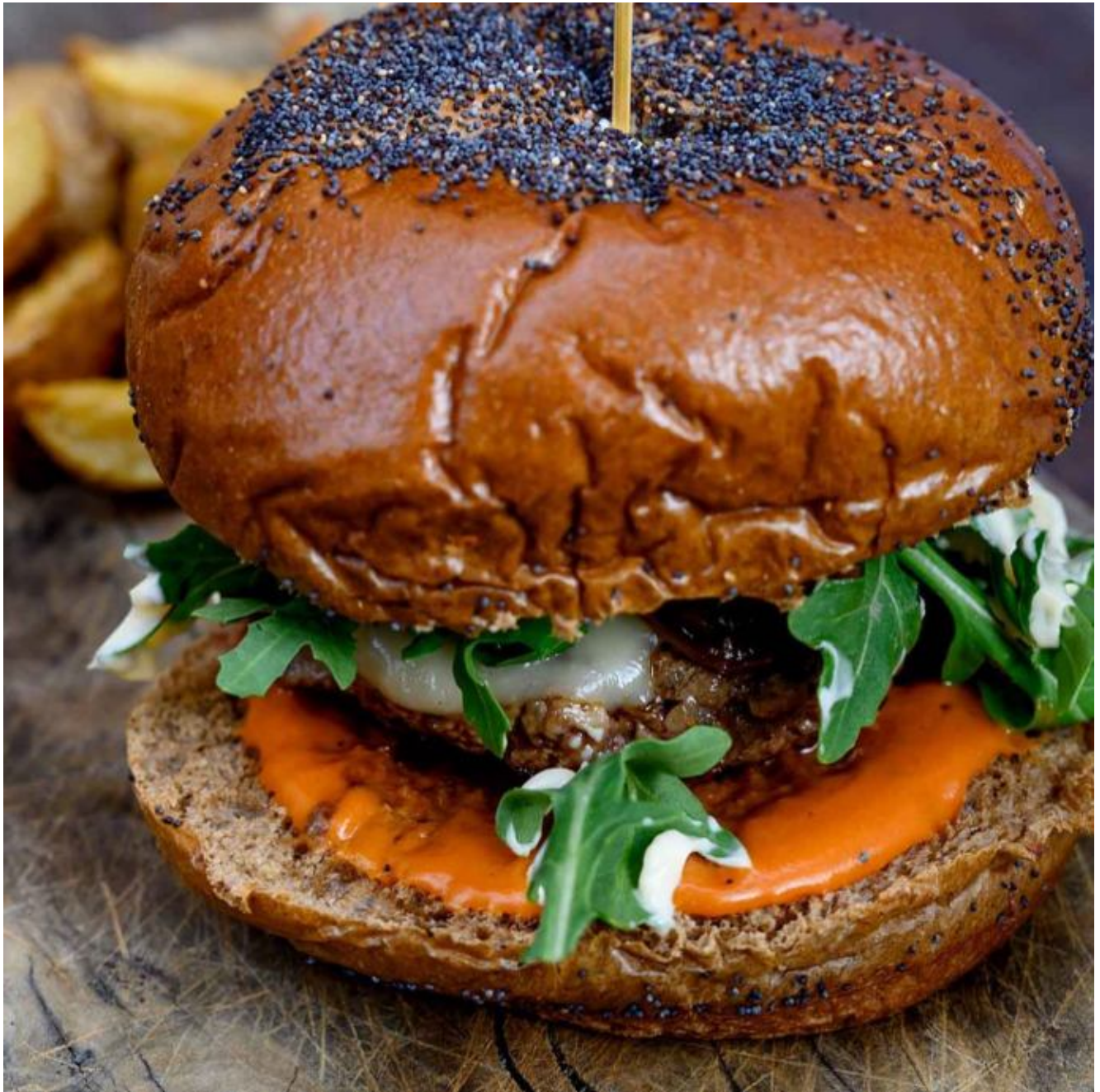
Classic Amicis Hamburger

onion and the secret (I forgot to ask what it was) house sauce. It made me very happy.