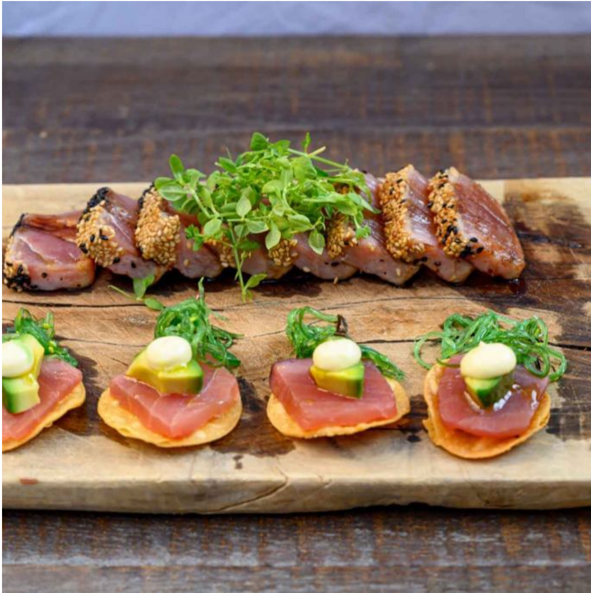
Red tuna tataki with sashimi, avocado and wasabi mayonnaise.