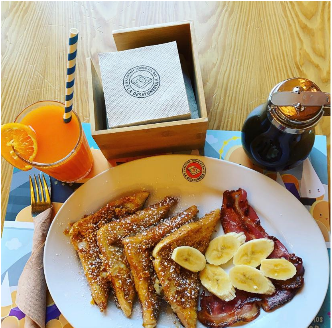
The Marie Antoinette

The backdrop for this greasy diner food wonderland is appropriate: kitschy Southern decor in a cozy spot nestled in the heart of Chueca. From the quirky dog painting at the entrance, to the neon sign that reads “Pancake House,” you’ll feel like you never left the cursed motherland.