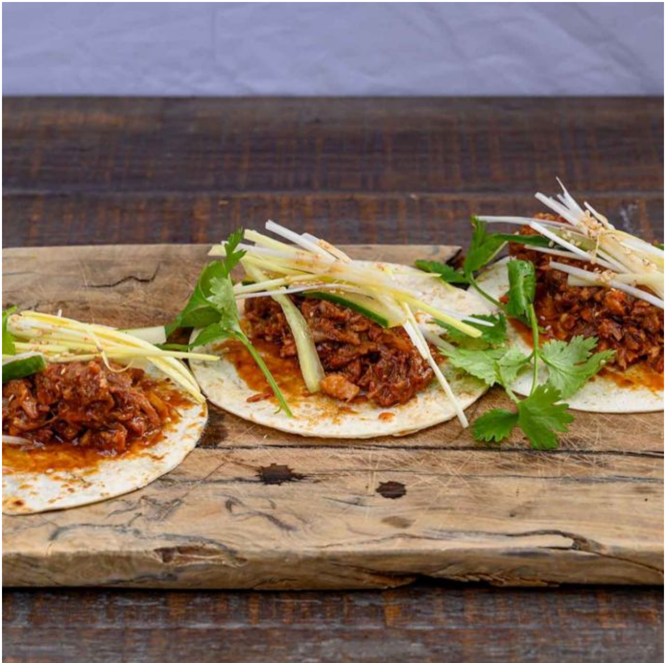
Peking duck tacos

As for the main dish, I have a rule now: “If they name a dish after the restaurant, I eat it.” For many years, I had problems deciding what to order, so I decided to always ask for anything that the restaurant considers deserving of its own name.