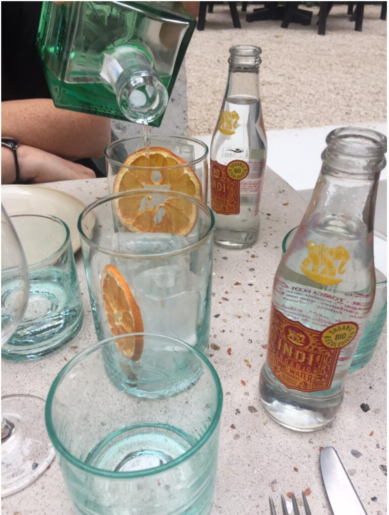
My organic aloe vera was served with a tonic hailing from Sevilla.