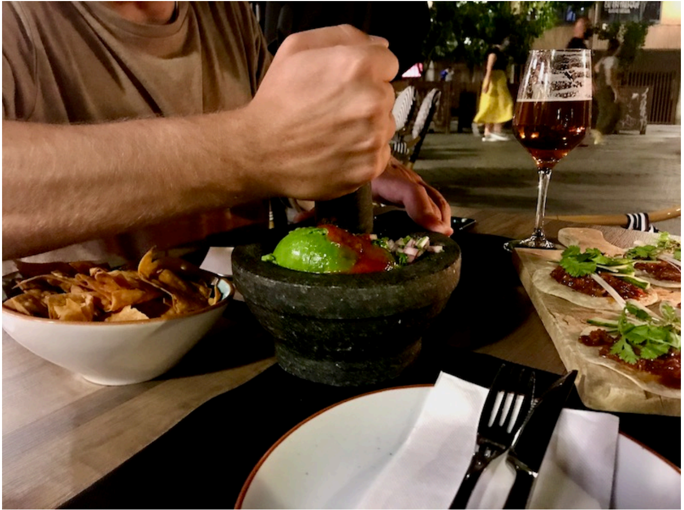
Guacamole in a mortar and pestle

Second, the Peking duck tacos that we'll be coming back for. You can't go wrong with either of these.