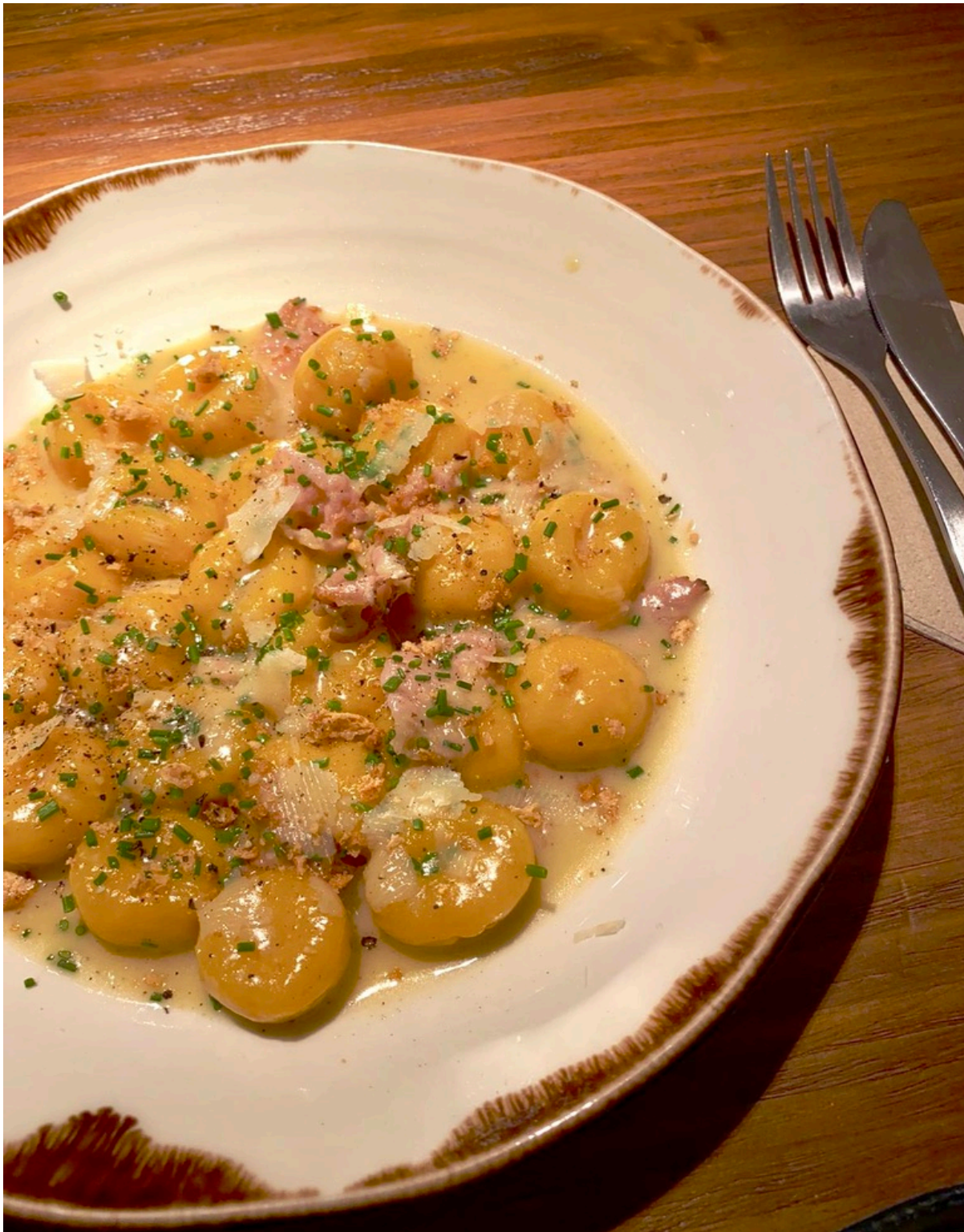
Pumpkin gnocchi with pancetta

In light of the weird times that we're currently living through, Nina's feels homely and a safe cocoon (when, frankly, the outside world is leaning heavily towards doom and gloom).