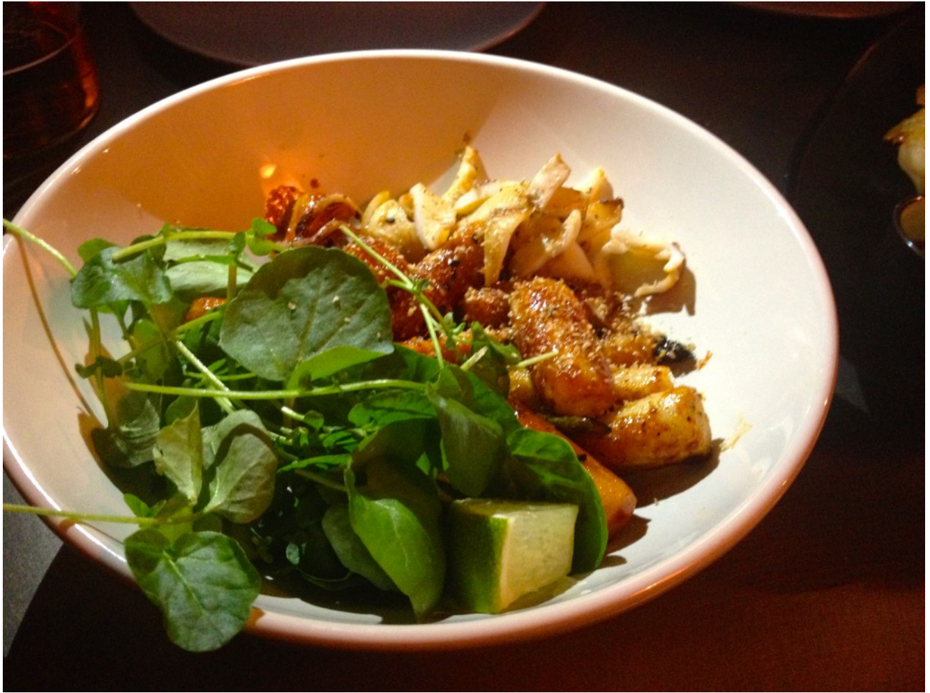
Chuka Ramen Dok Boki