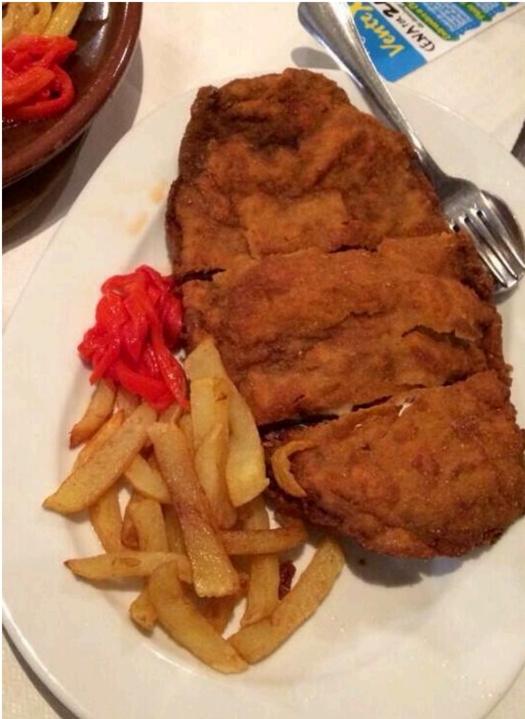
Cachopo at El Ñeru.

There are plenty of Asturian restaurants around this area but this one is my favourite. You can stand at the bar upstairs and gorge yourself on free tapas (try the cabrales cheese one) and dishes such as their magnificent cachopo, or you can take the weight off your feet and dine in the cavernous restaurant downstairs. It isn't the cheapest but it's worth it for the exquisite (and extremely filling!) food and excellent service.