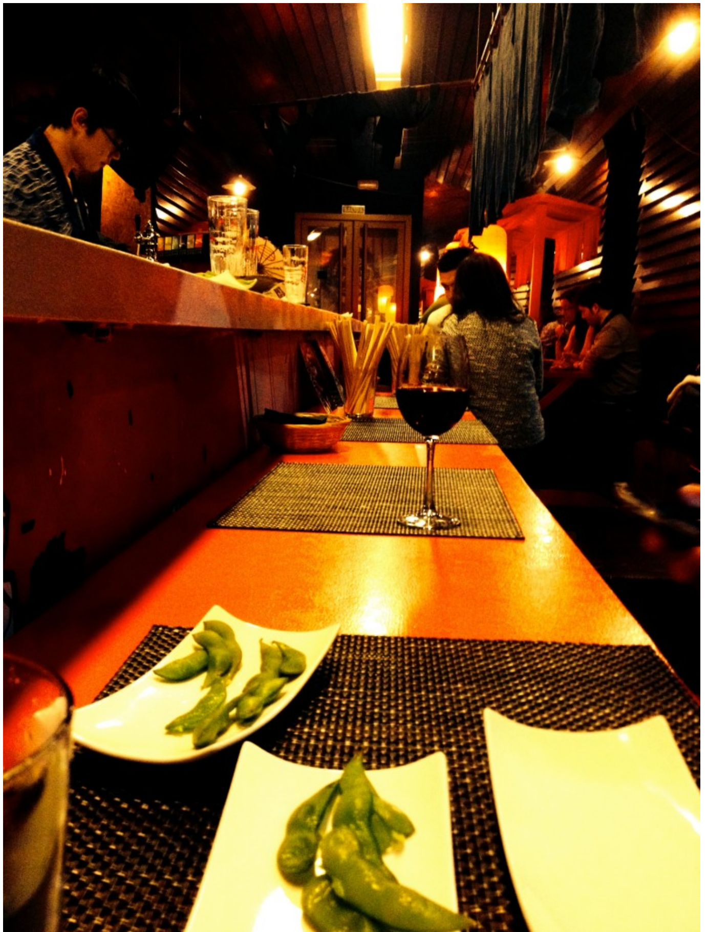
Located a few steps from Gran Vía, Hattori Hanzo is a Japanese izakaya , meaning a casual bar that acts as a