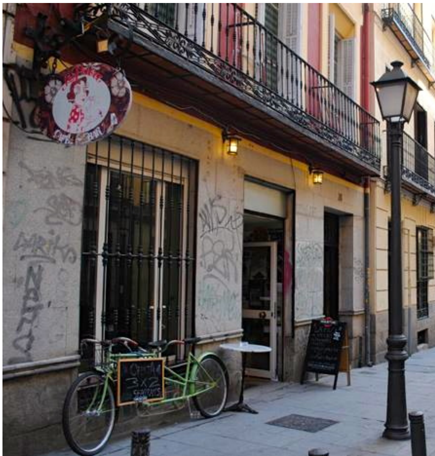
La Paca's facade on calle Valverde in Malasaña

As you walk through La Paca 's door, you feel like you're in the right place. This funky café in Malasaña is always a good choice when you're in the mood for a coffee, a beer, or something stronger.