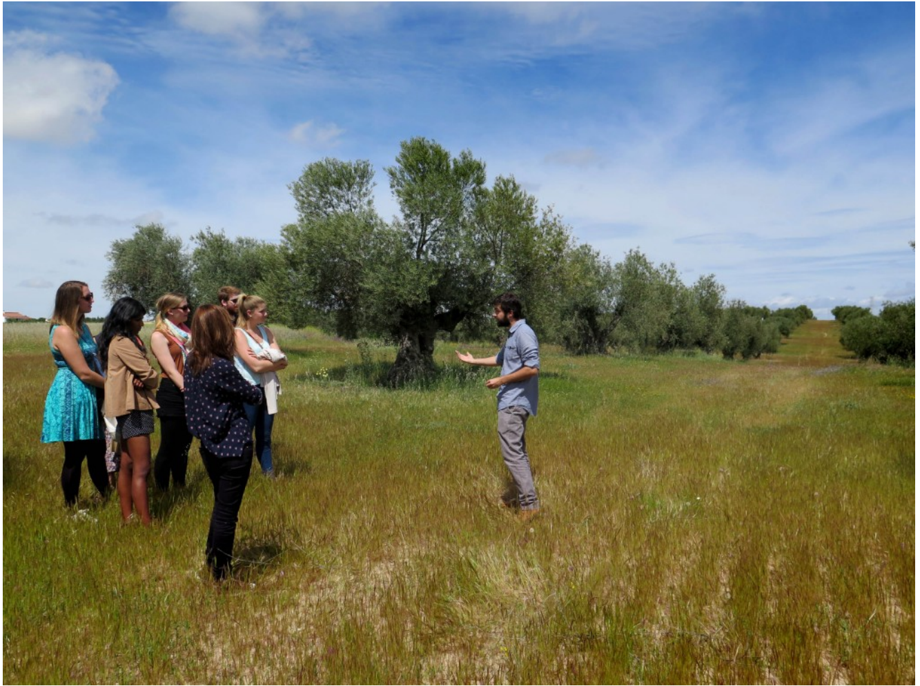
The walking tour begins