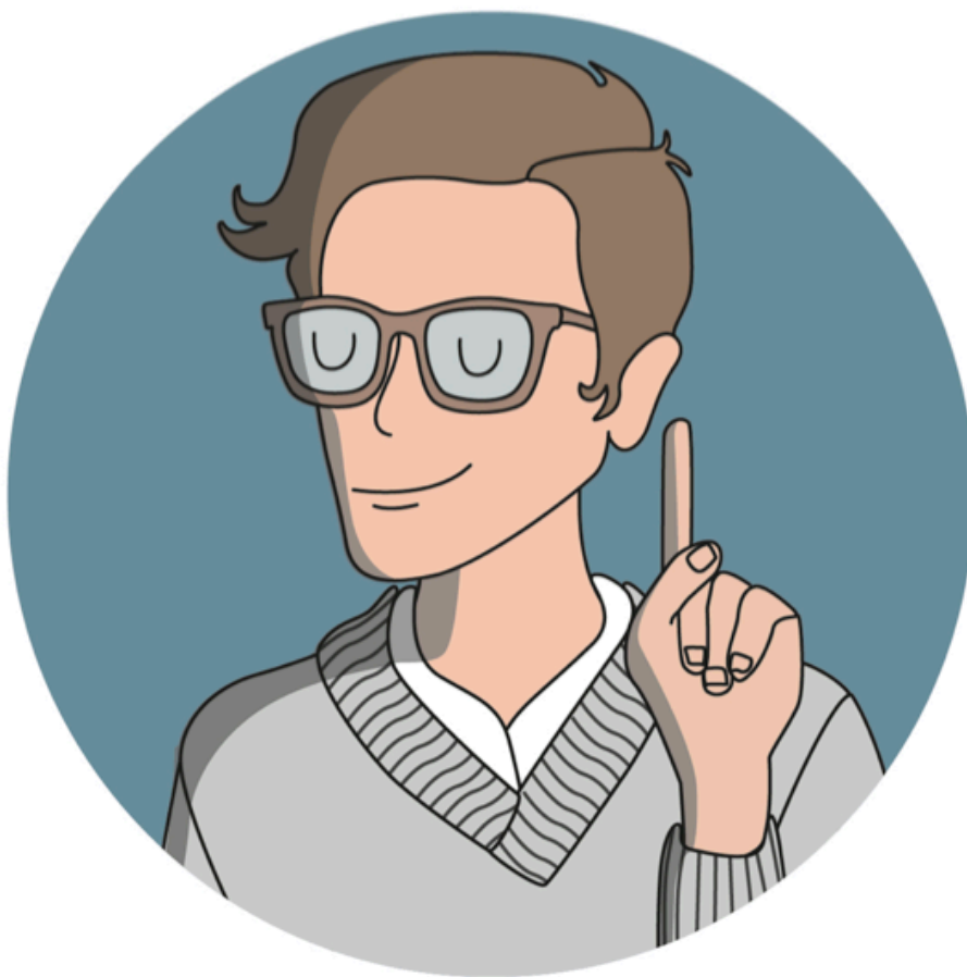
El Cooltureta, the protagonist of the first book

Each panel portrays a broad spectrum of scenarios that young people can relate with— dealing with roommates, unrequited love, awkward communications via Whatsapp and the troubles that stem from relentless over thinking.