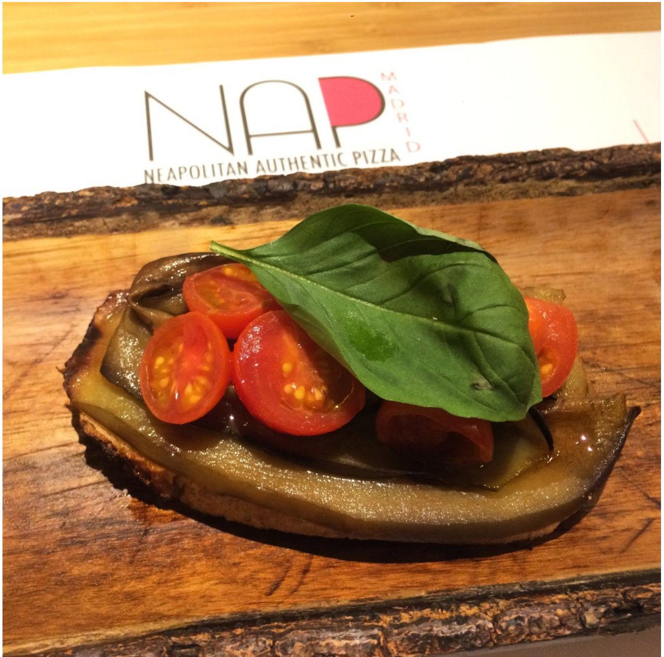
Eggplant bruschetta, one of the four varieties offered

bruschetta, burrata, and baked eggplant, plus tiramisu for dessert. If you're going for the full experience, have a limoncello digestif, and then sit back and enjoy the satisfaction that only pizza can impart.