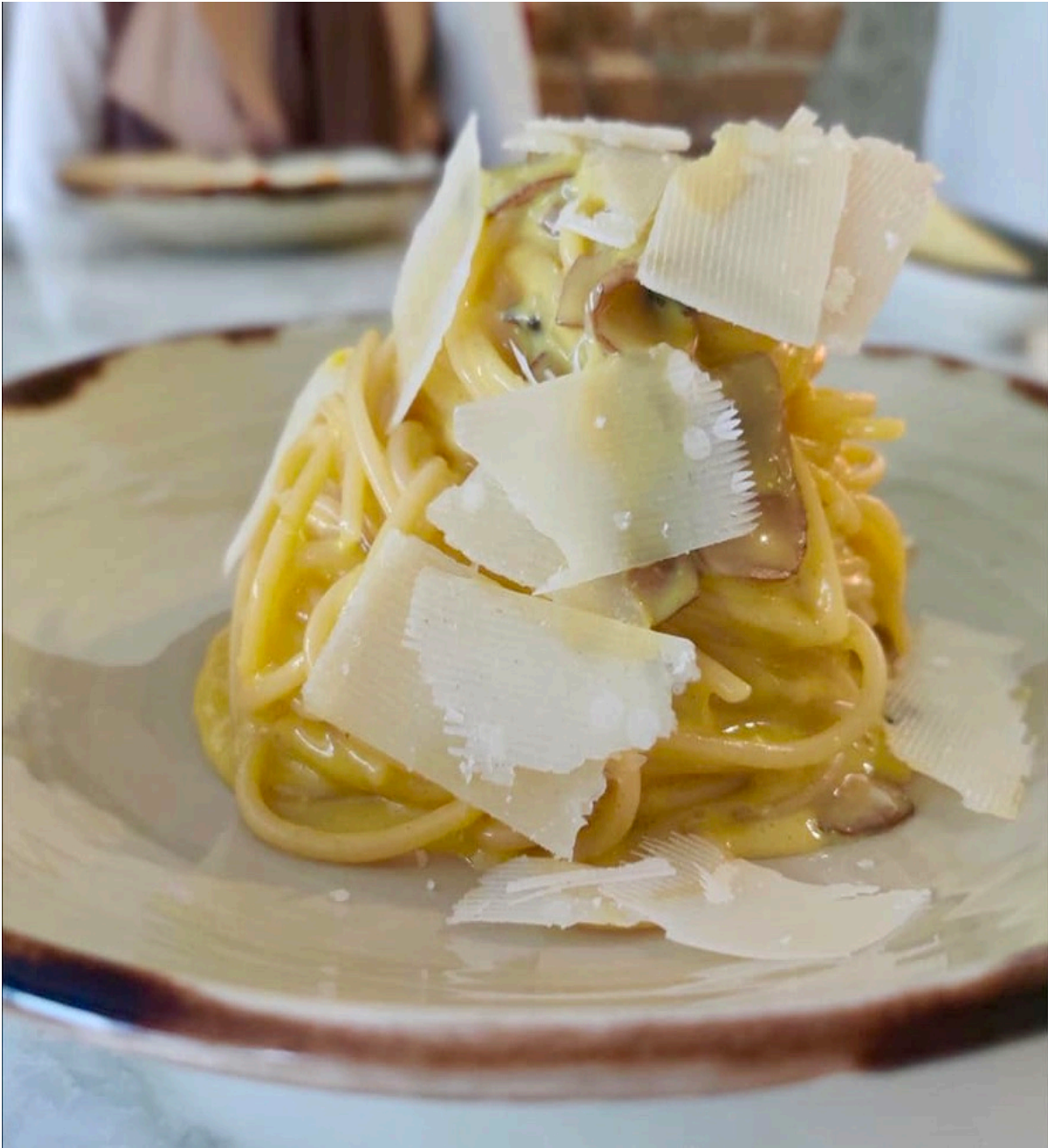
Spaghetti carbonara

I'm currently in the midst of a love affair with their gnocchi bravos, an Italian take on the Spanish classic. They're little panfried pockets of deliciousness, served with a spicy bravas sauce and a creamy alioli. Challenge yourself to share the dish: I inhale an entire serving these days and don't break a sweat.