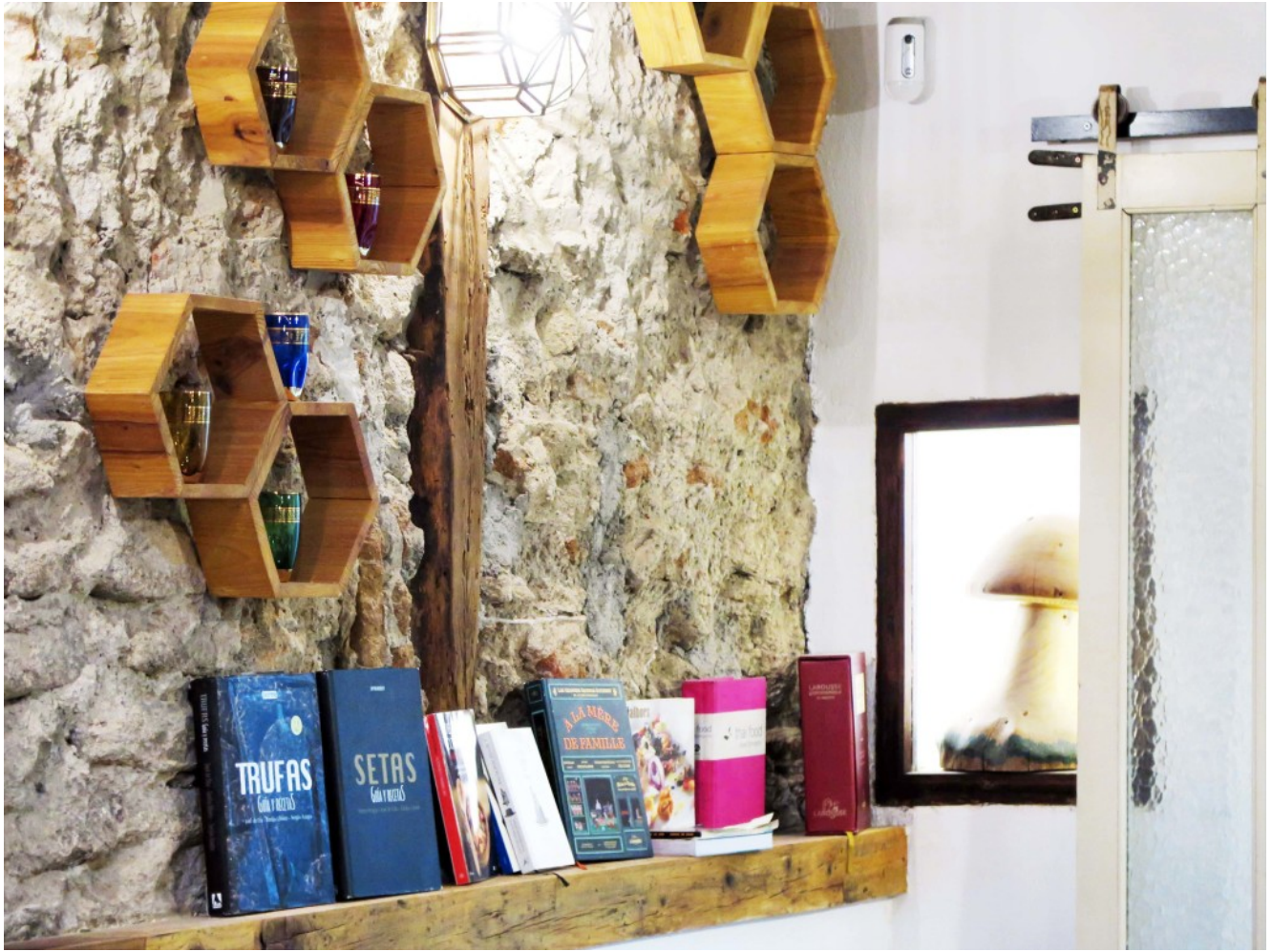
Various gospels of the mushroom bible