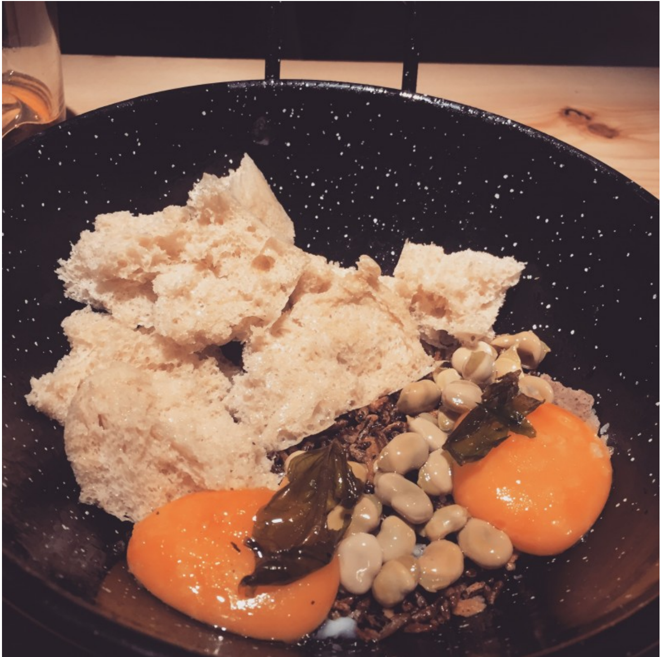
Huevos divorciados- the “must-have” dish

fool you; the thing is that one one side that looks like potatoes is actually the egg white. As the name implies, the whites and the yolks are separated. And like a good Spaniard, you put the egg white as if it were a potato by dipping it in the yolk and mixing bites of seeds and lima beans.